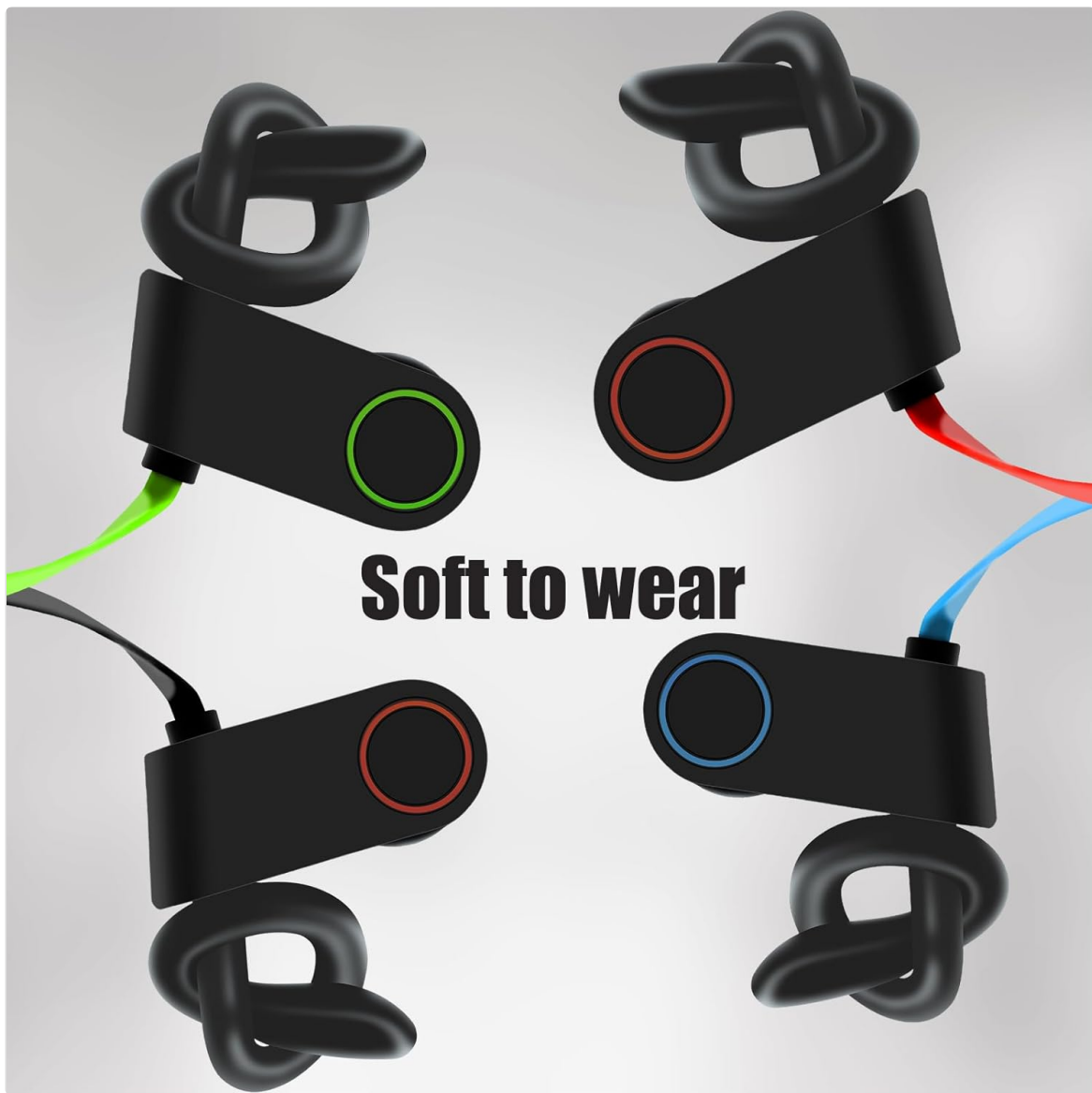
Image 2: Flexible Design. This image highlights the soft and flexible nature of the neckband, designed for comfortable wear and easy storage.