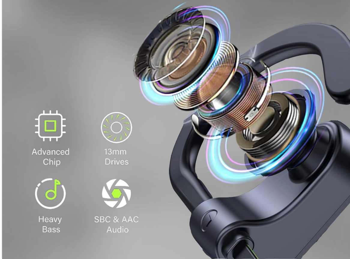
Image 5: Immersive Sound Quality. This image details the audio technology, including an advanced chip, 13mm dynamic drivers for powerful bass and clear treble, and support for SBC & AAC audio codecs.

13mm large-size dynamic driver powerful bass and stunning treble