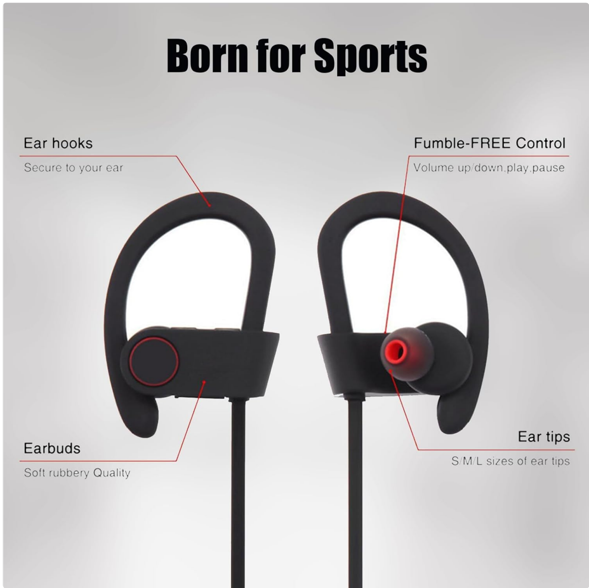
Image 1: Headphone Components. This image illustrates the key components of the Xmenha D20 headphones, including the ear hooks for secure fit, the earbuds, replaceable ear tips (S, M, L sizes), and the integrated control buttons for volume and playback.