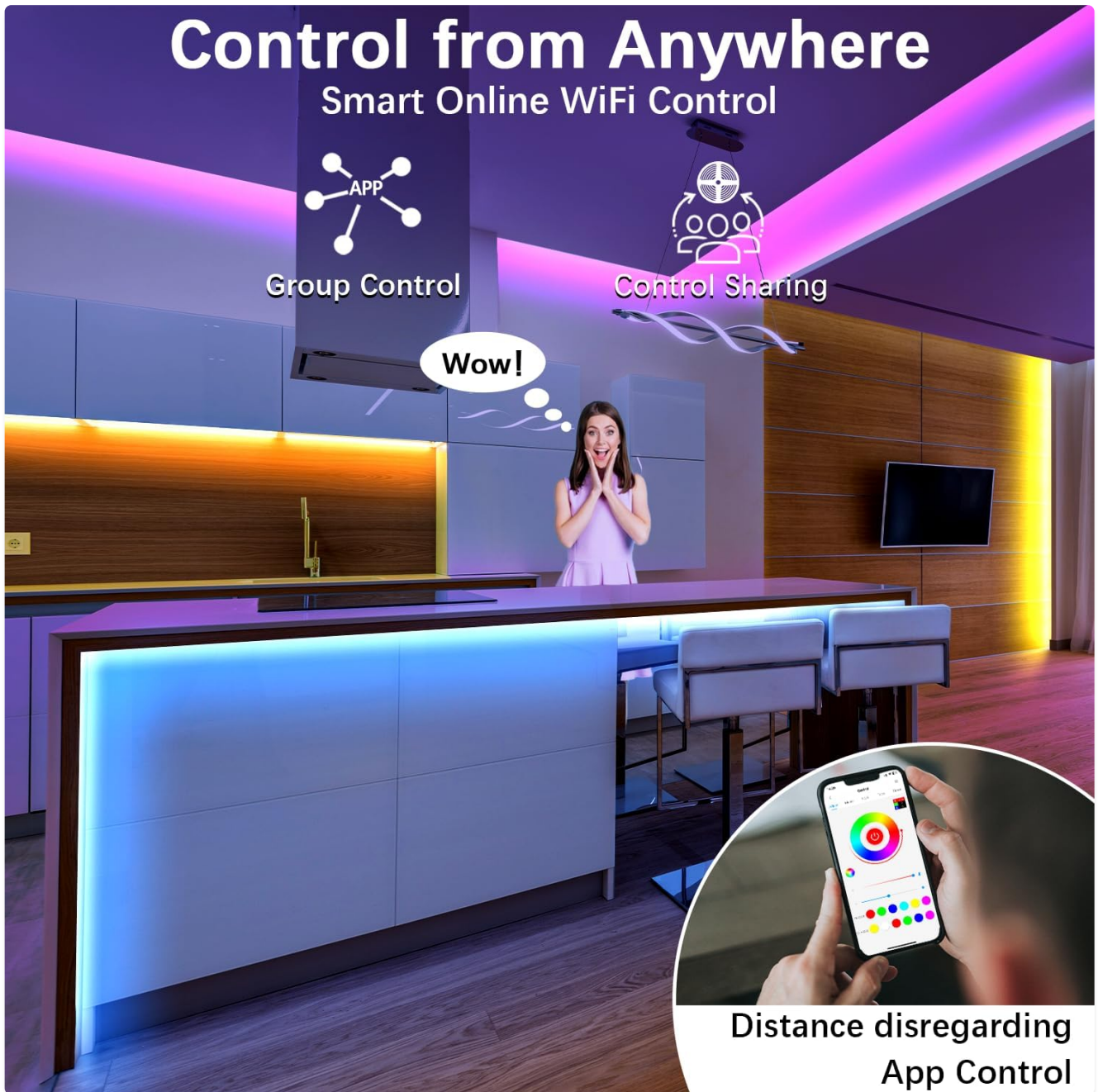
Image: Mobile app interface demonstrating remote control capabilities, group control, and control sharing.