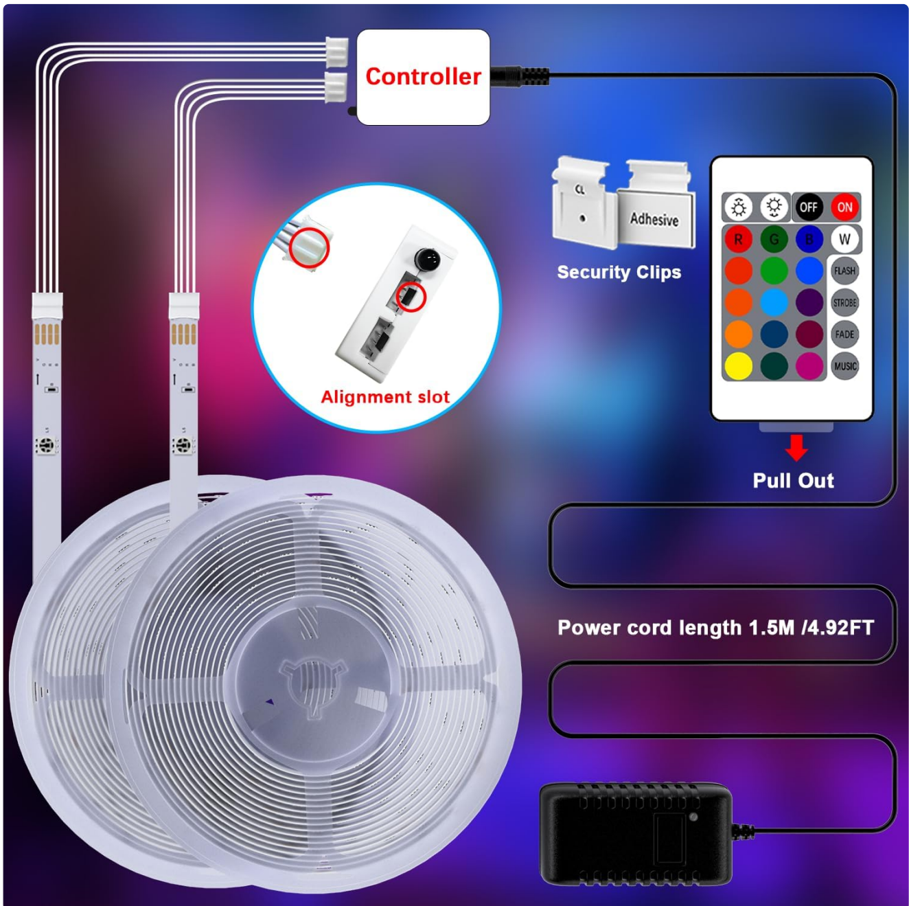
Image: Illustration of connecting the LED strips to the controller and power supply, highlighting alignment slots and security clips.