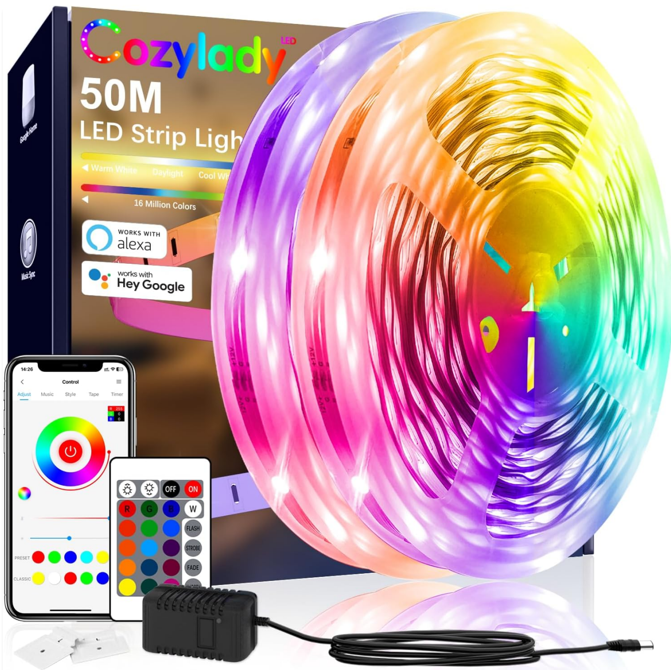
Image: Overview of the Cozylady 146ft Smart LED Strip Lights and included accessories.