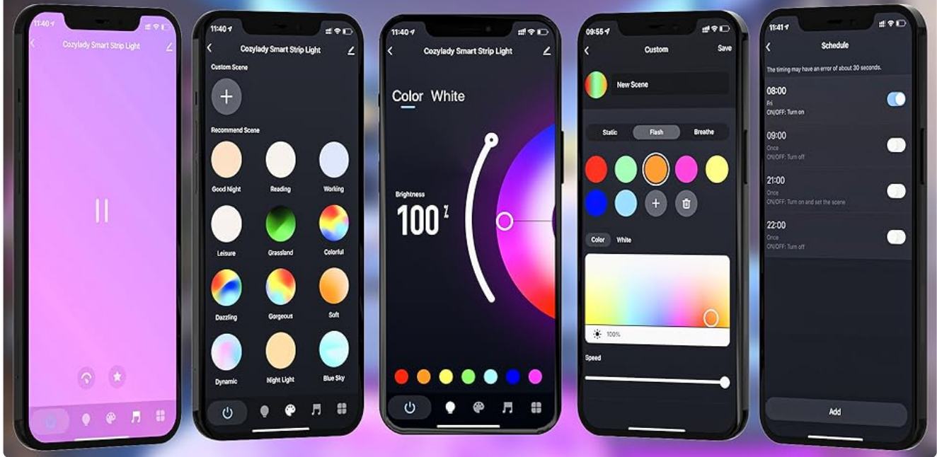
Image: Visual representation of the three primary control methods: voice, mobile application, and remote control.