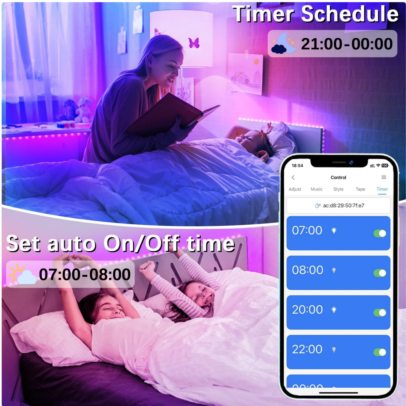
Image: Screenshots illustrating the timer and scheduling functions within the mobile application.