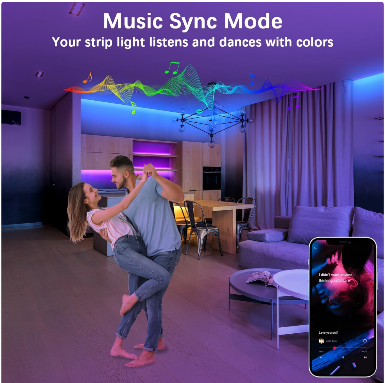
Image: A room illuminated by LED strip lights dynamically changing colors in response to music.