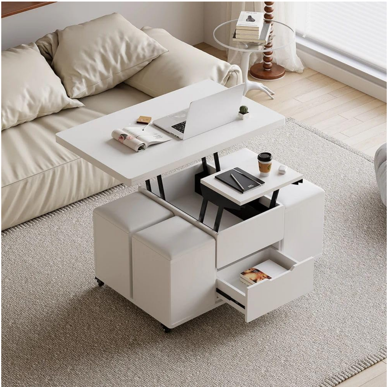
Image: The Homary Lift Top Coffee Table in its compact coffee table configuration, showcasing its sleek design and integrated stools.