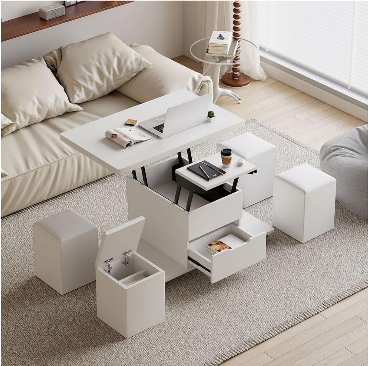
Image: The table with its lift-top extended, providing a convenient surface for a laptop and beverages, ideal for a temporary workspace.

Video: A brief demonstration of the Homary Lift Top Coffee Table's features, including the lift mechanism, storage, and stools.