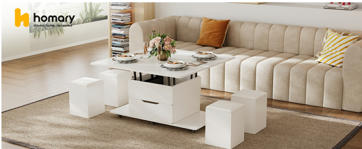
Image: The Homary 3-in-1 Foldable Coffee Table demonstrating its versatility as a coffee table, office table, and dining table.