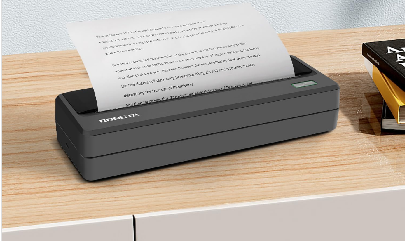
Image: The portable printer in use with a laptop, demonstrating its compact size and suitability for mobile office environments.