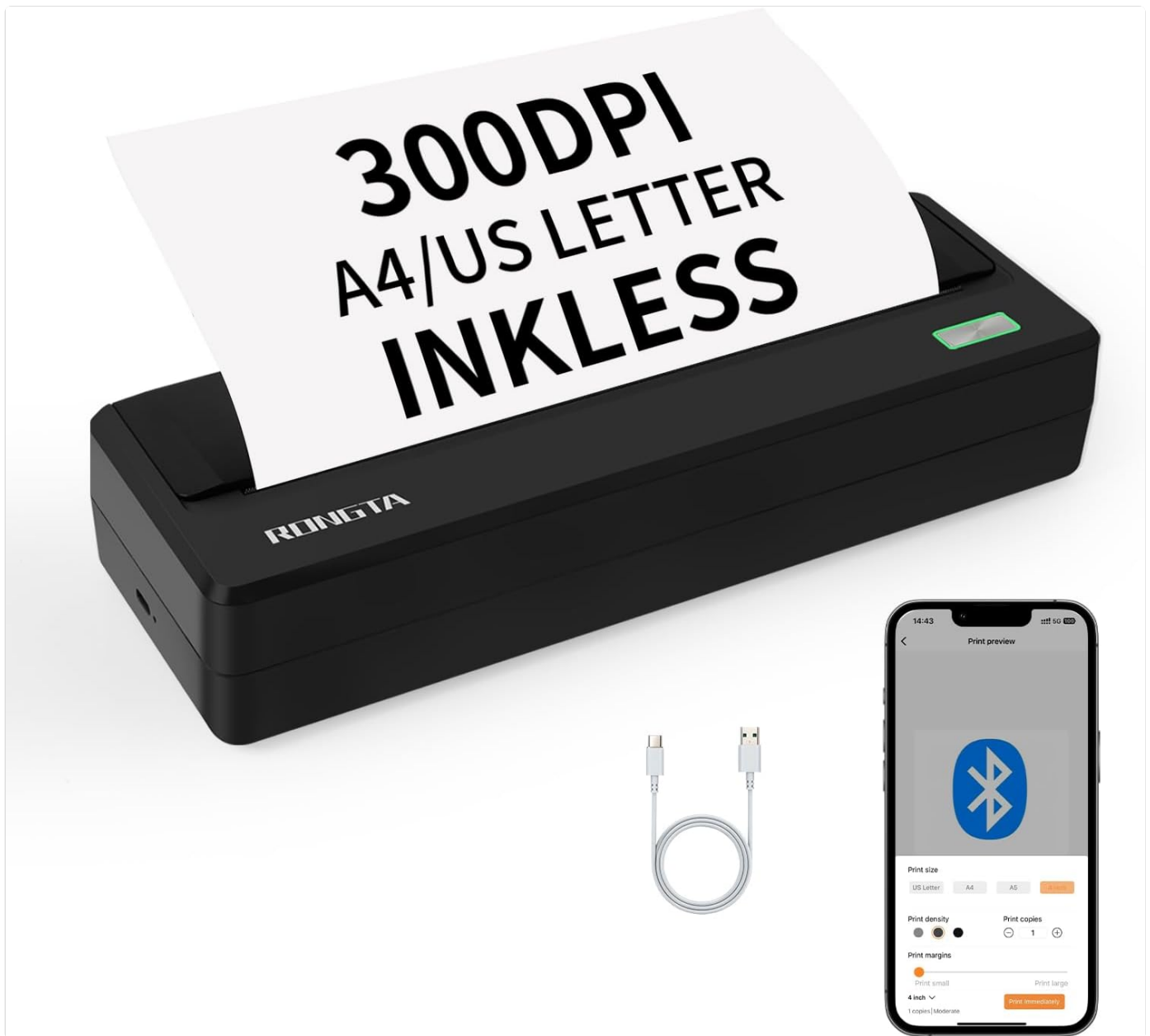
Image: The Rongta Portable Printer, highlighting its 300DPI, A4/US Letter, and inkless capabilities.