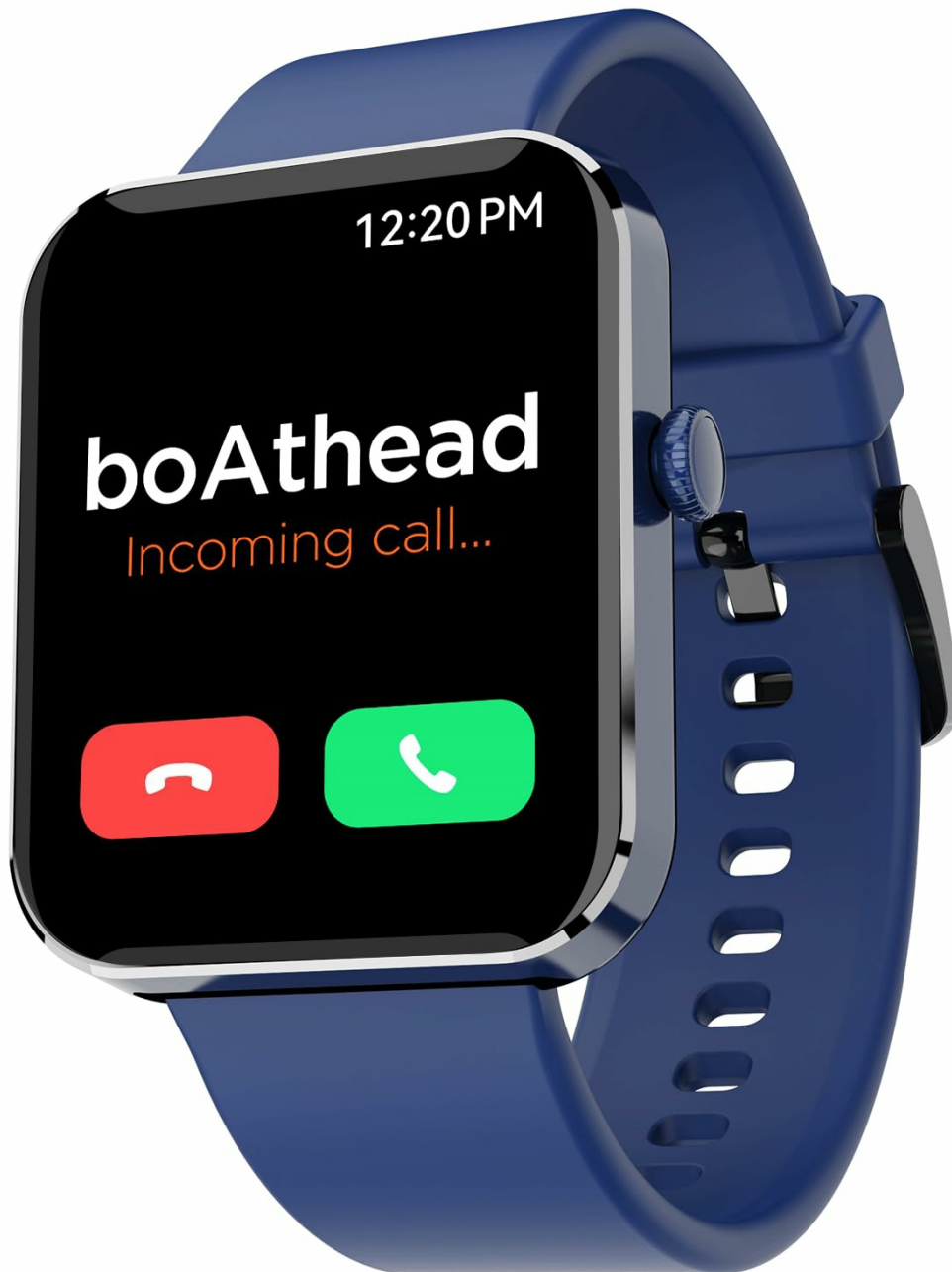
Image: The smartwatch screen showing an incoming call notification, demonstrating the Bluetooth calling feature. Users can accept or decline calls directly from the watch.

The Wave Flex Connect supports Bluetooth calling, allowing you to make and receive calls directly from your wrist when connected to your smartphone.