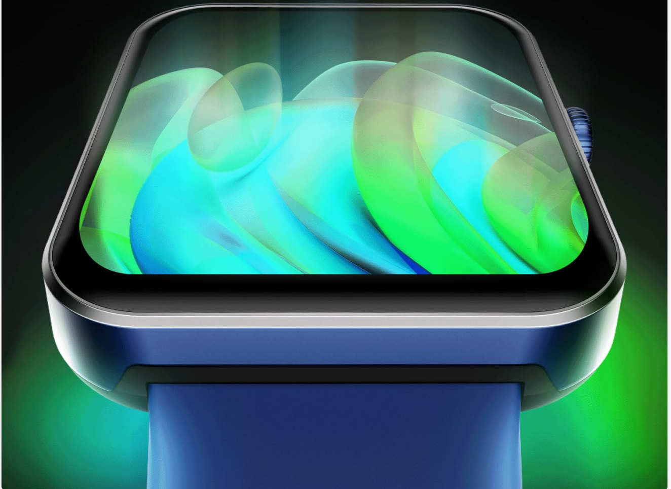
Image: A close-up of the smartwatch display, emphasizing its 1.83" HD screen, 240x280 resolution, 2.5D curve, and 550 Nits brightness for clear visibility.

Wake Gesture | 240 x 280 Resolution 2.5D Curve Display | 550 Nits Brightness