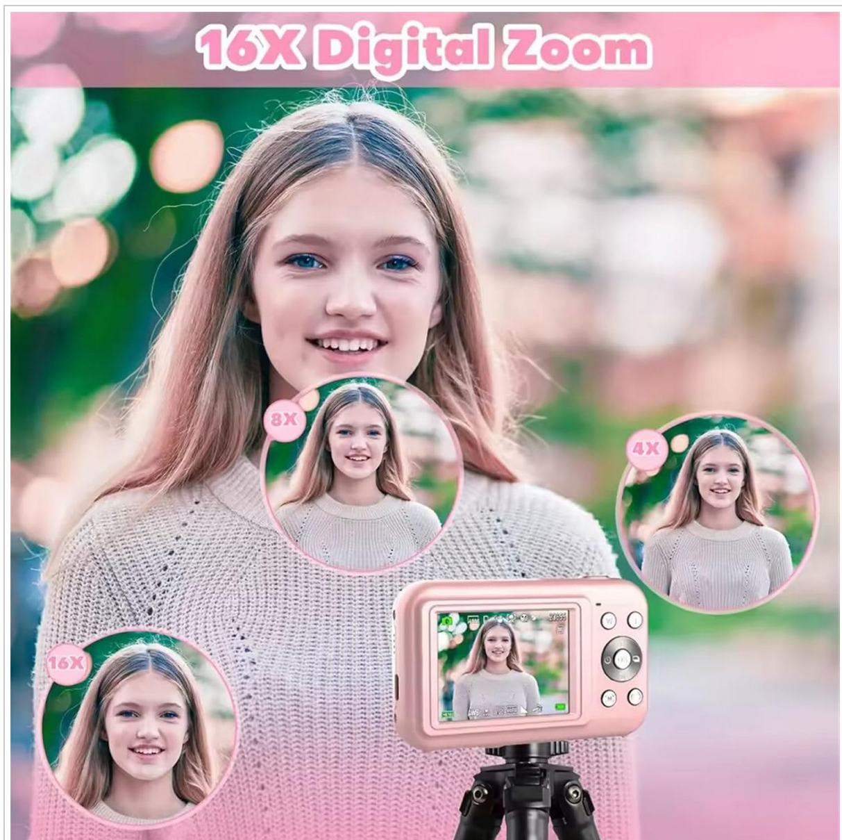
Image: Demonstration of the camera's 16X digital zoom, showing varying levels of magnification on a subject.