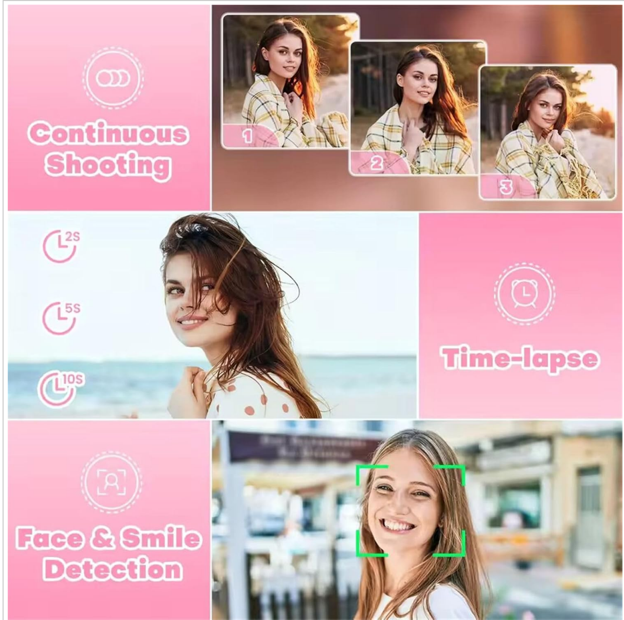
Image: Visual representation of continuous shooting, time-lapse settings, and face/smile detection features.