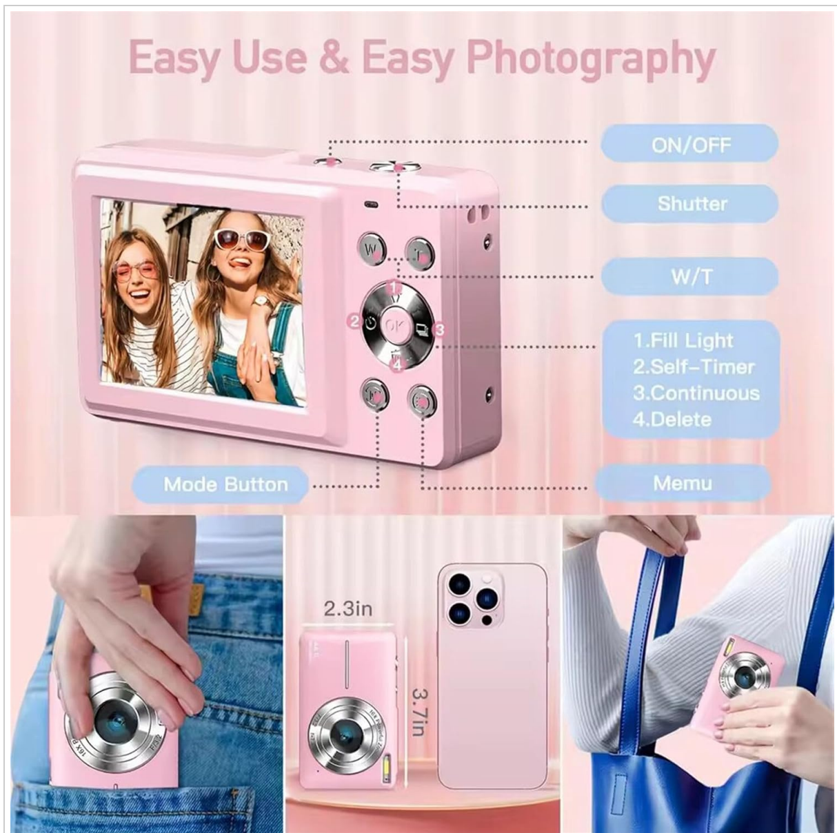
Image: Labeled diagram showing the camera's controls and their respective functions for easy operation.