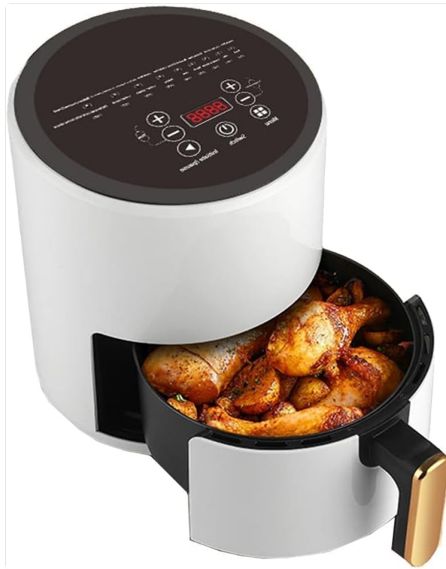
Image: The TEMKIN 6L Air Fryer with its nonstick basket pulled out, containing cooked chicken pieces.