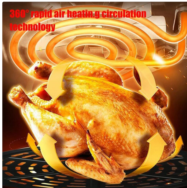
Image: An internal diagram illustrating the 360-degree rapid air heating circulation technology, ensuring even cooking.