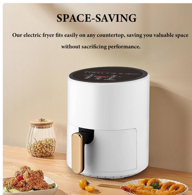
Image: The compact TEMKIN 6L Air Fryer positioned on a kitchen counter, demonstrating its space-saving design.