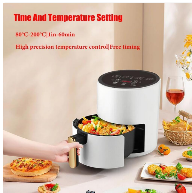
Image: The air fryer displaying its digital time and temperature settings, indicating a range of 80°C-200°C and 1-60 minutes.