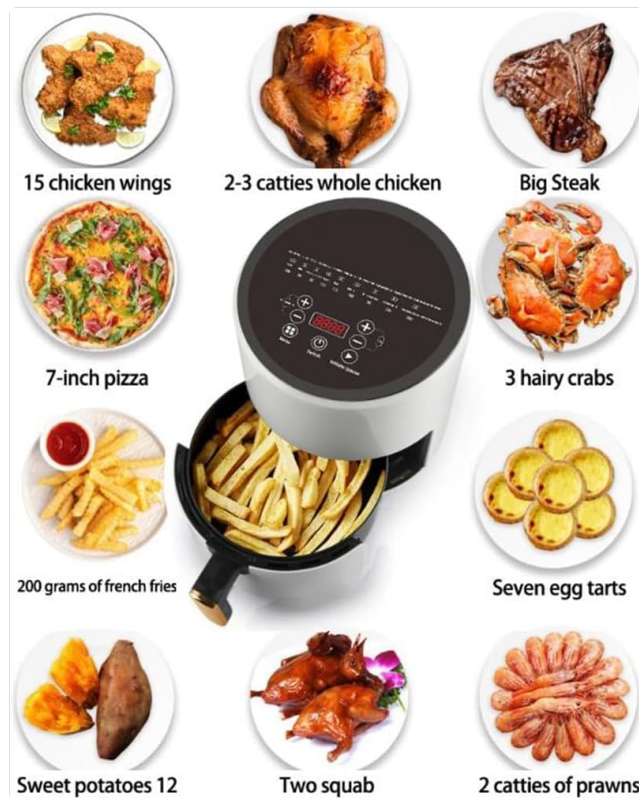
Image: A detailed view of the air fryer's touch control panel, showing temperature, time, menu, and power buttons.

The air fryer features an intuitive LCD touch screen control panel for easy operation. Key functions include: