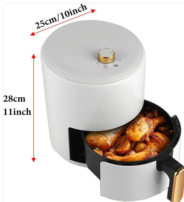
Image: Diagram illustrating the physical dimensions of the air fryer, showing a width of 25cm (10 inches) and a height of 28cm (11 inches).