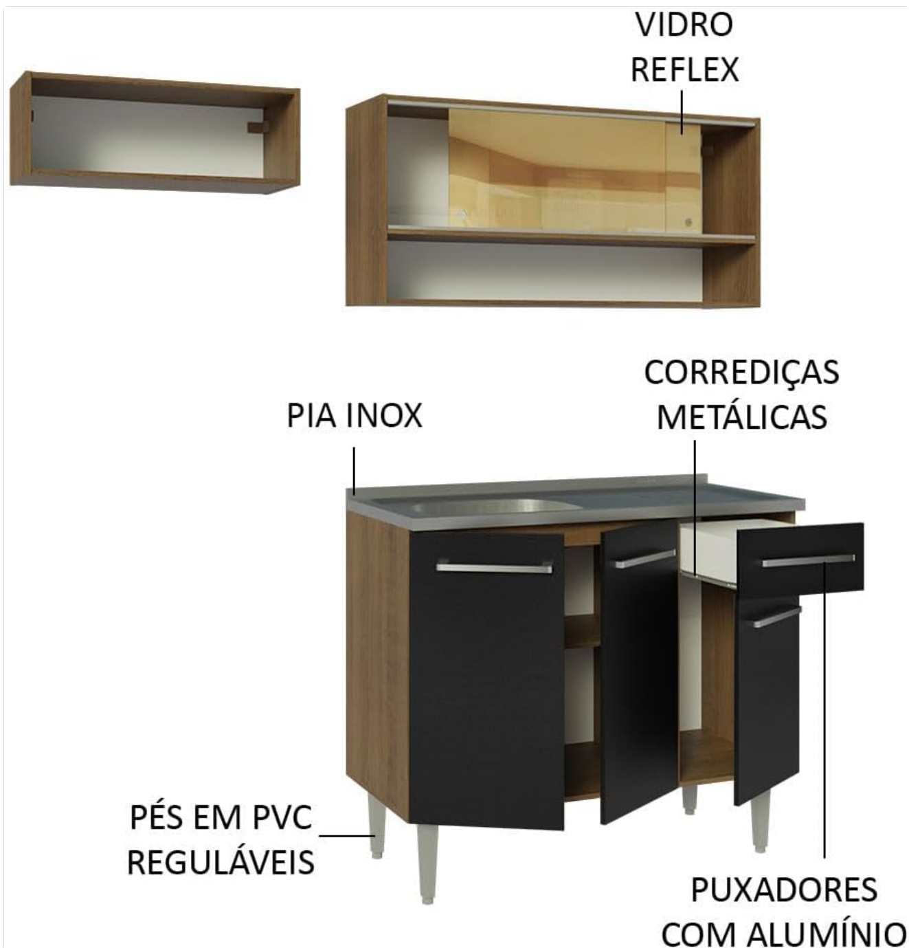
Figure 3.2: Visual breakdown of key components such as the stainless steel sink, metallic slides, adjustable PVC feet, and aluminum handles.