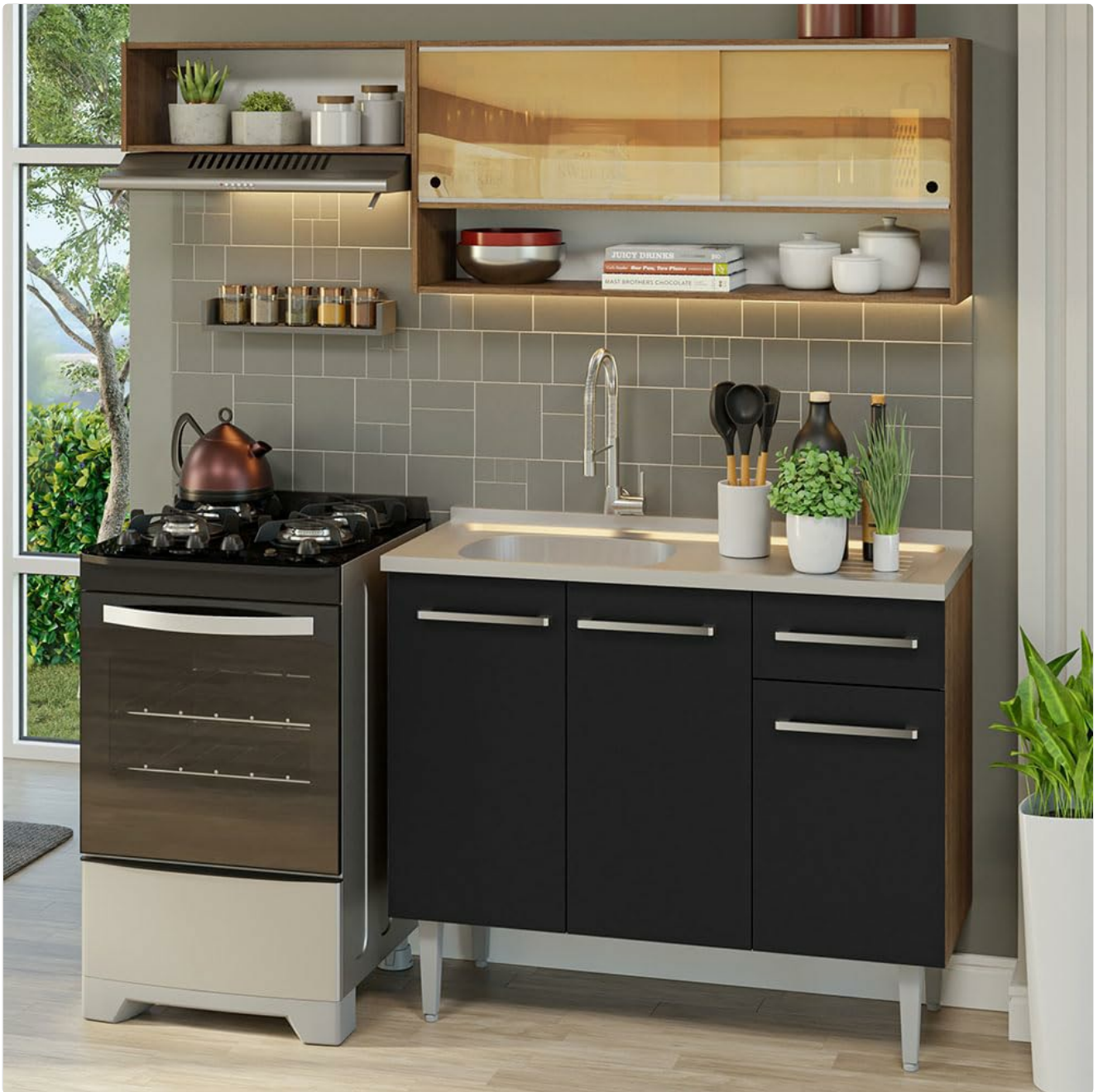
Figure 2.1: Full view of the Madesa Emily 01 Modular Kitchen.