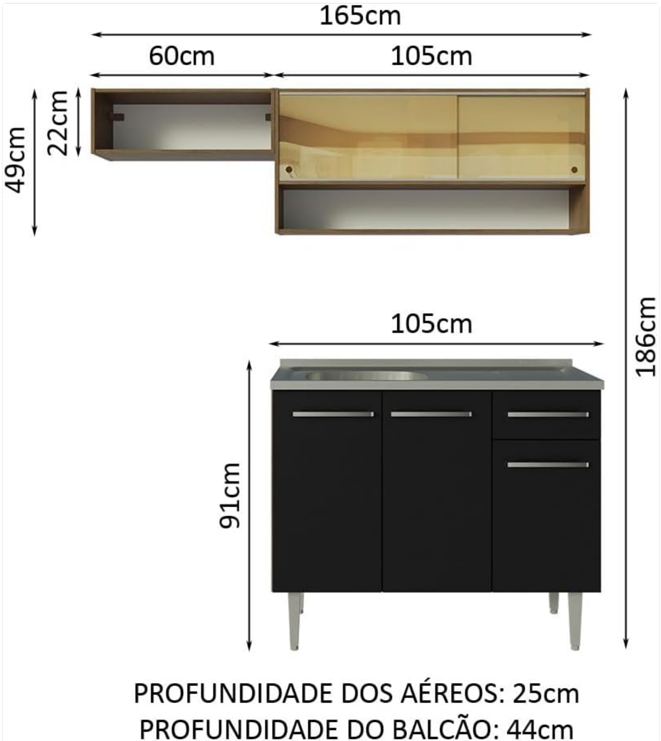
Figure 3.1: Detailed dimensions of the Madesa Emily 01 Modular Kitchen components, including aerial and counter depths.