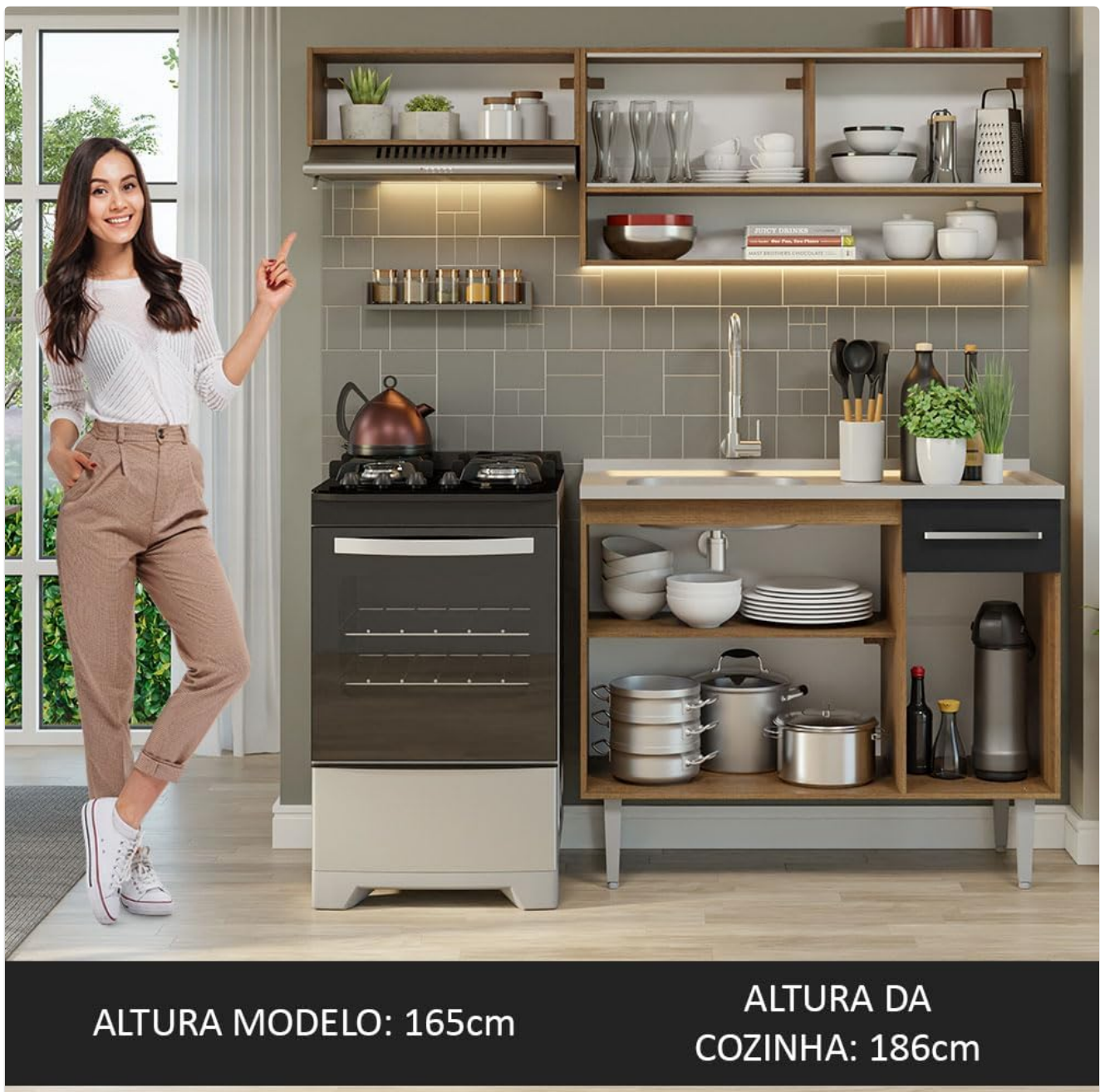
Figure 2.3: A lifestyle image of the Madesa Emilly 01 Modular Kitchen, demonstrating its aesthetic appeal and practical use in a home setting.