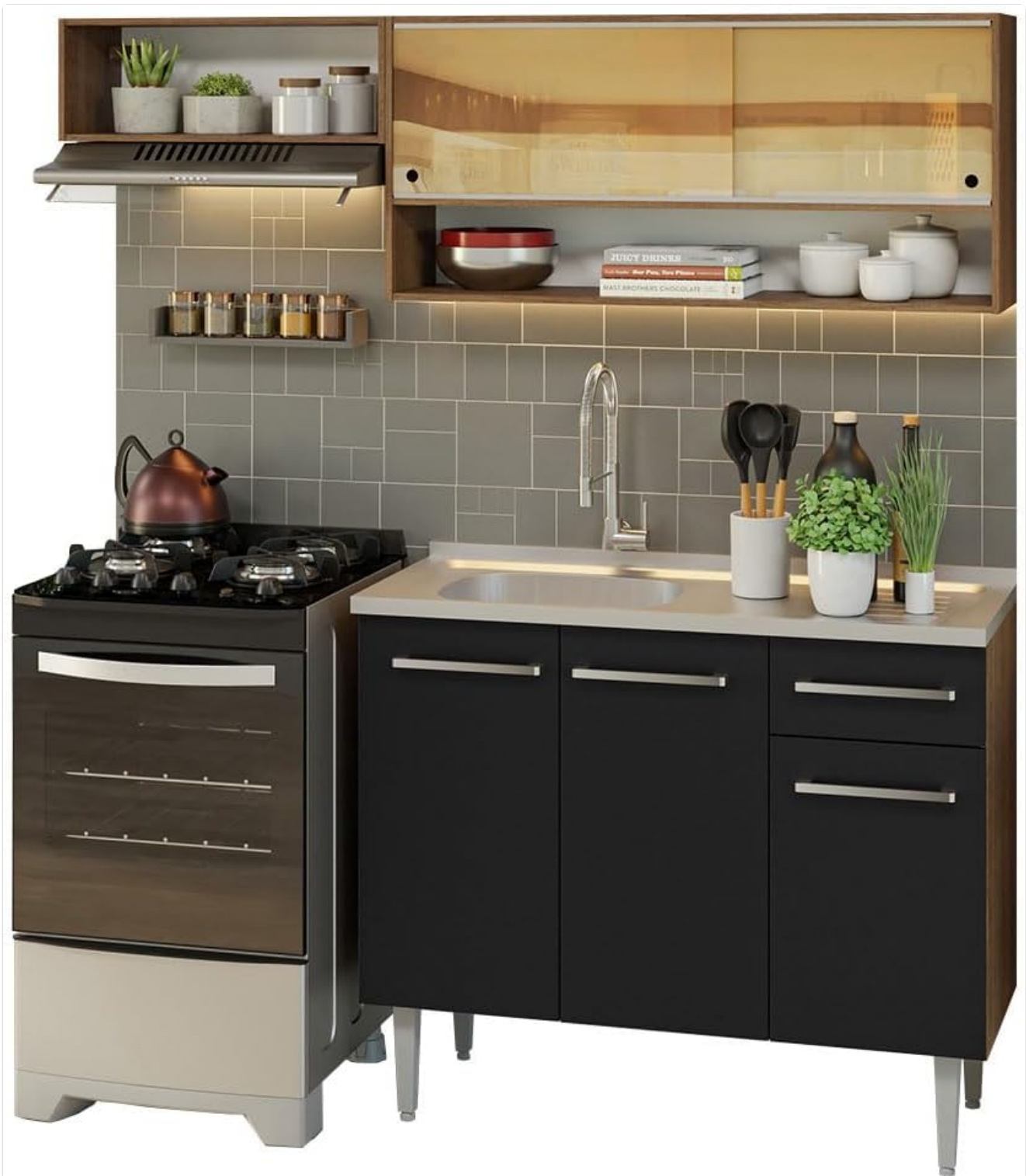
Figure 2.2: The Madesa Emily 01 Modular Kitchen integrated into a kitchen space, showcasing its design and functionality with appliances.