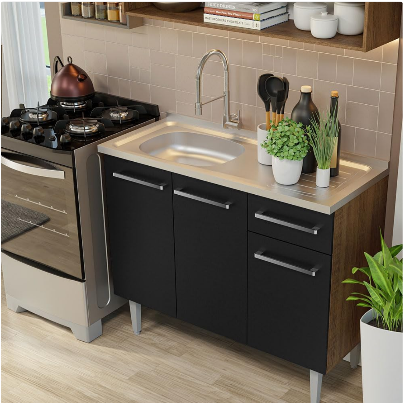
Figure 3.3: Close-up view of the stainless steel sink area, highlighting the integrated design and countertop space.