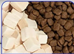
Multi Pieced Dry Food