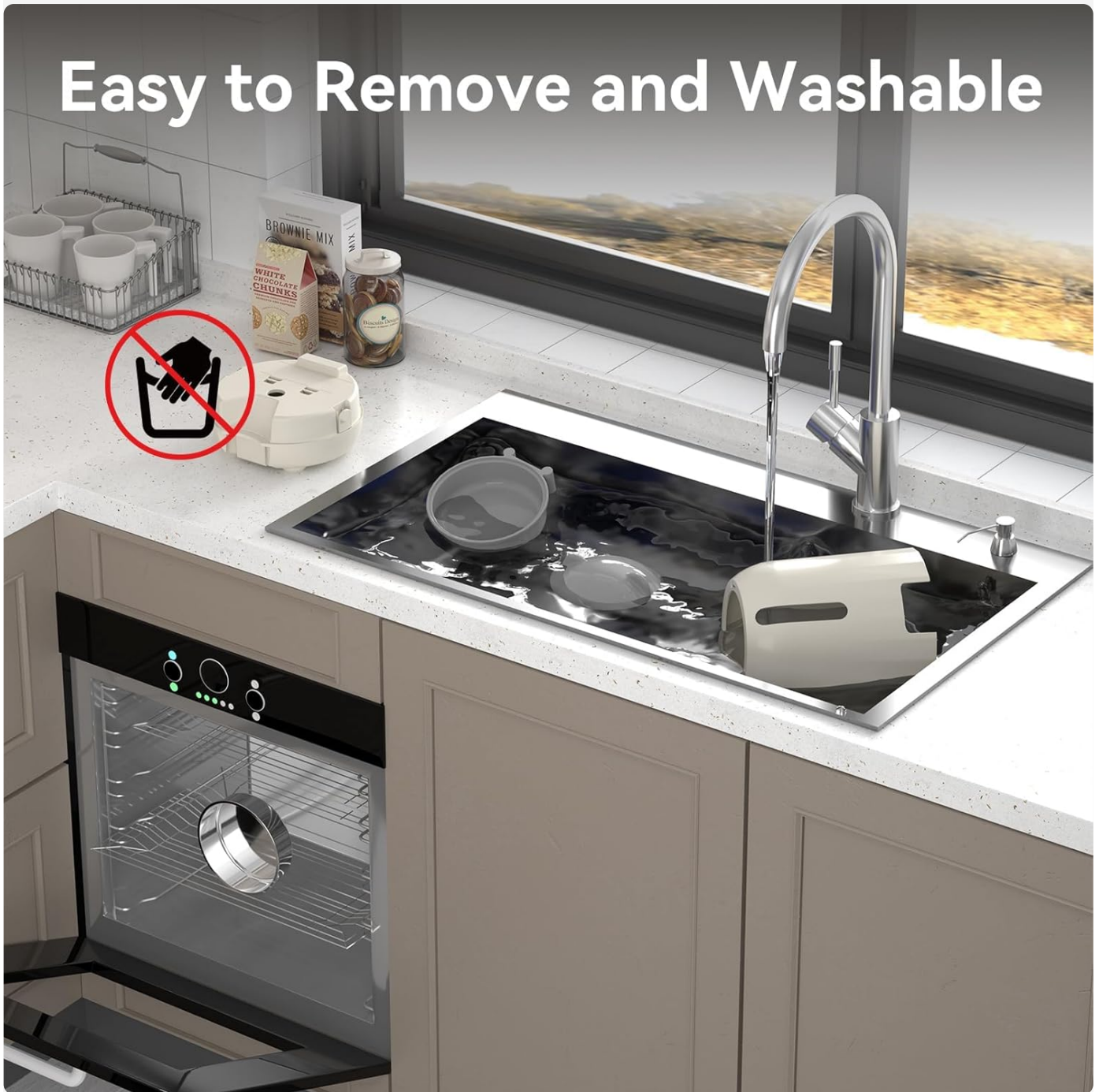
Image: The removable components of the PAPIFEED feeder, including the food tank and bowl, being washed in a kitchen sink. A "do not wash" icon is shown over the feeder base, indicating it is not submersible.