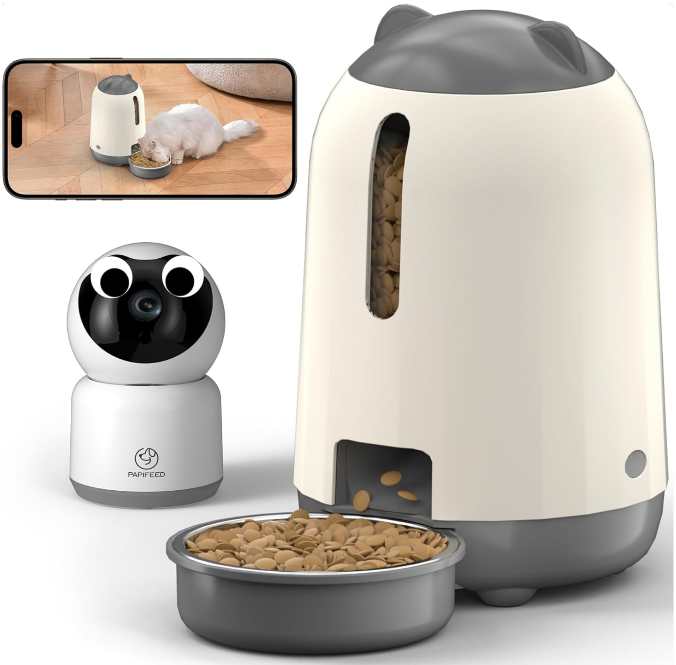
Image: The PAPIFEED Smart Automatic Pet Feeder (right) and the external 1080P HD camera (left), with a smartphone displaying a live feed of a cat eating from the feeder. This setup provides comprehensive remote pet care.