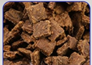
Air Dried Food

Image: A close-up of the feeder dispensing kibble, with examples of compatible food types: freeze-dried food, multi-pieced dry food, standard dry food, and air-dried food. The feeder supports kibble sizes from 5-12mm.