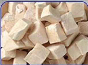
Freeze Dried Food