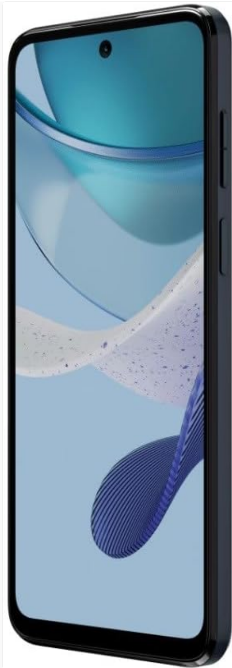
Image 3.3: Side view of the Motorola Moto G53, showing the USB-C port and 3.5mm audio jack.