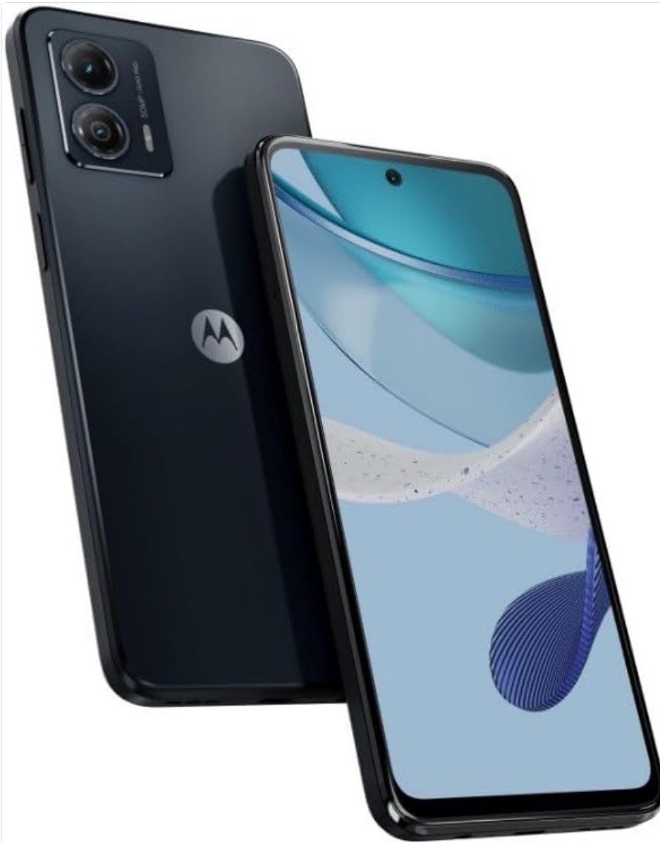
Image 3.4: Angled view of the Motorola Moto G53, showcasing both the front display and rear design.