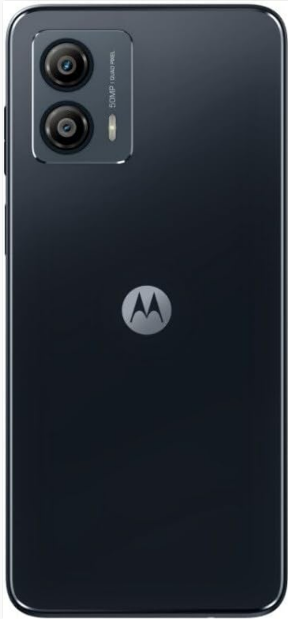
Image 3.1: Rear view of the Motorola Moto G53, showing the camera module and Motorola logo.