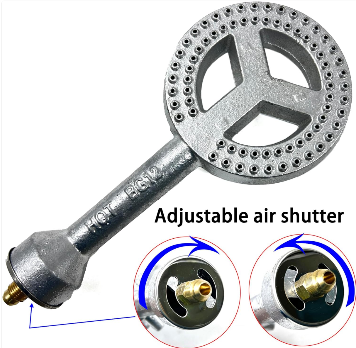
Figure 3: Adjustable Air Shutter

This image highlights the air shutter, which can be rotated to fine-tune the air-fuel mixture for optimal flame performance.