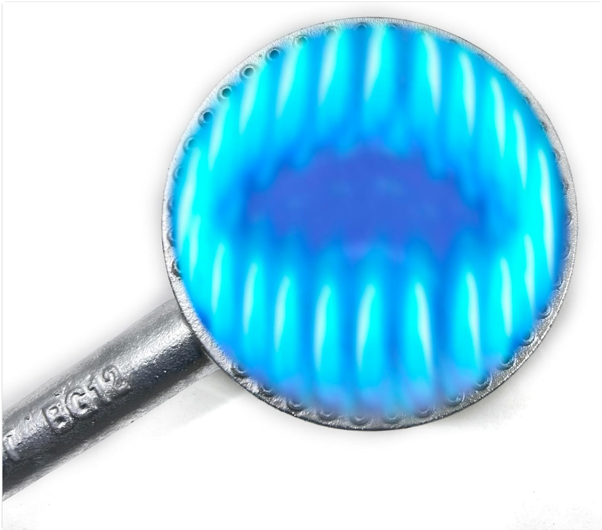
Figure 4: Burner in Operation with Blue Flame

An illustration of the burner head producing a clean, efficient blue flame, indicating proper air-fuel mixture.