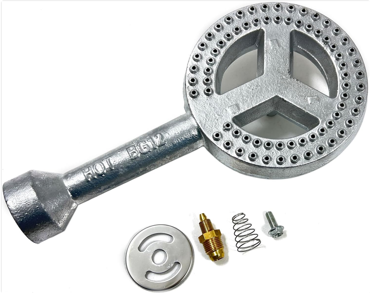
Figure 1: DB109 Burner Head and Included Components

This image displays the main cast-iron burner head along with the separate brass fitting orifice, air shutter, screw, and spring, which are all part of the complete assembly.