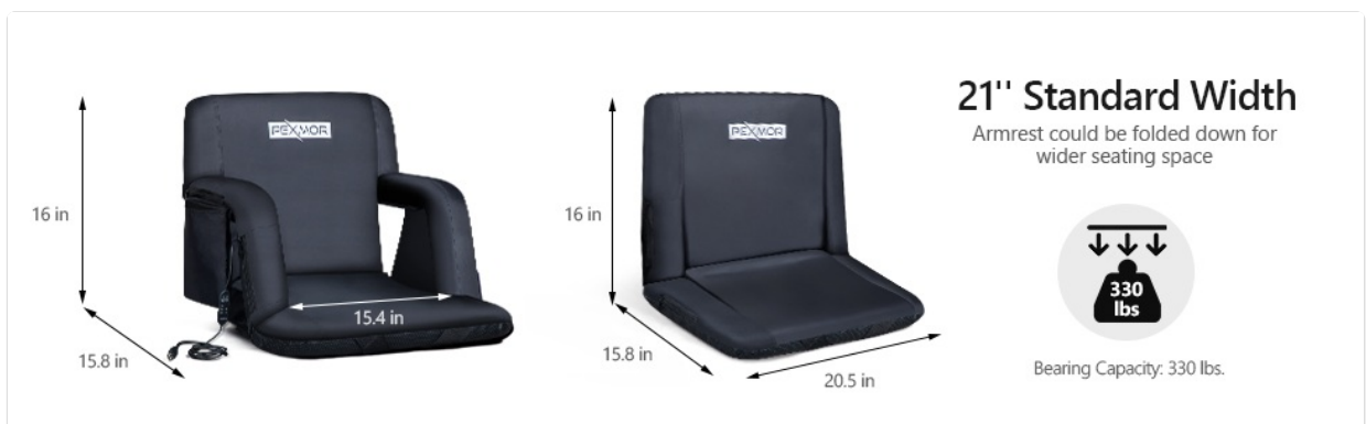
Image: Product dimensions and weight capacity.