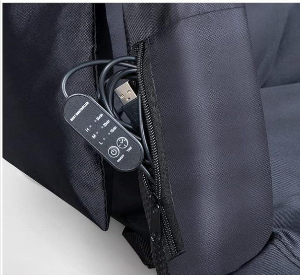
USB Cable Storage Pocket