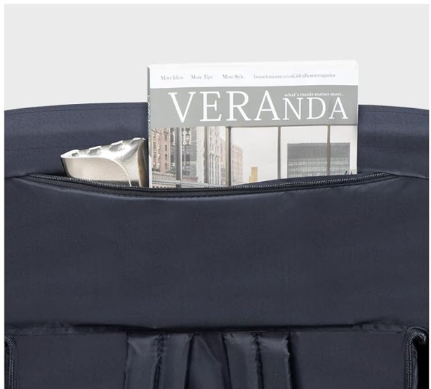
Large Backrest Pocket

Image: Detailed view of the integrated storage pockets for drinks, power bank, USB cable, and other items.