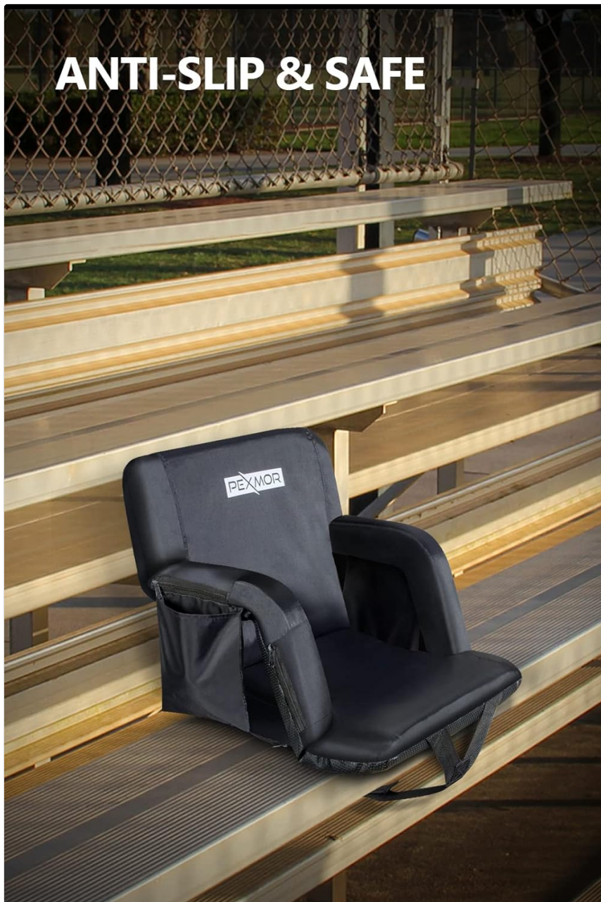
Image: Securing the seat to bleachers using the underneath straps and highlighting the anti-slip base.

Anti-slip Bottom Waterproof and Prevent Slipping