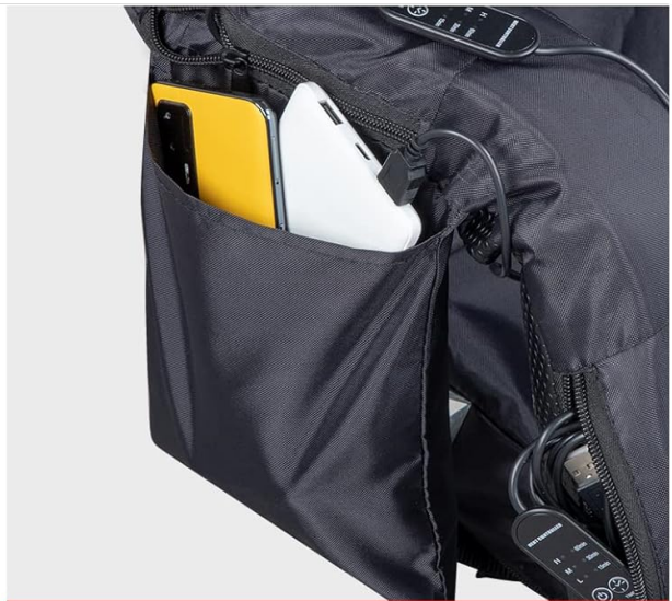
Snacks/ Power Bank Pockets