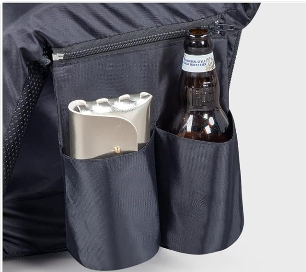
Drink Holder Side Pocket