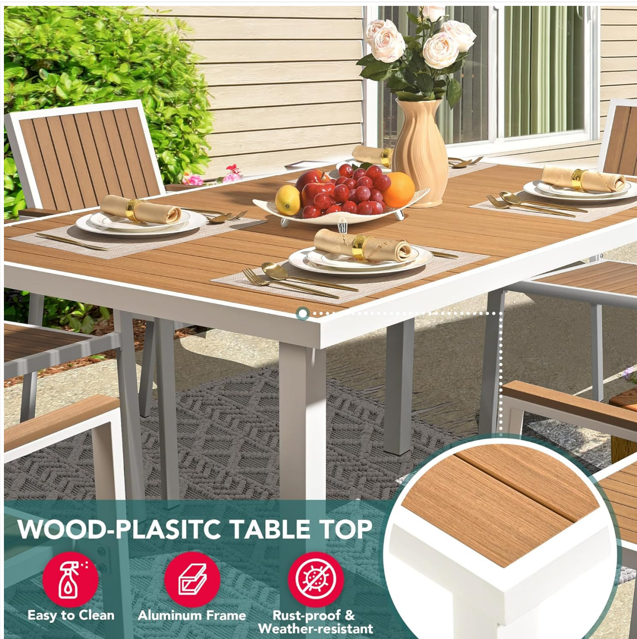
Figure 3: Dining table featuring a durable wood-plastic top.