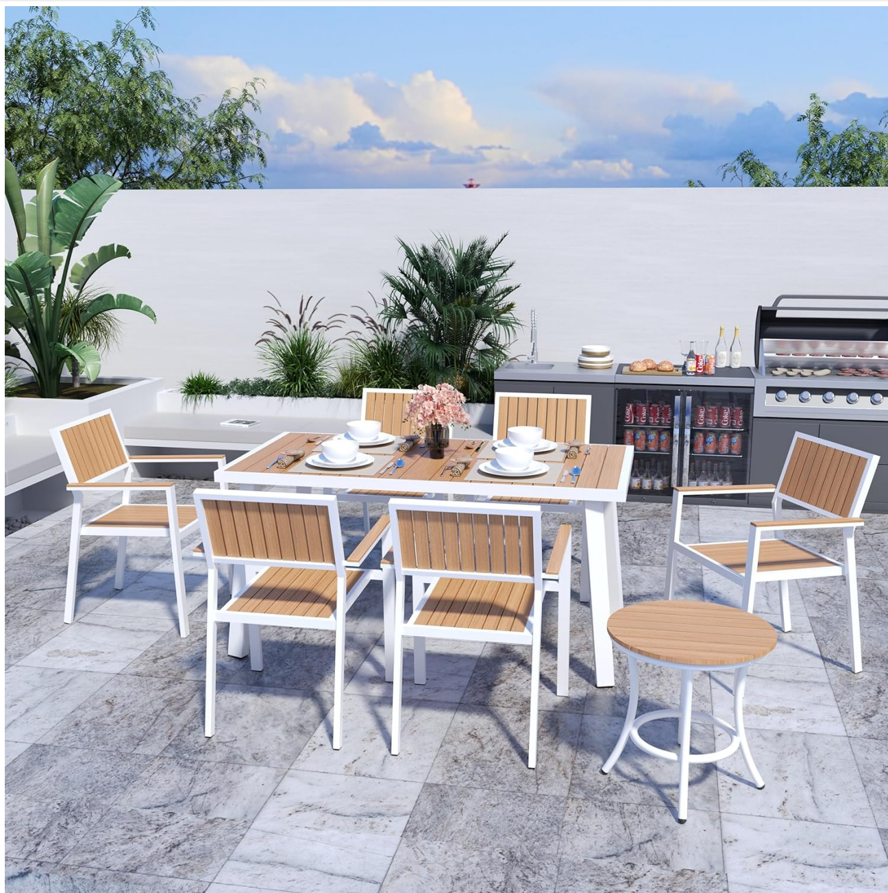
Figure 4: The complete Pamapic 8-Piece Patio Dining Set.