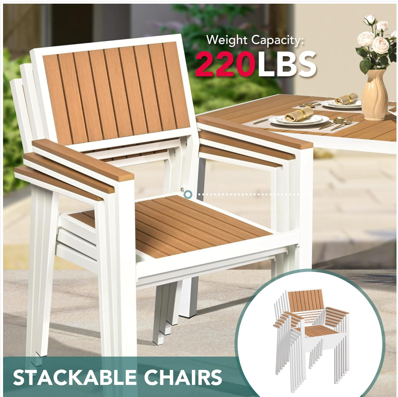
Figure 2: Assembled chairs are stackable for convenient storage.