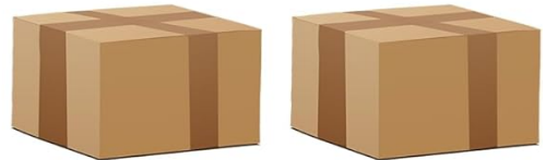
Figure 1: Overview of the Pamapie 8-Piece Patio Dining Set components and packaging.

Our product is delivered with 2 boxes. You may not get all boxes at the same time