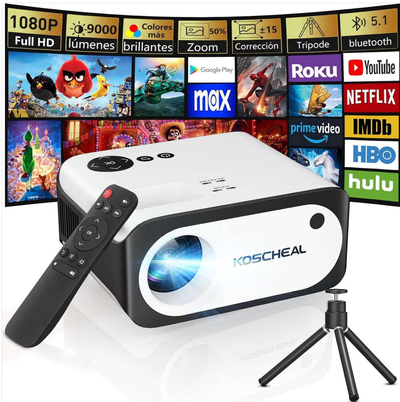
Image: The KOSCHEAL Mini WiFi Projector KOS-P01, showcasing its compact design, included remote control, and mini tripod, ready for use.