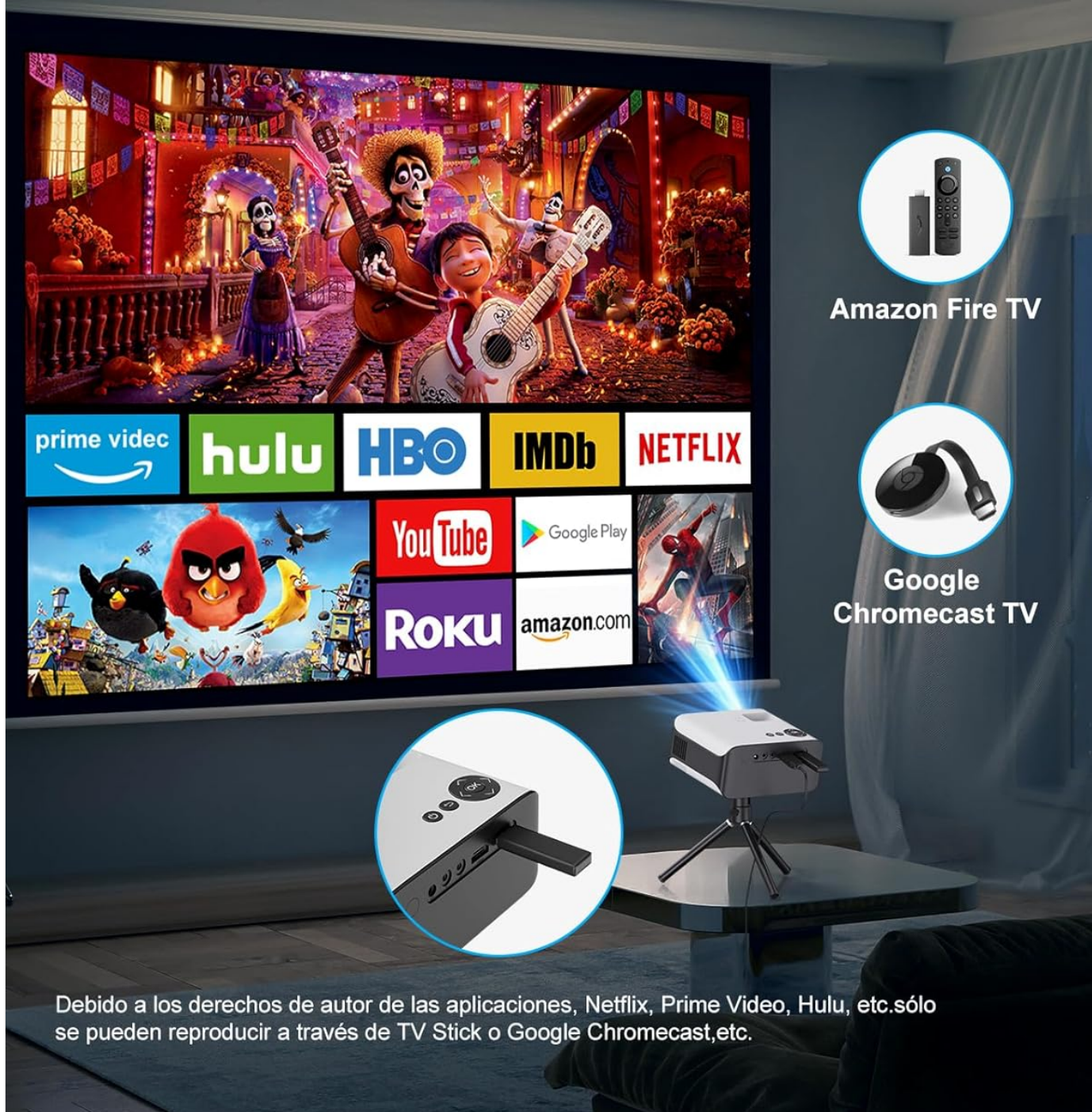
Image: The KOSCHEAL Mini Projector KOS-P01 displaying content from various streaming services, highlighting its compatibility with TV sticks and boxes like Amazon Fire TV and Google Chromecast TV.