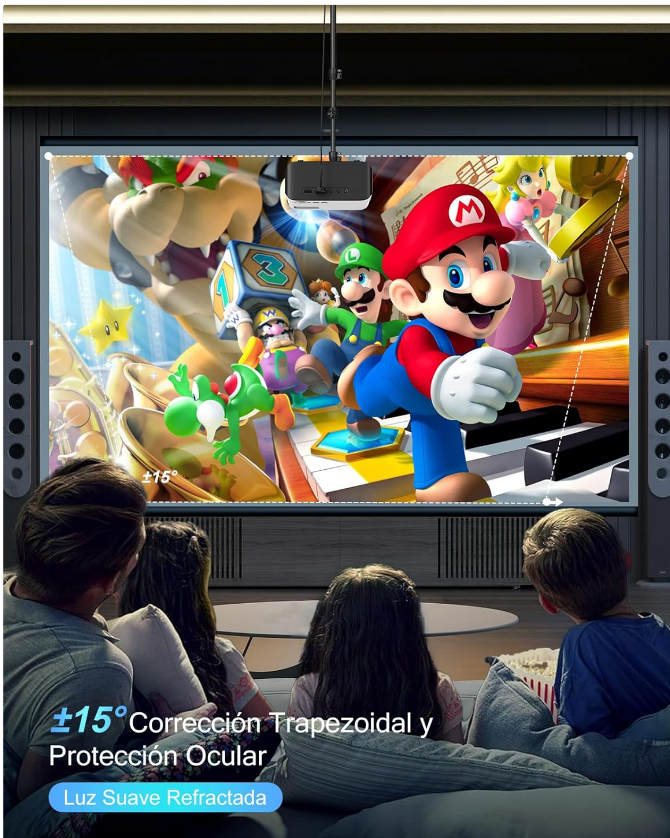
Image: A family watching a movie projected by the KOSCHEAL Mini Projector KOS-P01, demonstrating the \pm 15^\circ keystone correction feature for a perfectly rectangular image.