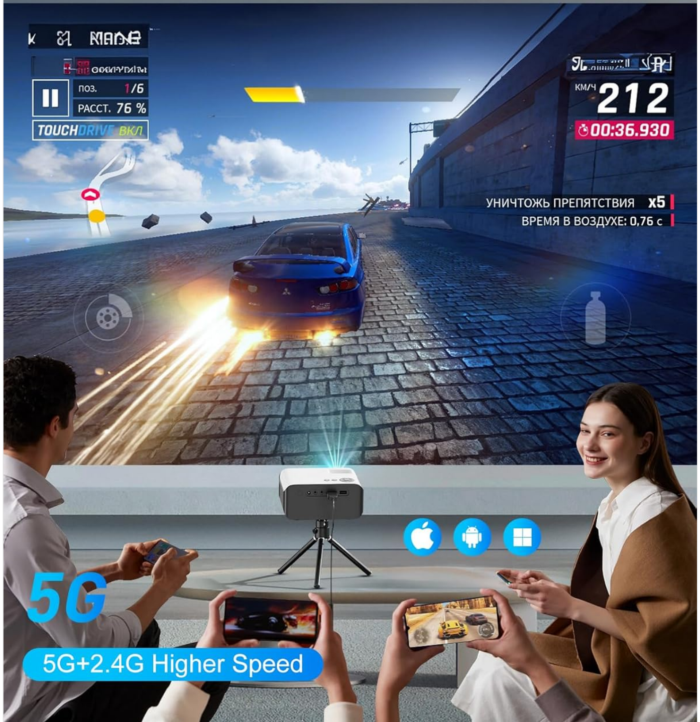
Image: Users enjoying a racing game projected by the KOSCHEAL Mini Projector KOS-P01, demonstrating the fast and stable 5G WiFi screen mirroring capability from mobile devices.