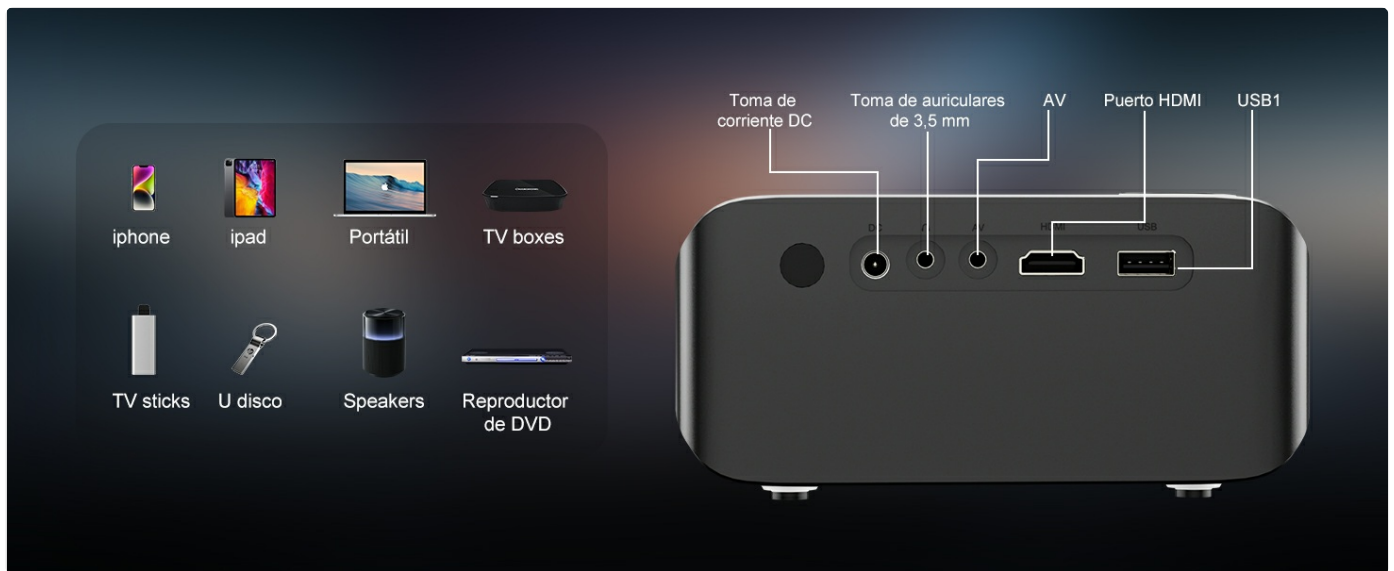
Image: Diagram illustrating the various ports on the KOSCHEAL Mini Projector KOS-P01, including DC power, 3.5mm audio, AV, HDMI, and USB, along with compatible devices like smartphones, laptops, TV boxes, and USB drives.