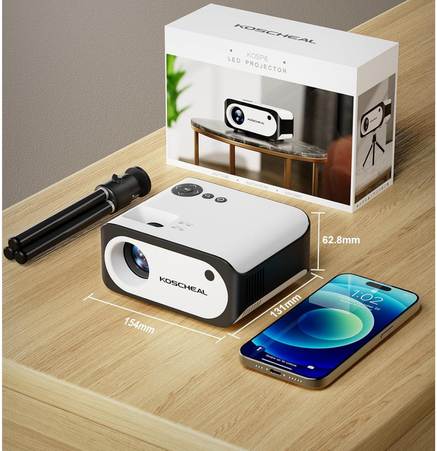
Image: The compact size of the KOSCHEAL Mini Projector KOS-P01, shown next to a smartphone for scale, highlighting its portability.