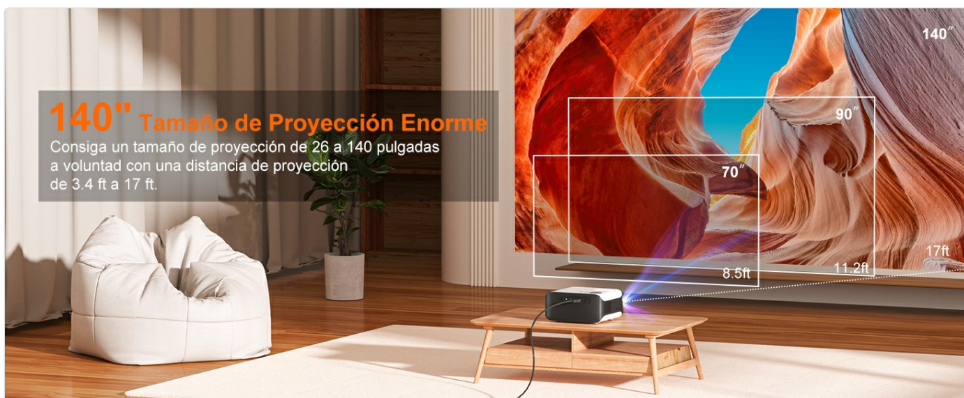
Image: A guide showing the relationship between projection distance and screen size for the KOSCHEAL Mini Projector KOS-P01, illustrating how to achieve a 140-inch display.