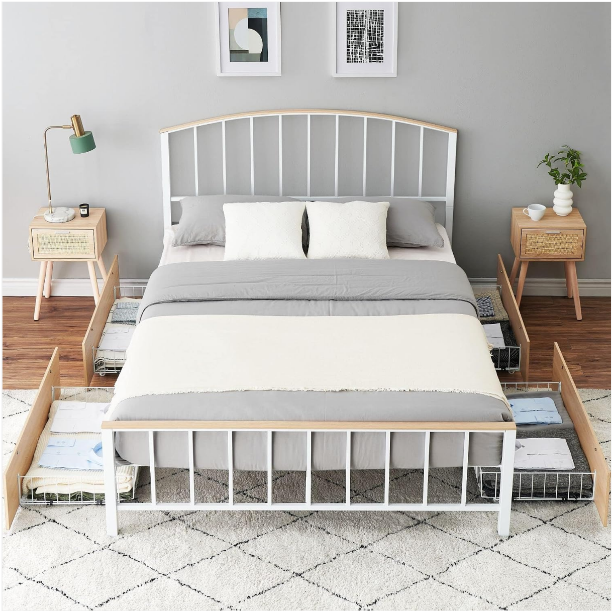
Image 5.1: The bed frame showcasing all four storage drawers fully extended.