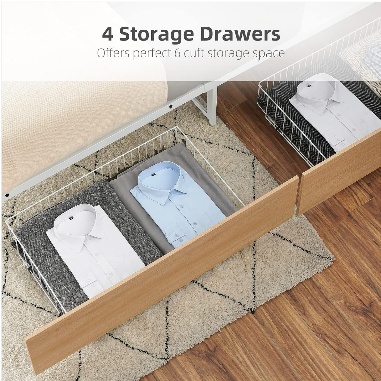
Image 5.2: Close-up view of the wire netting storage drawers, demonstrating their capacity.