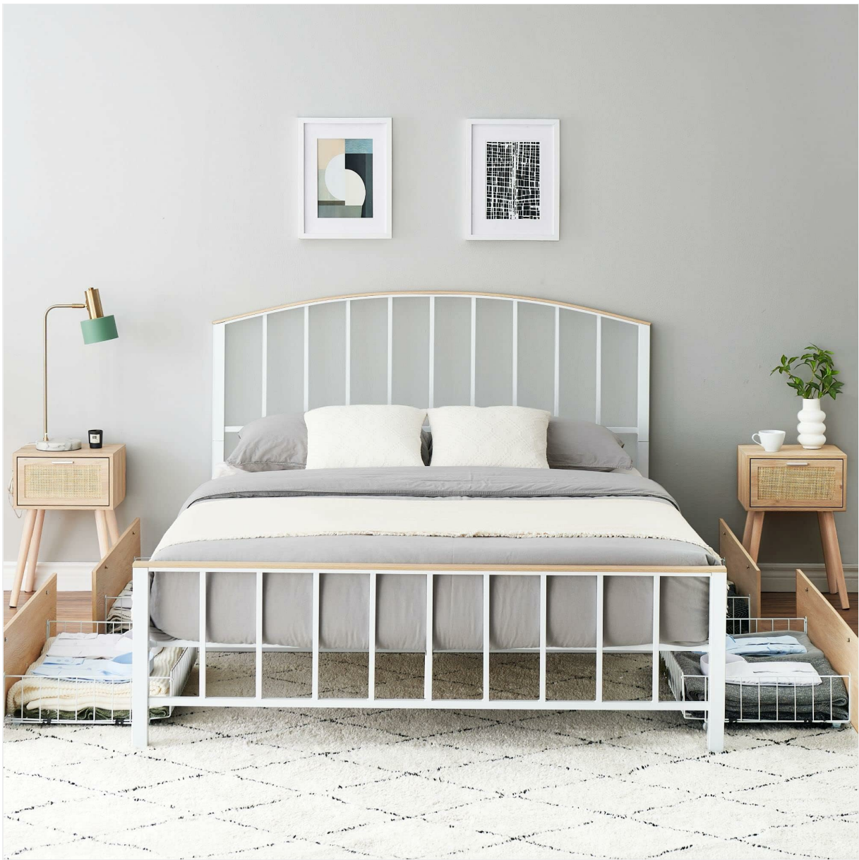
Image 1.1: Fully assembled IDEALHOUSE Queen Platform Bed Frame with Headboard, Footboard, and Storage Drawers.