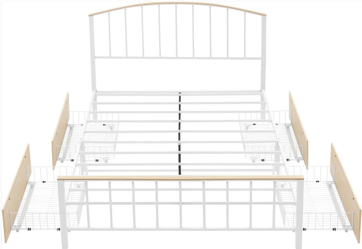
Image 4.1: Overview of disassembled bed frame components and storage drawers prior to assembly.

7. Insert Drawers: Slide the assembled storage drawers under the bed frame.