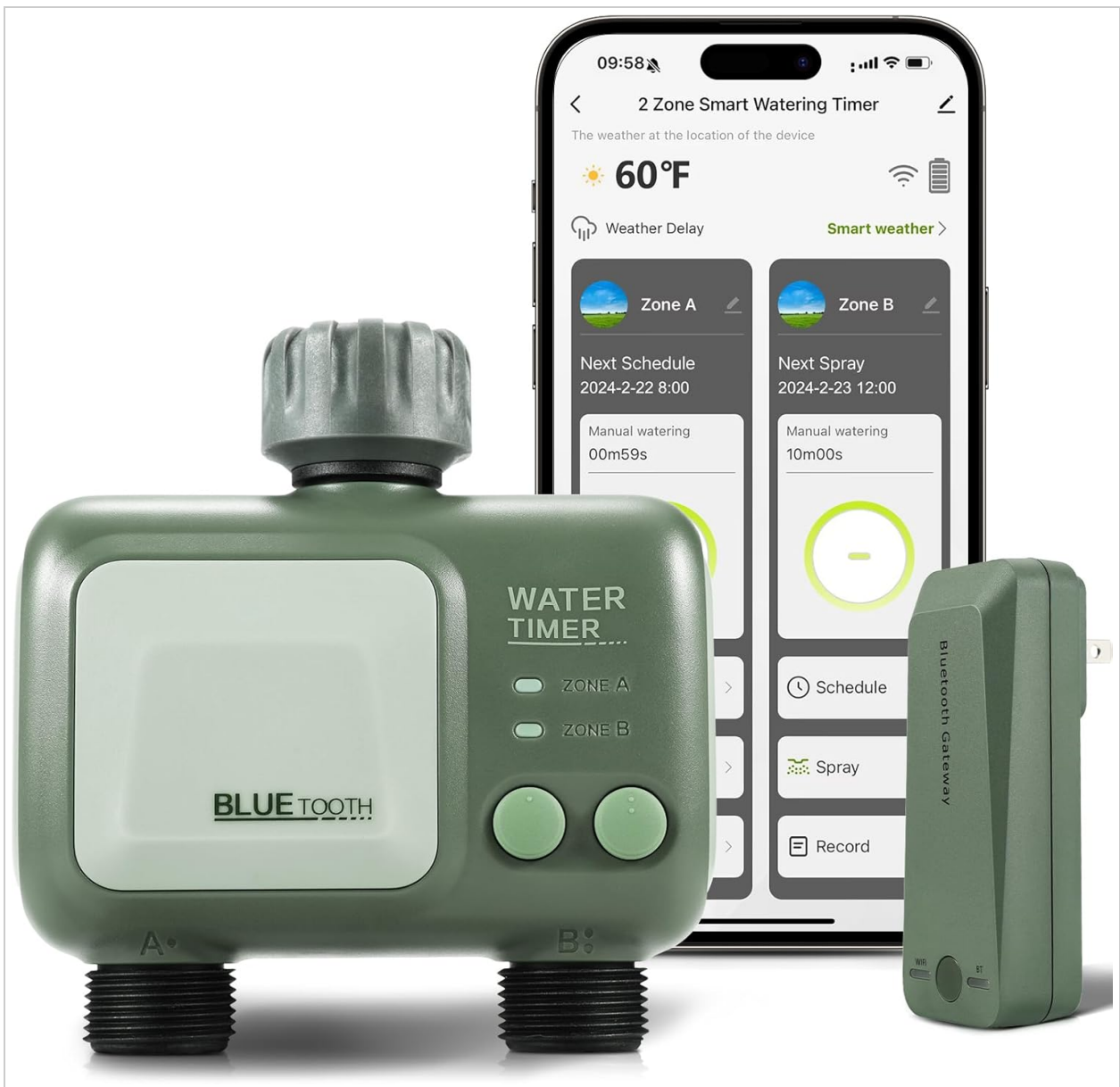
The SOGUYI Smart WiFi Irrigation Controller and its accompanying mobile application.