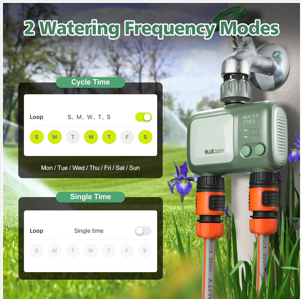
Visual representation of setting up cycle time and single time watering frequencies.