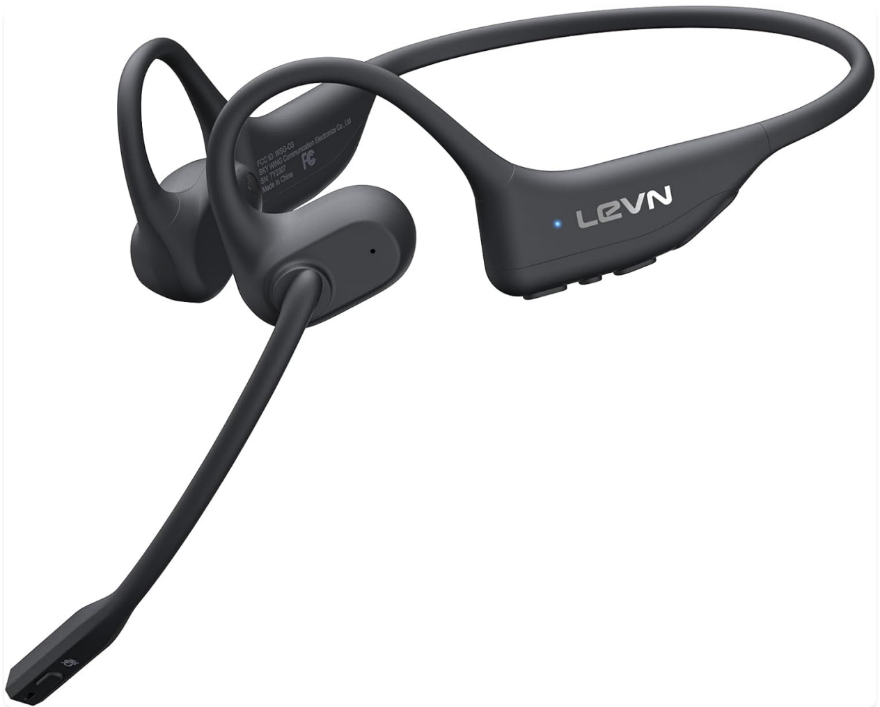
Figure 1: Front view of the LEVN Open Ear Headphones.