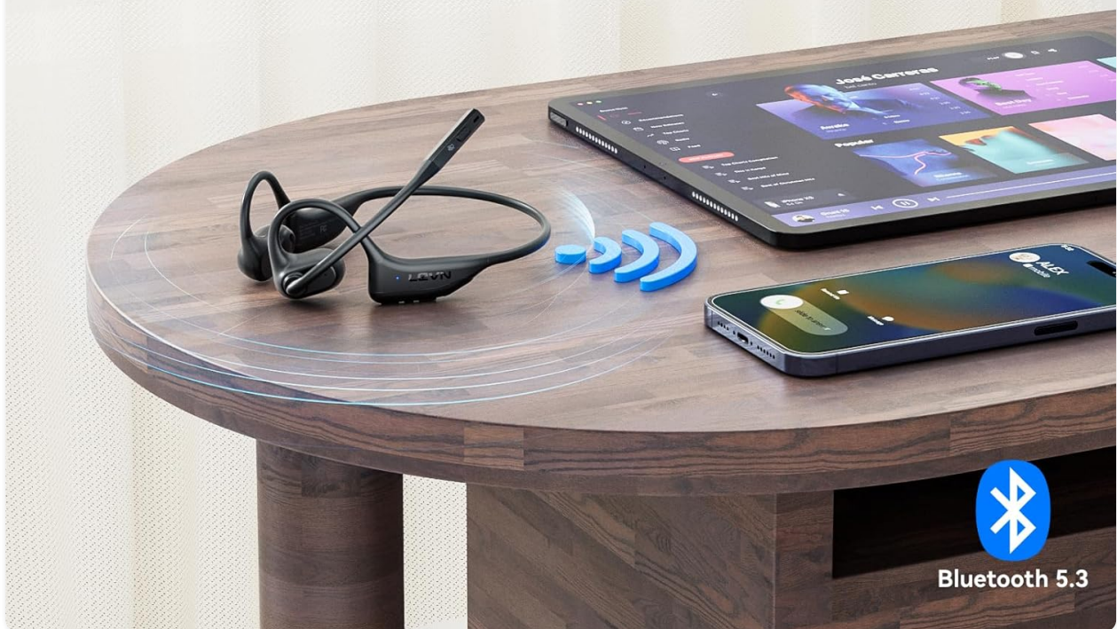
Figure 5: The AI noise-canceling microphone ensures clear communication during calls.

Fast pairing with smartphones, tablets, and computers compatible with most Bluetooth devices