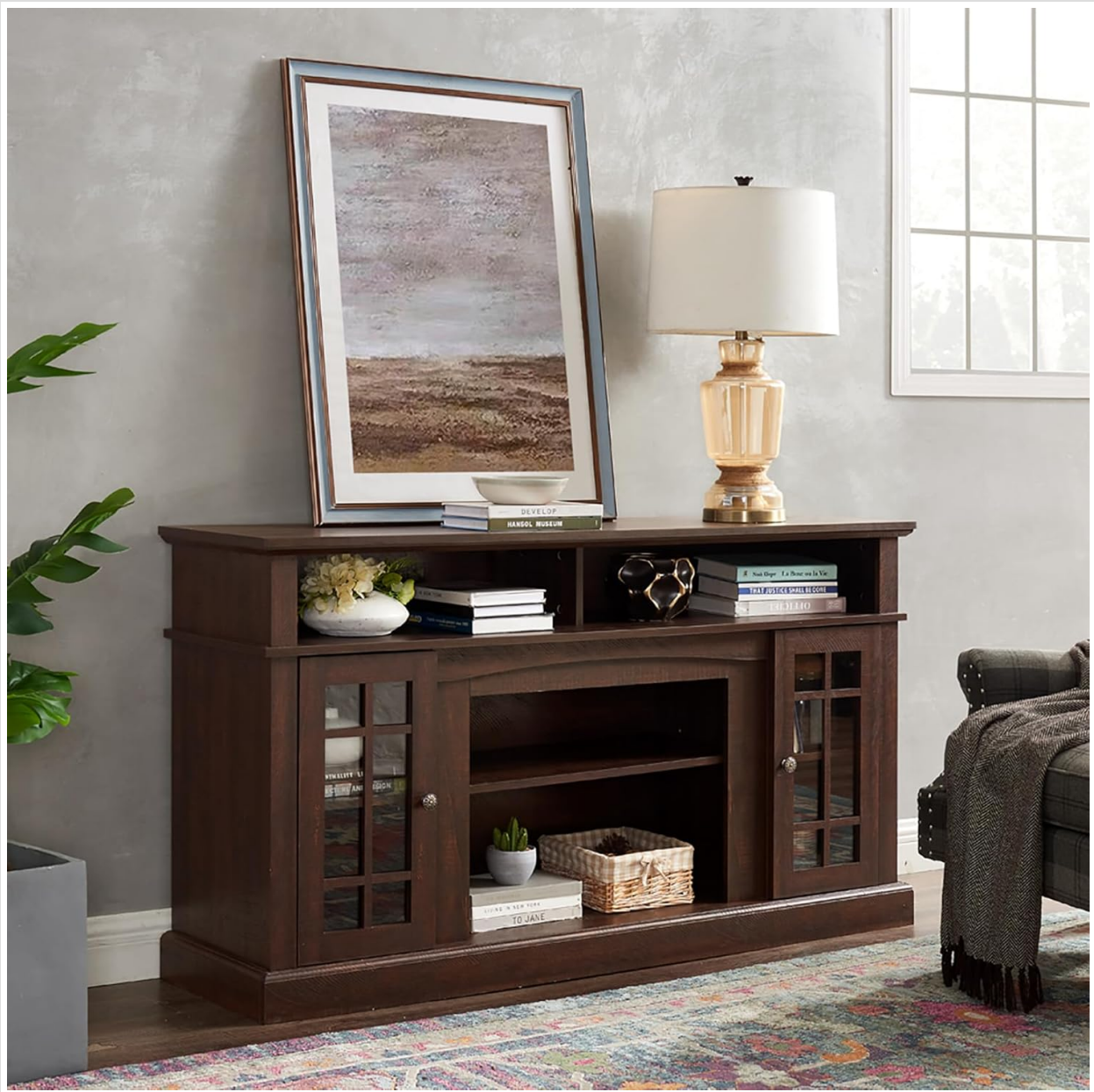
Image: The Bituman Farmhouse TV Cabinet, espresso color, featuring glass doors and open shelving, displayed in a living room environment.