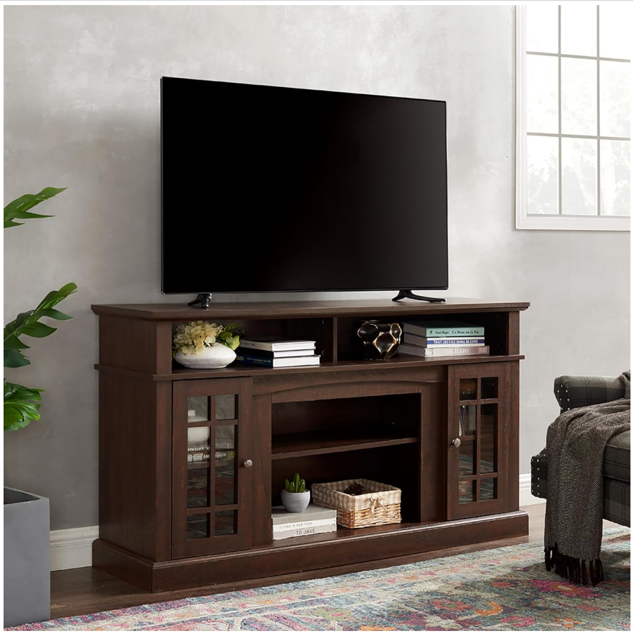
Image: The TV cabinet in use, demonstrating how a television fits on the top surface and how media components can be organized within the open and glass-doored compartments.

signal cables through these openings to maintain a tidy appearance and prevent tangles.