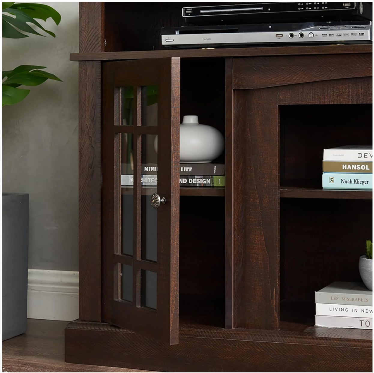
Image: A detailed view of the cabinet's glass door and interior, highlighting the adjustable shelf and the quality of the finish.