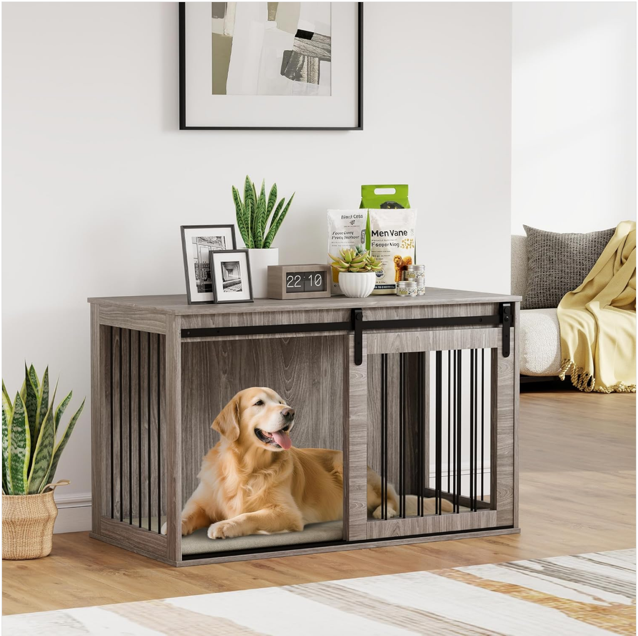
Image 1.1: The PawHut Dog Crate Furniture in a living room setting, housing a Golden Retriever.