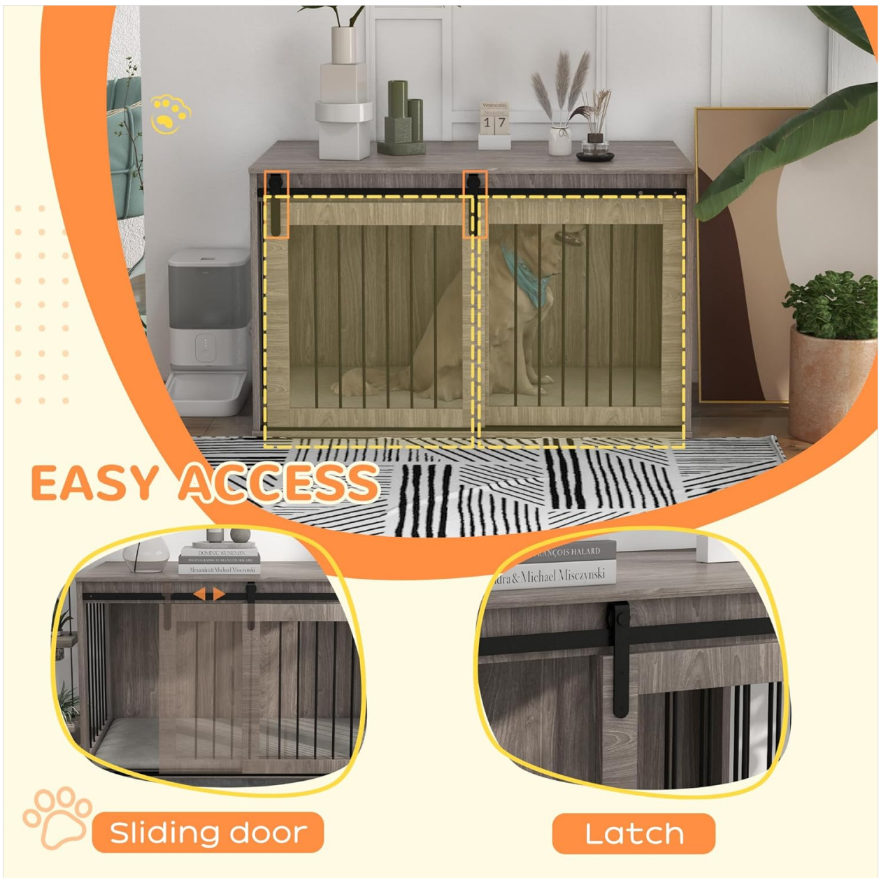
Image 5.1: The sliding door allows for easy access, secured by a robust latch.