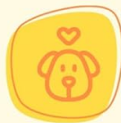
Image 1.2: This furniture serves as both a comfortable dog crate and a stylish side table.