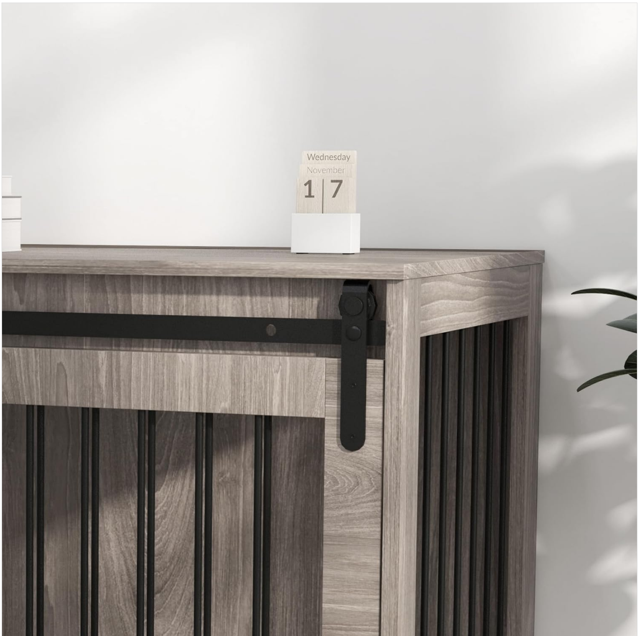
Image 4.1: Detail of the sliding door track and latch, crucial for assembly and operation.