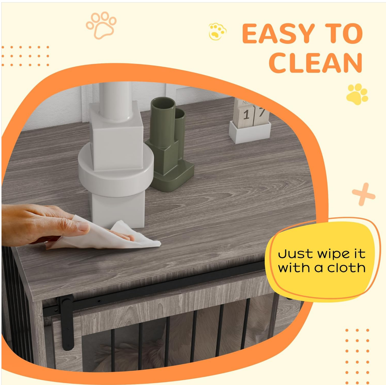
Image 6.1: The smooth surface of the crate is easy to clean with a damp cloth.