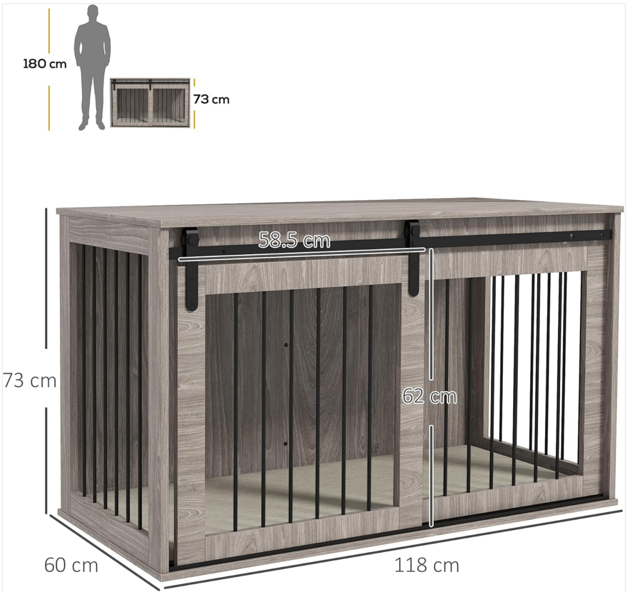
Image 8.1: Detailed dimensions of the assembled dog crate furniture.