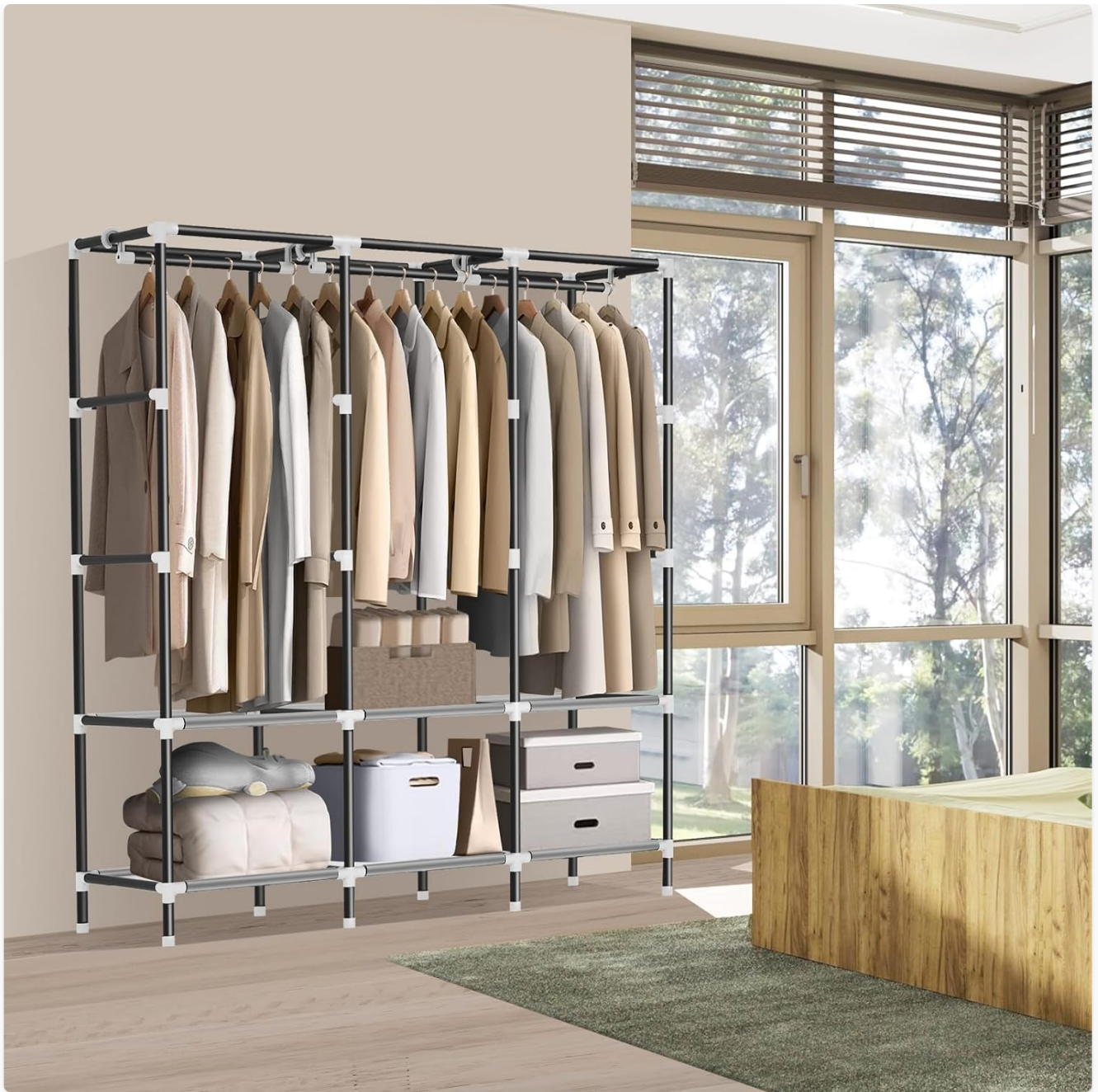
The sturdy metal frame of the LOKEME Portable Wardrobe Closet, ready for the fabric cover and internal shelves.