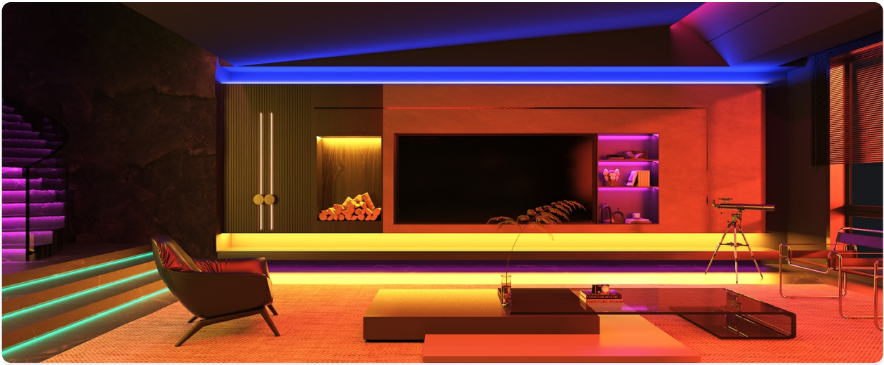
Figure 4: Timer Setting. This image illustrates how the timer function can be used to set automatic on/off times for the LED lights.

Video 3: See these LEDs in action. This video showcases the LED lights installed in a room, demonstrating their various color options and effects.