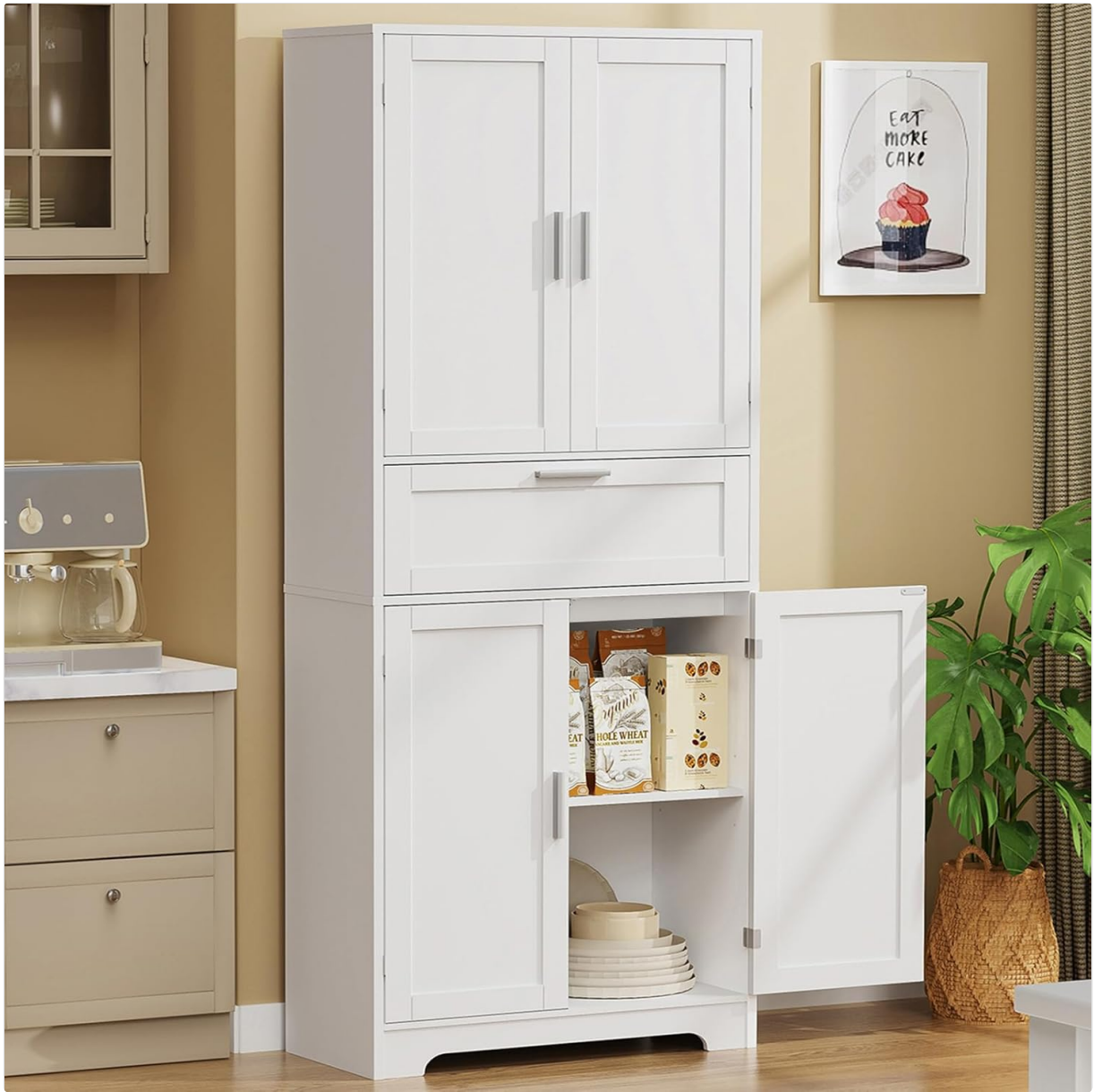
Figure 4.2: Bottom cabinet section with adjustable shelves for bottles and kitchenware.