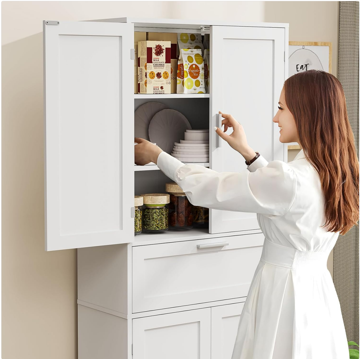
Figure 4.3: User interacting with the cabinet, demonstrating accessibility.