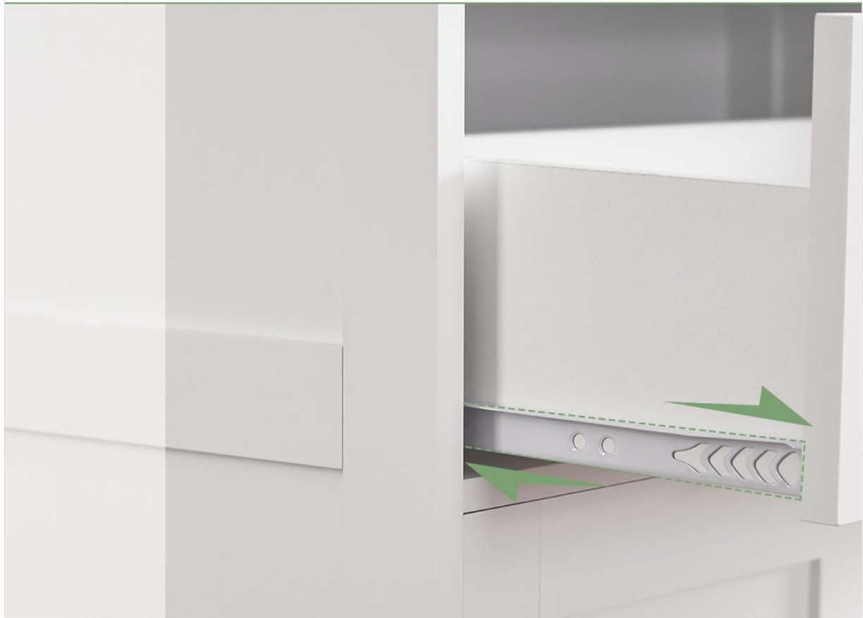
Figure 4.4: Detail of the metal drawer slides for smooth functionality.

Upgraded metal slides make the drawer pull more smoothly and have a stronger load-bearing capacity.