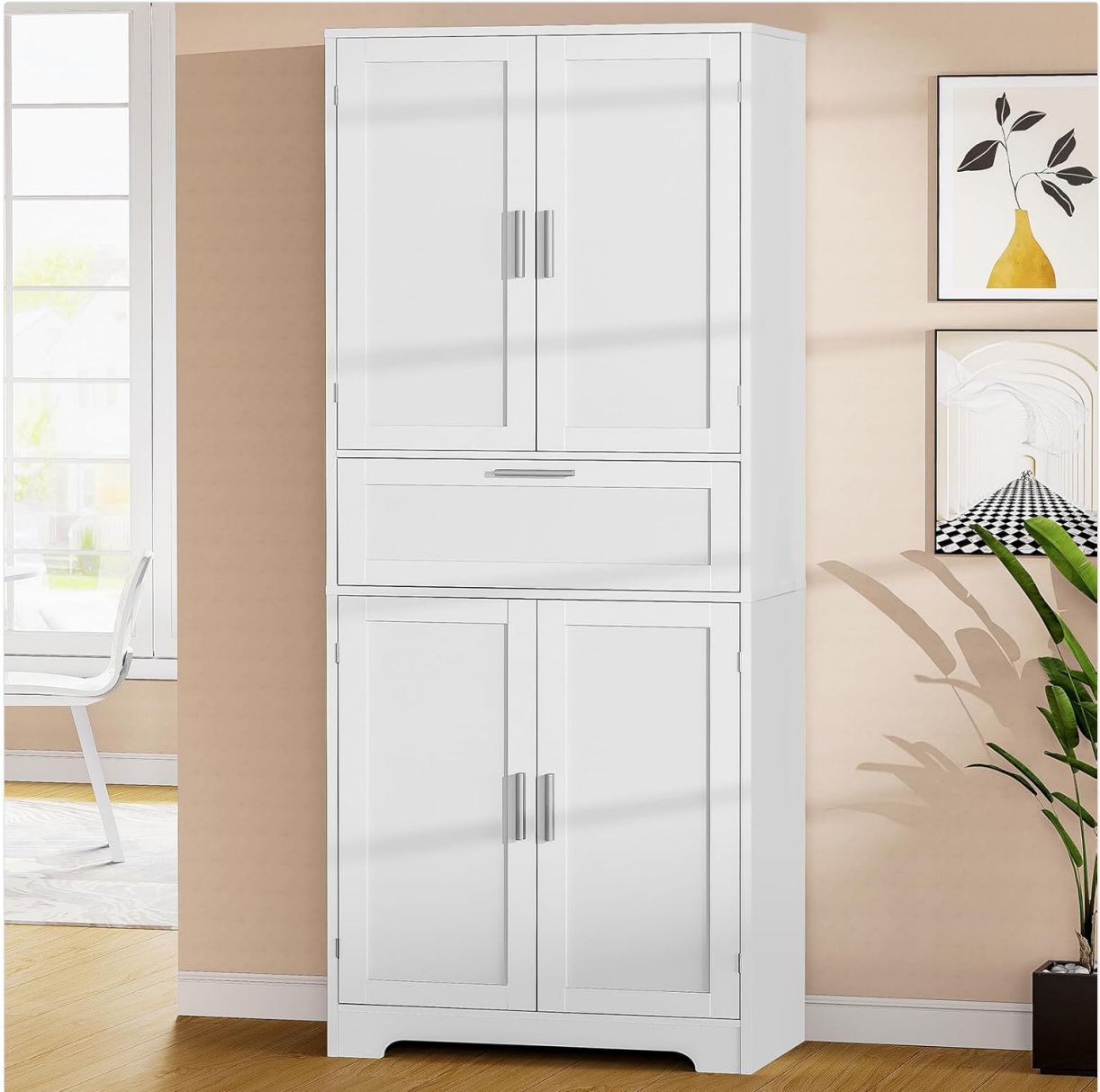
Figure 3.1: Fully assembled Iwell Tall Storage Cabinet.