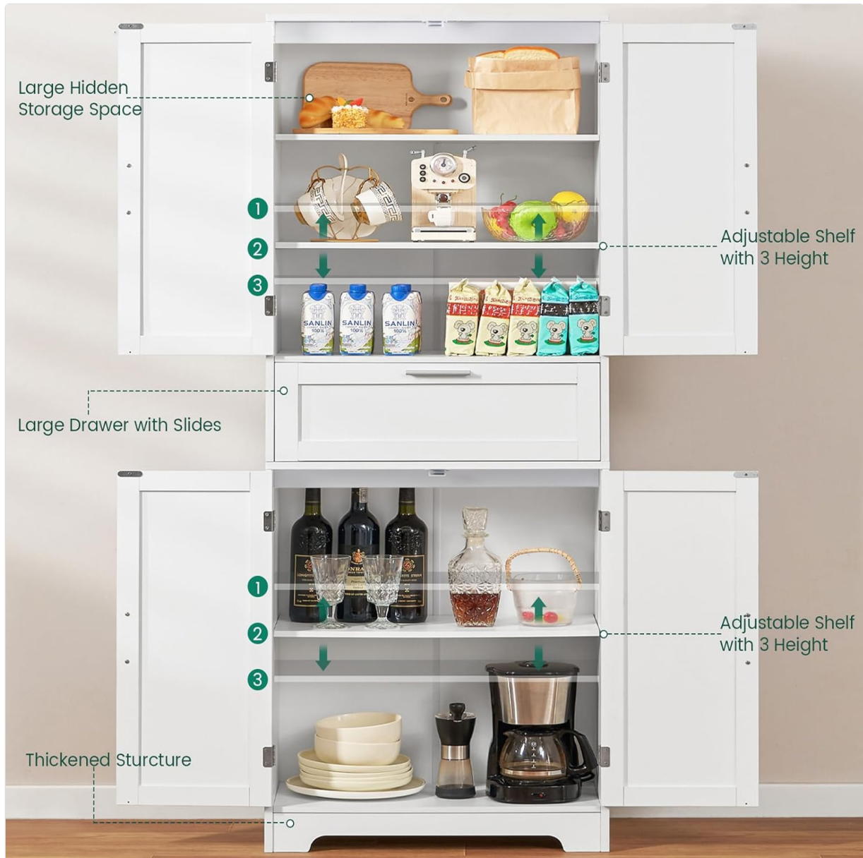
Figure 4.1: Top cabinet section with adjustable shelves for pantry items.