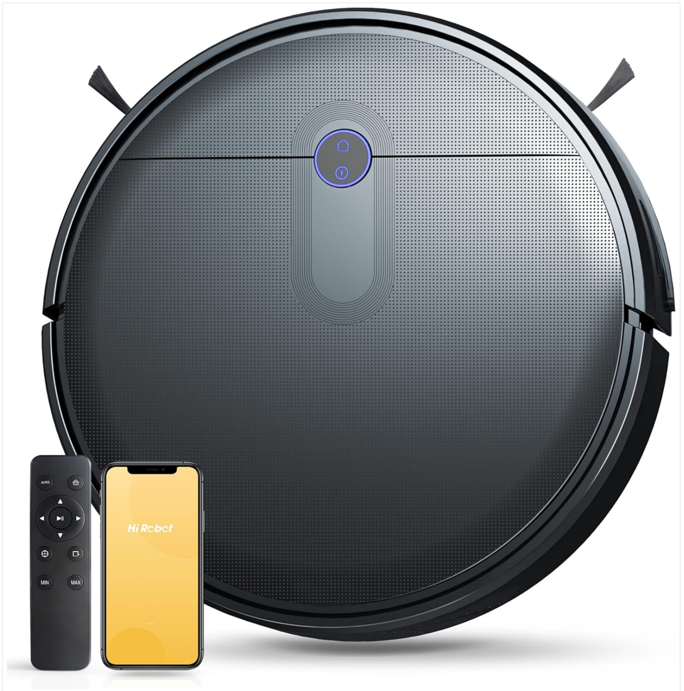
Image: The Thantvu L100 Robot Vacuum Cleaner shown with its accompanying remote control and a smartphone displaying the mobile application, illustrating the complete product package.