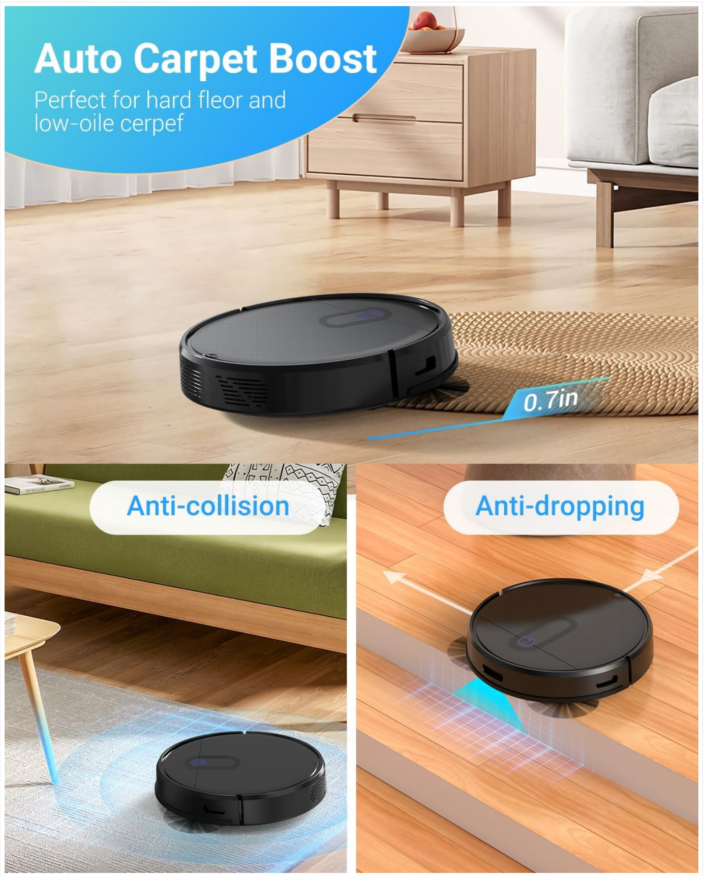
Image: This composite image shows the L100's advanced features: automatically boosting suction on carpets, avoiding collisions with furniture, and preventing falls down stairs.