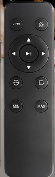
Image: This image demonstrates the multiple control options for the Thamtu L100, including a mobile app, a physical remote control, and voice commands via Amazon Alexa or Google Assistant.