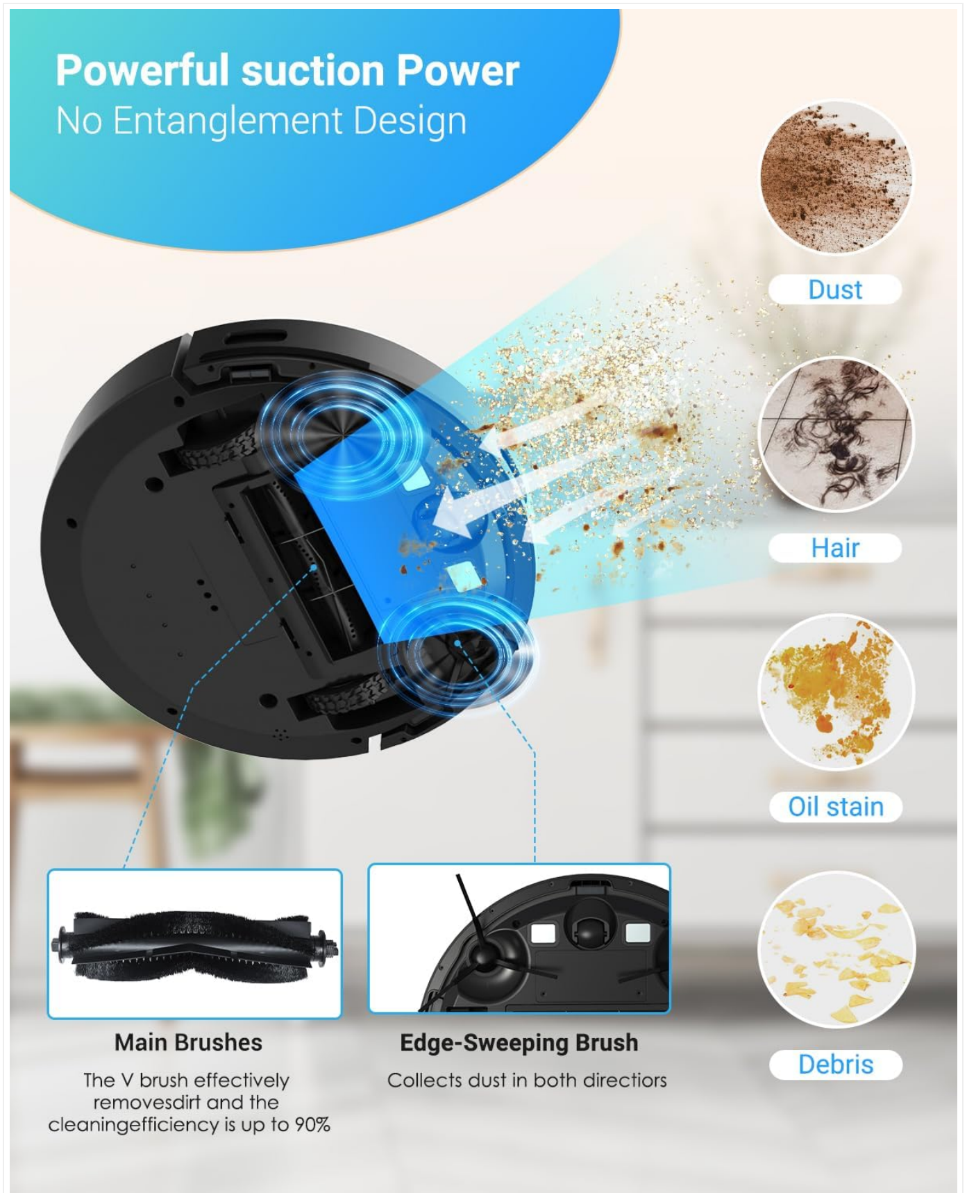
Image: An exploded view of the Thamtu L100's underside, highlighting the main brush and edge-sweeping brush, demonstrating its effectiveness in picking up various types of debris like dust, hair, and oil stains.