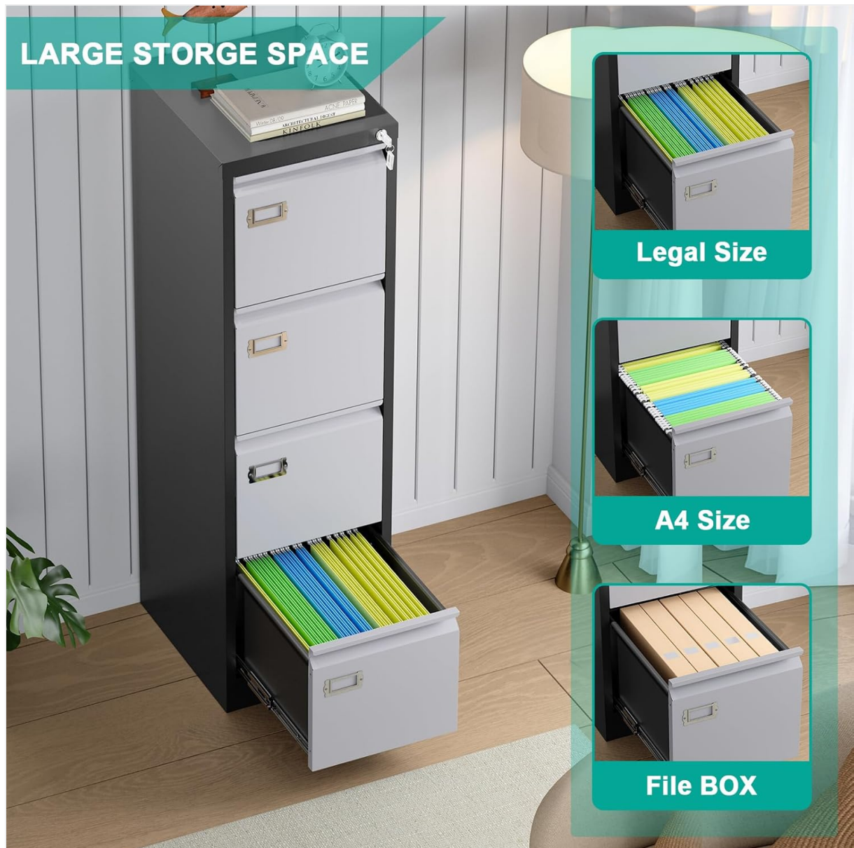
Image: File cabinet drawers open, illustrating the ample storage space and how different document sizes (Letter, A4, Legal) and file boxes can be organized.

pull the handle. To close, push the drawer firmly until it is fully recessed. The anti-tilt mechanism ensures that only one drawer can be opened at a time. Do not force multiple drawers open simultaneously.