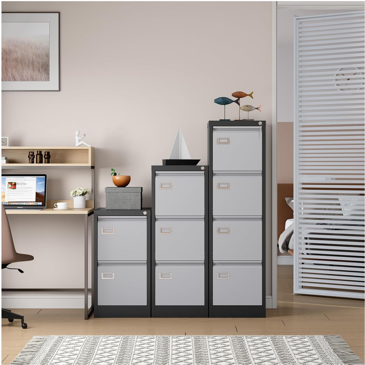
Image: SISESQL 4-Drawer Vertical File Cabinet in an office setting, showcasing its sleek design and integration into a workspace.