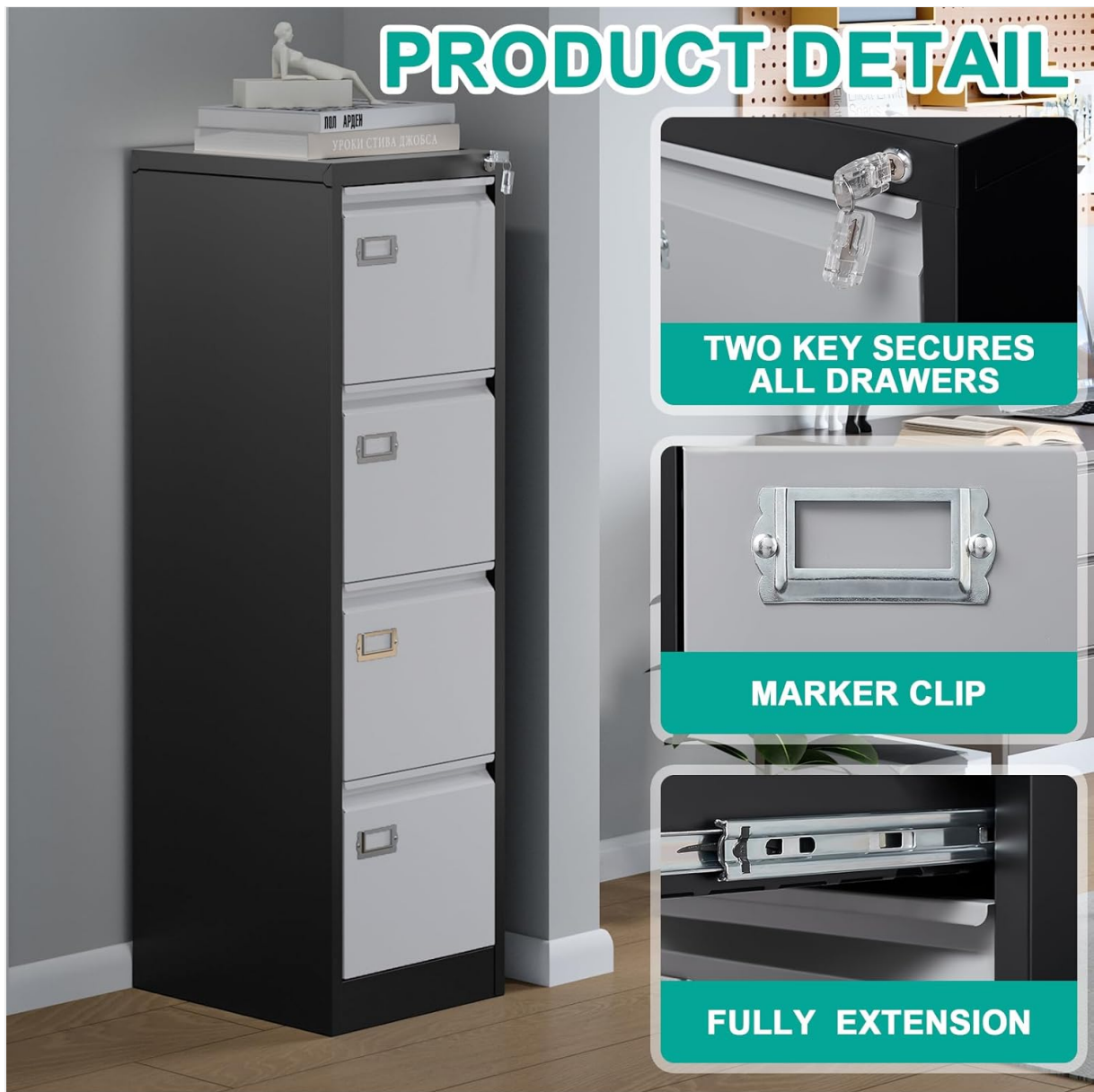
Image: Close-up view of the file cabinet's details, highlighting the lock mechanism, marker clip for labeling, and the full extension drawer slide for easy access.