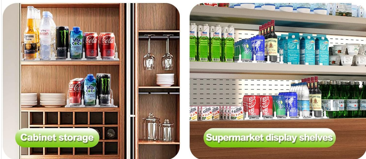
Image: A collage illustrating the multi-purpose use of the Coanto drink organizer. It shows the organizer effectively storing beverages in a refrigerator, a kitchen cabinet, and on supermarket display shelves, demonstrating its versatility.