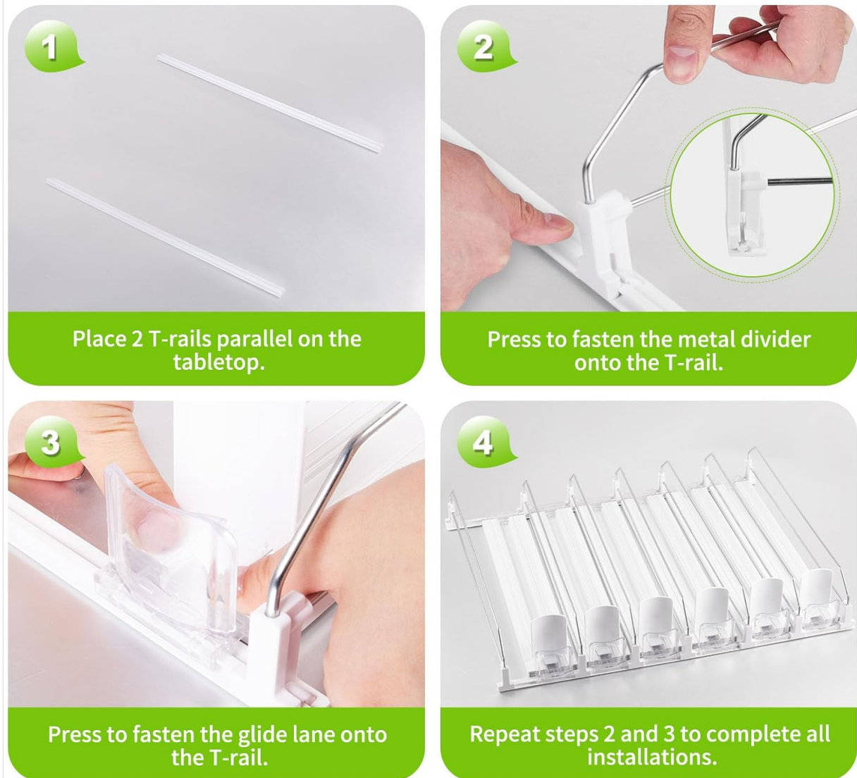
Image: A visual guide demonstrating the four simple steps to assemble the Coanto drink organizer, showing how to connect the T-rails, metal dividers, and glide lanes.