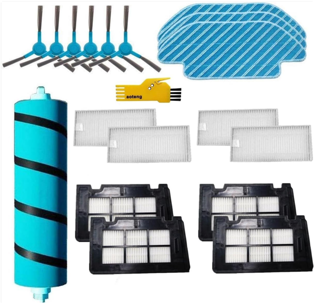
Figure 1: Assortment of CobydA replacement parts, including a main roller brush, multiple side brushes, several HEPA filters, and a mop cloth.