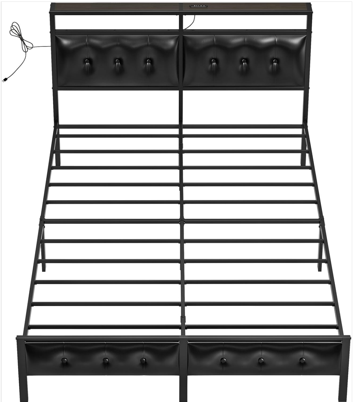
Image: The robust metal frame structure of the FABATO Double Bed Base, showing the slat system and support legs.