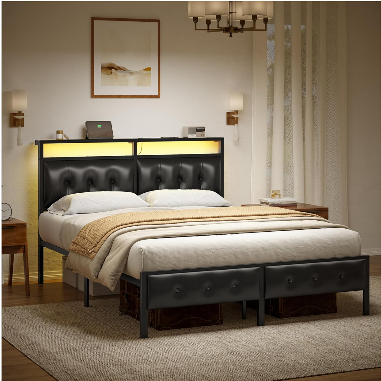
Image: A complete view of the assembled FABATO Double Bed Base with its upholstered headboard, LED lighting, and footboard.