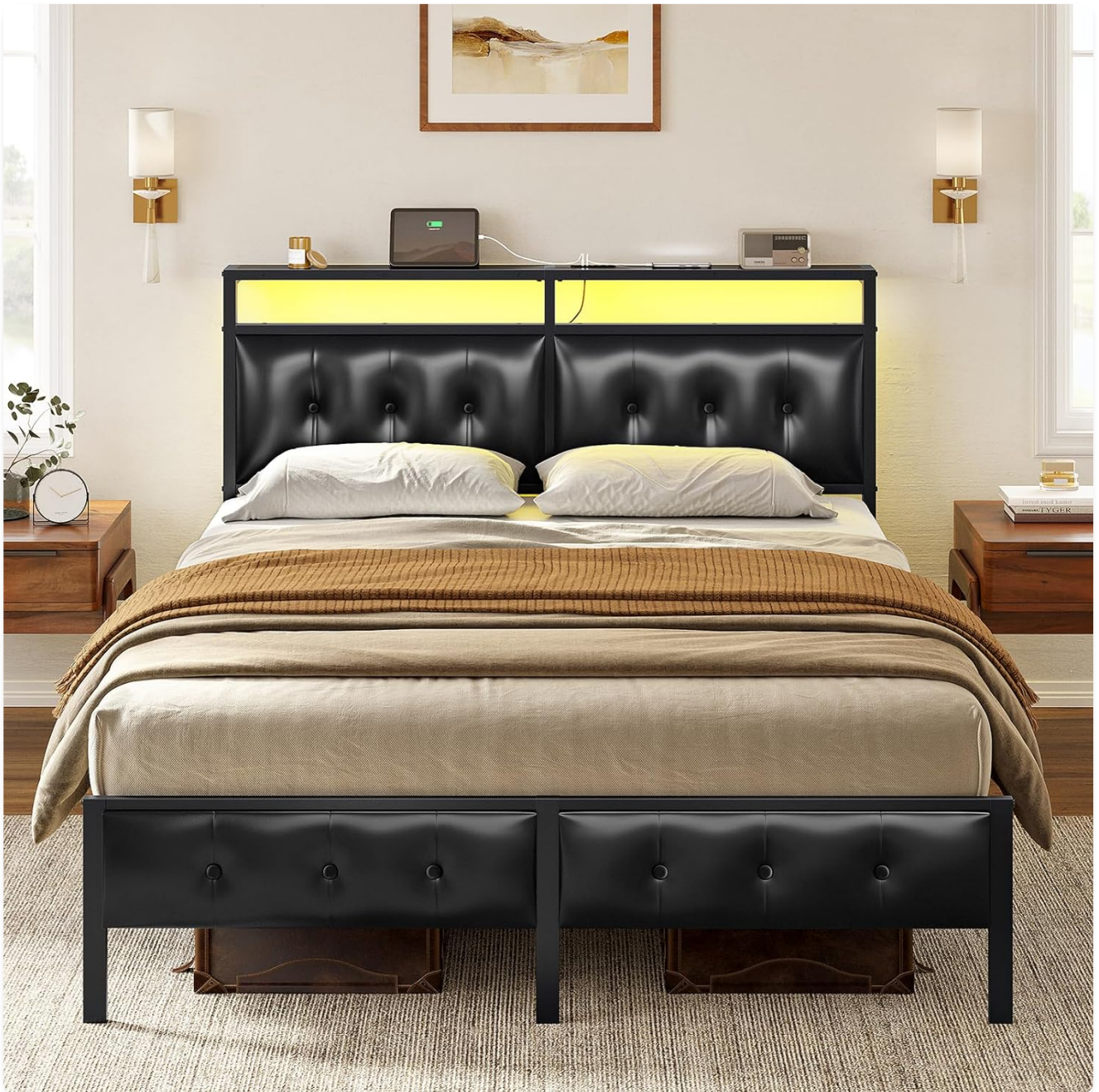
Image: Under-bed storage space.