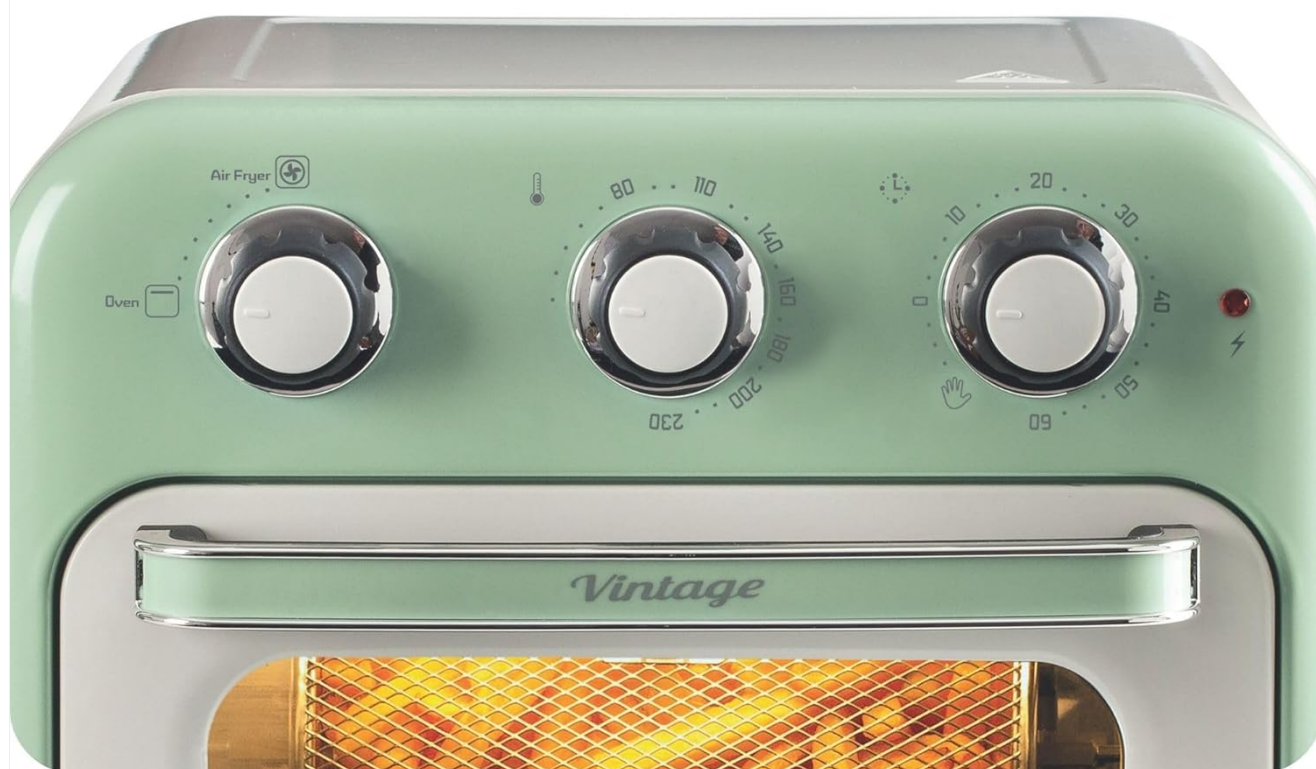
Image Description: A close-up view of the control panel of the Ariete 4632. It shows three rotary knobs: one for cooking type (Oven/Air Fryer), one for temperature (up to 230°C), and one for the timer (up to 60 minutes).