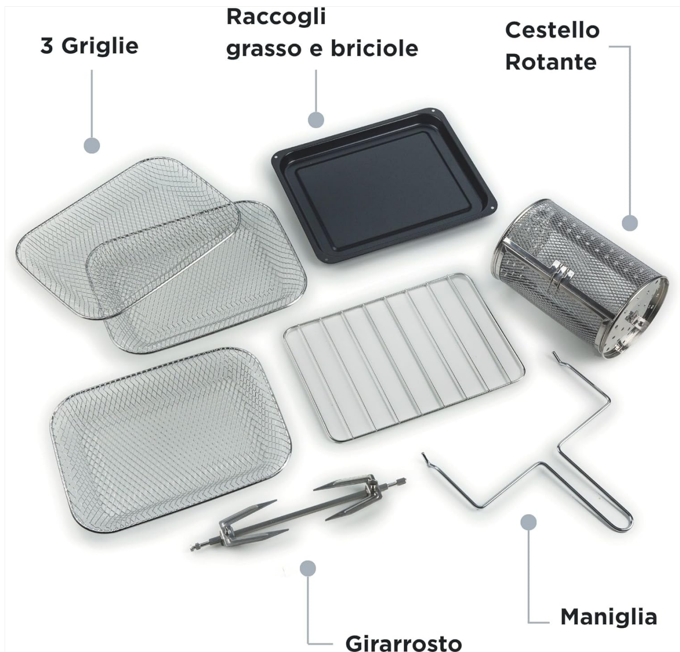
Image Description: An assortment of accessories included with the Ariete 4632. These include three stainless steel perforated baskets, a stainless steel rotating basket, a stainless steel grill, a stainless steel rotisserie set, a drip tray, and a handle for safe removal of hot accessories.