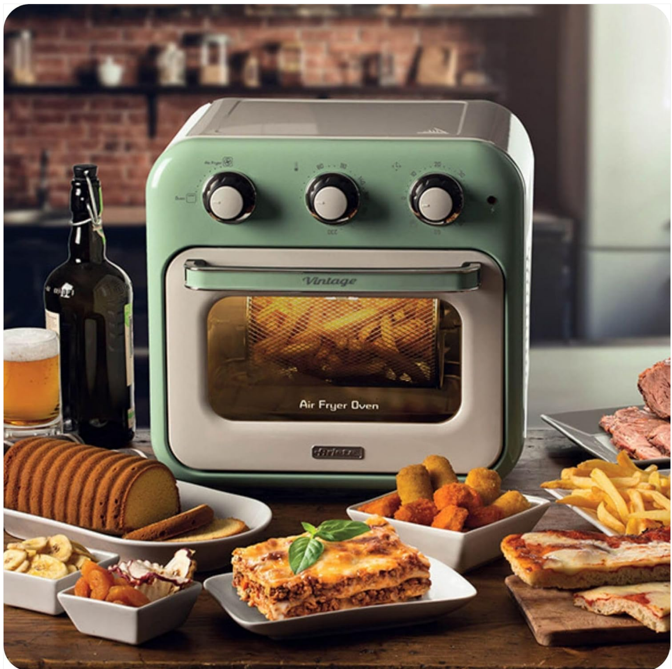
Image Description: The Ariete 4632 Air Fryer and Oven positioned on a wooden table in a kitchen setting, surrounded by a variety of prepared foods such as lasagna, fries, bread, and roasted meats, showcasing its ability to prepare diverse meals.