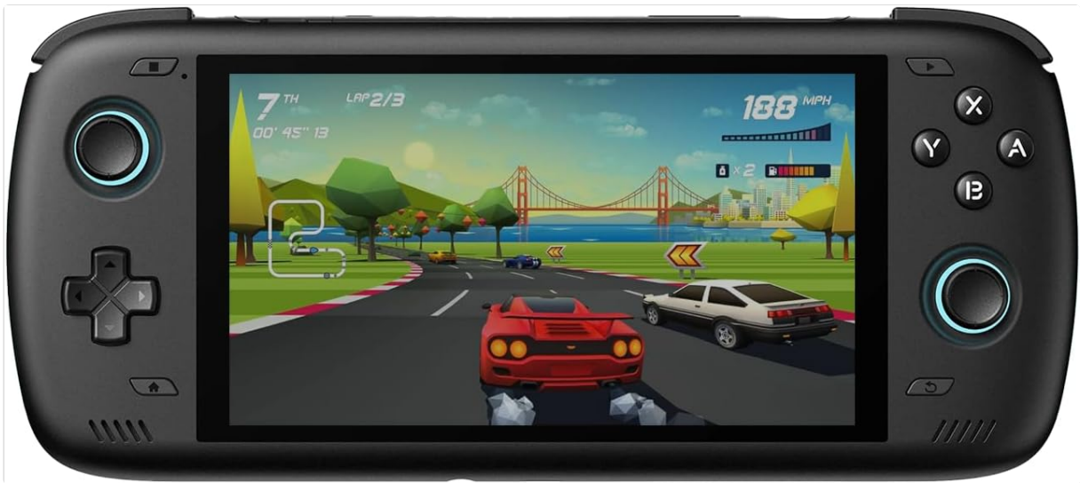
AYN Odin 2 Base Handheld Gaming Device with a game displayed on its screen. This image illustrates the device's front view, showcasing its 6-inch display, joysticks, D-pad, and action buttons.