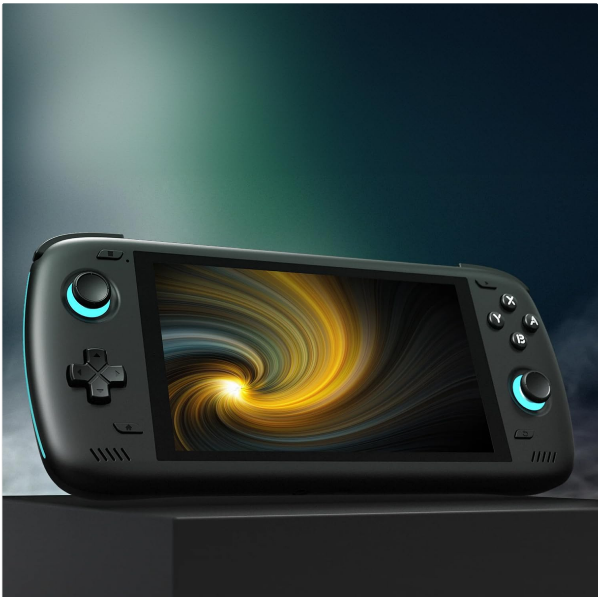
Angled view of the AYN Odin 2 Base, showcasing its ergonomic design and the subtle illumination around its joysticks.