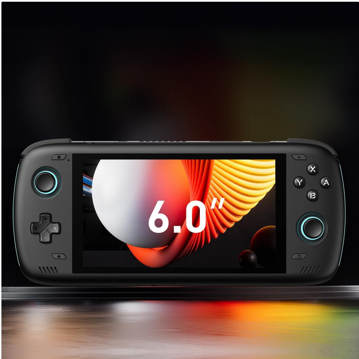
Graphic highlighting the 6.0-inch screen of the AYN Odin 2 Base, emphasizing its display size.