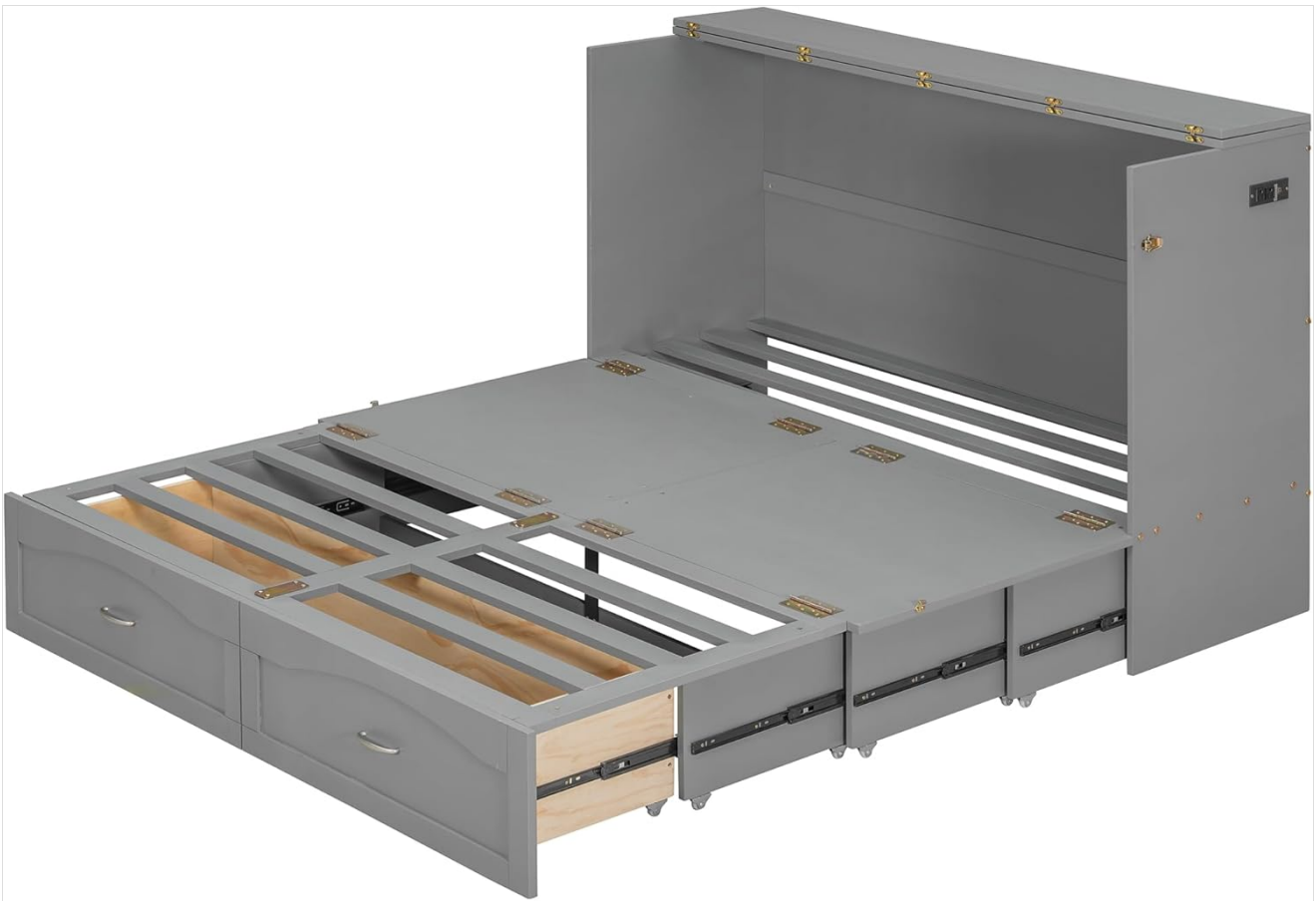
Figure 3: Bed in Transition