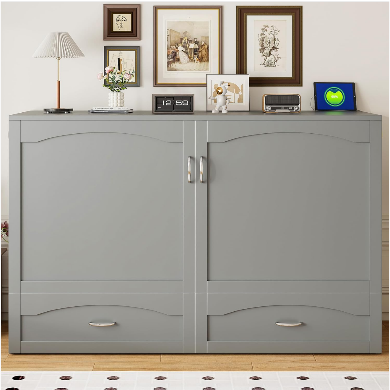
Figure 4: Bed in Cabinet Configuration