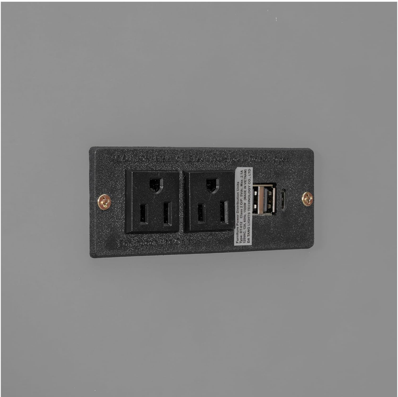
Figure 5: Charging Station Detail