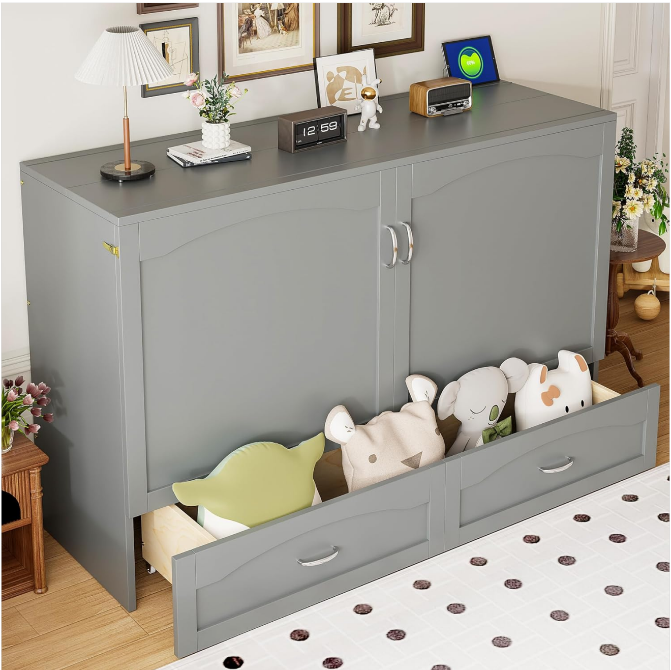
Figure 6: Storage Drawer in Cabinet Configuration