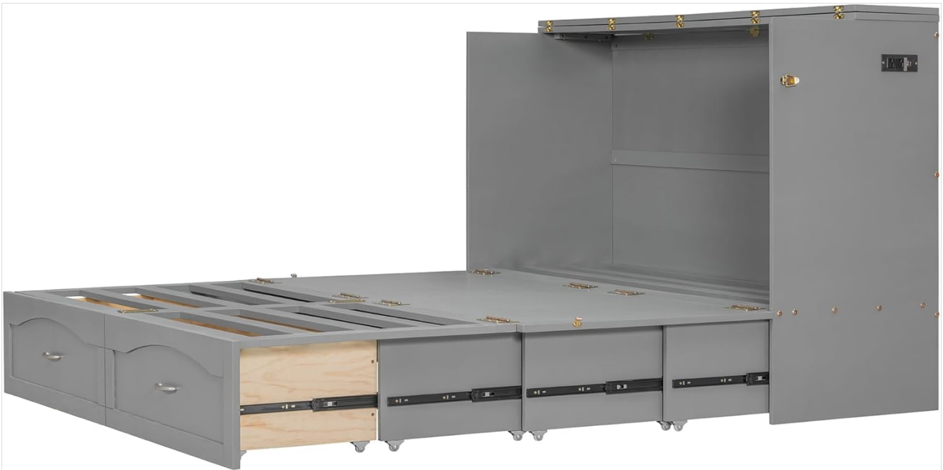
Figure 2: Internal Structure and Pulley System