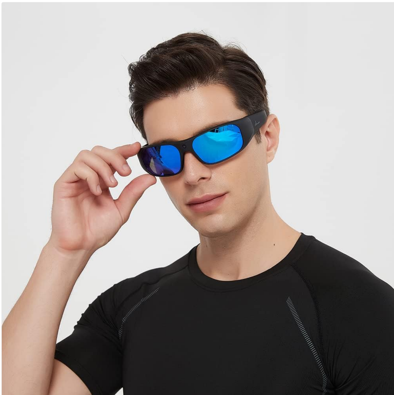
Image: A man wearing the OhO sunshine Smart Bluetooth Sunglasses with blue mirrored lenses, demonstrating typical use.