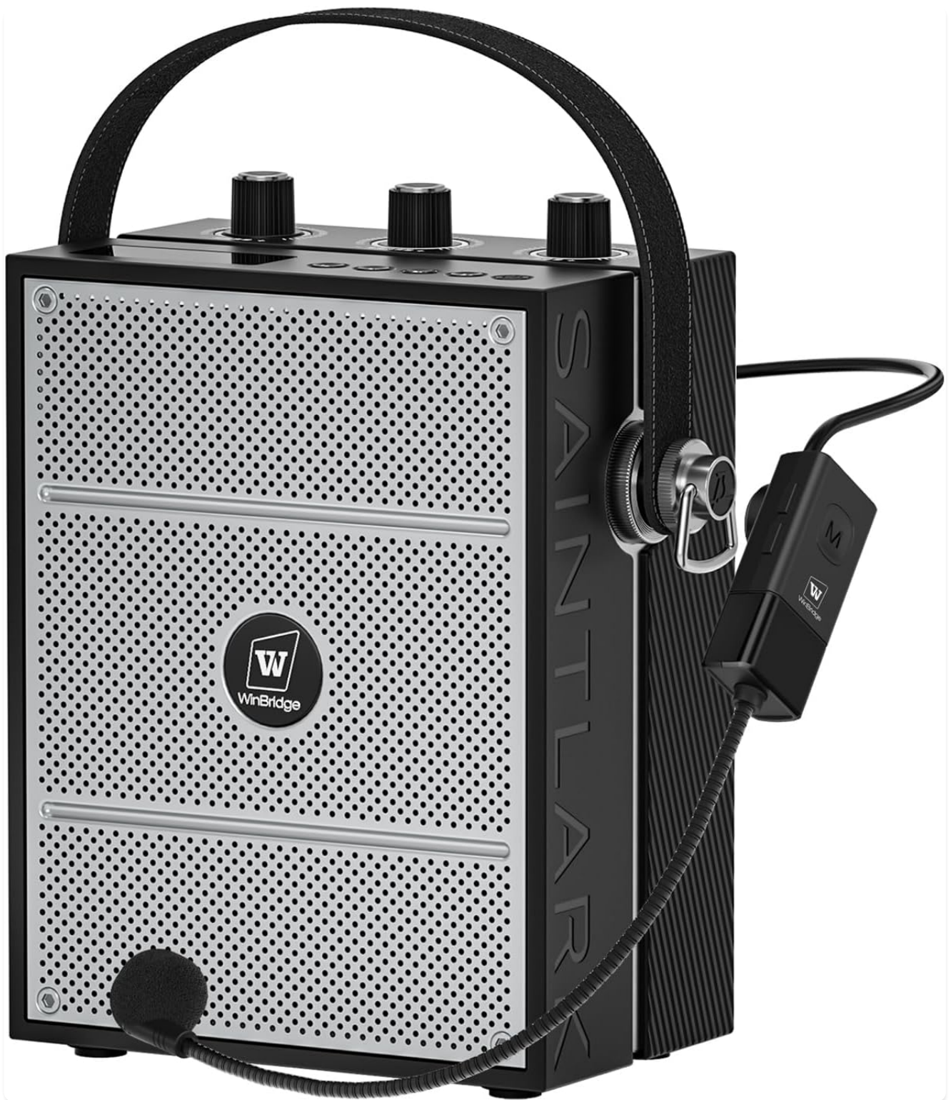
The HW HAOWORKS S98 Voice Amplifier, a portable PA system, shown with its included wireless headset microphone.