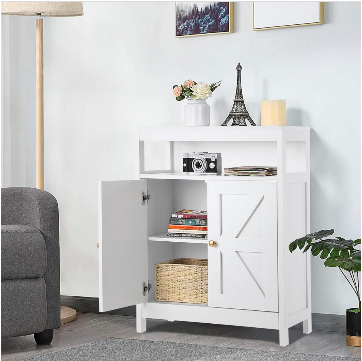
Image: Detailed view of the cabinet's metal hinges, round golden knobs, and overall modern design, illustrating key hardware components.