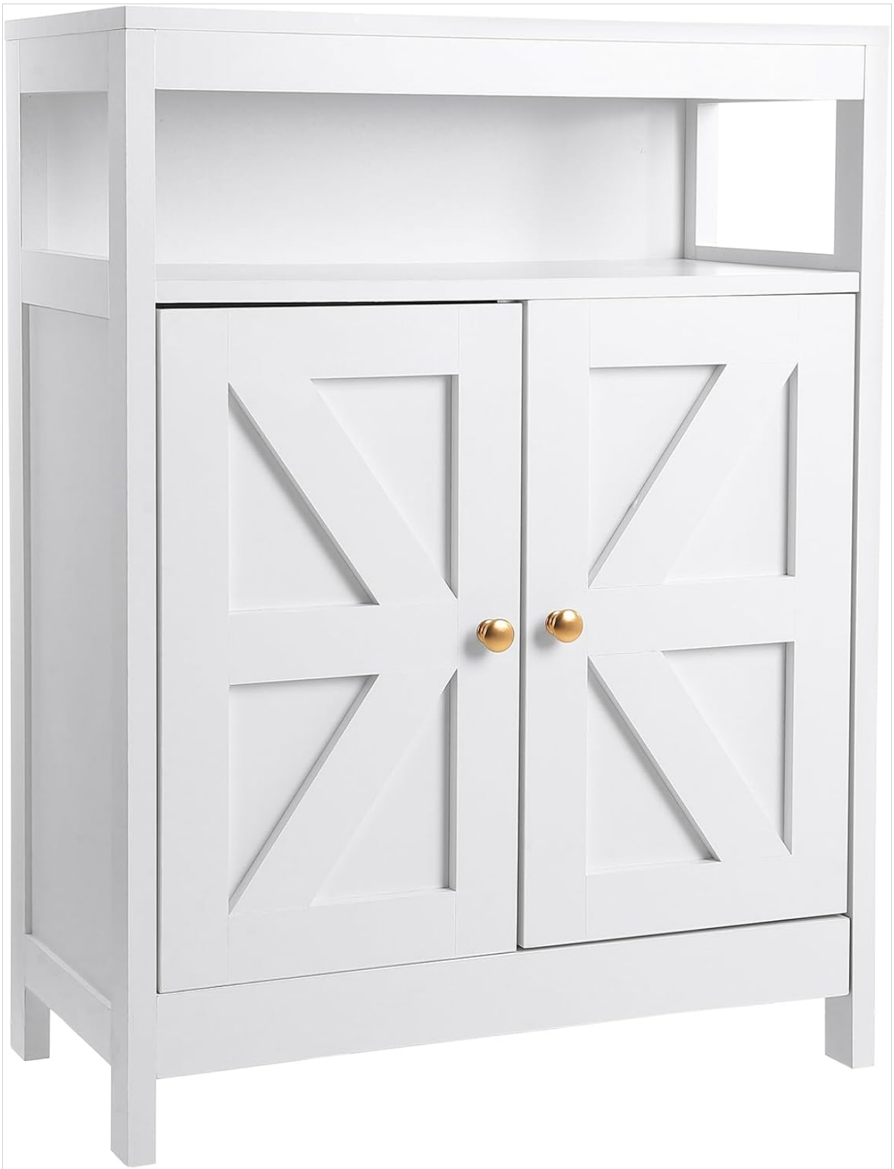
Image: The GAOMON BFC-2-W cabinet displayed in a living room, showcasing its two doors and open shelf.