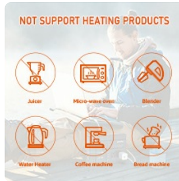
Image: Visual representation of appliances not supported by the power station due to high wattage, including juicers, microwave ovens, blenders, water heaters, coffee machines, and bread machines.