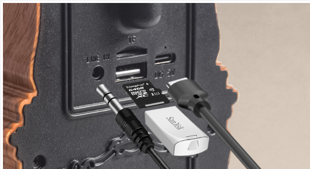
Image: A detailed view of the speaker's rear input panel, showing the AUX, USB, TF card, and DC 5V charging ports, illustrating the various connectivity options.