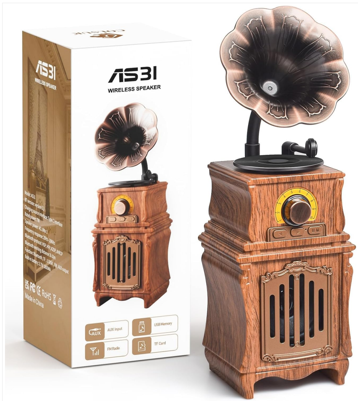
Image: The FREEFISH Retro Bluetooth Speaker AS31 shown alongside its product packaging, highlighting its compact size and vintage design.