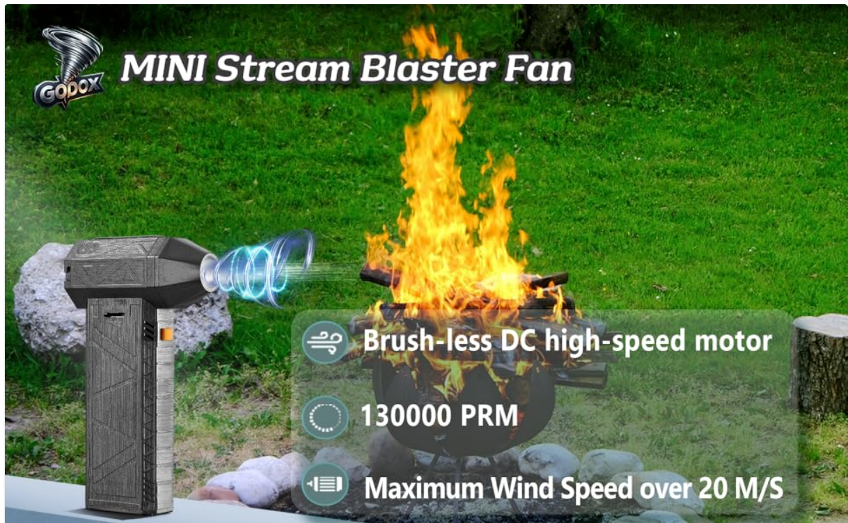
Image 3.1: GODOX Jet Fan Dry Mini Blower showing its compact size (approximately 5.5 inches tall, 3.14 inches wide, 1.8 inches deep) and key features including a brushless DC high-speed motor, 130,000 RPM, and a maximum wind speed over 20 M/S.

The GODOX Jet Fan Dry Mini Blower features a robust design with a powerful motor and a user-friendly interface.