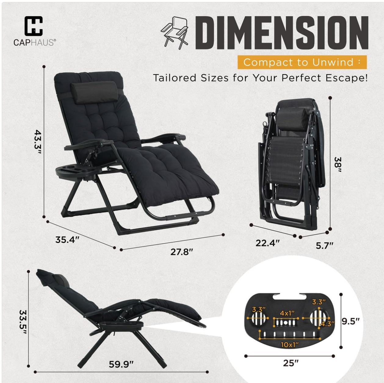
Image: Dimensions of the chair in various configurations.