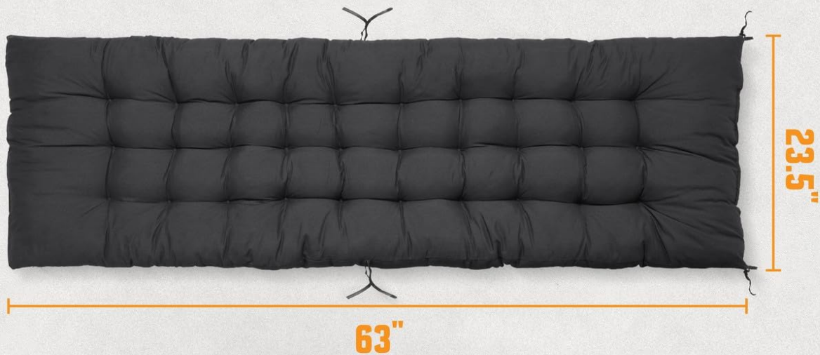
Image: Details of the comfortable soft pad.