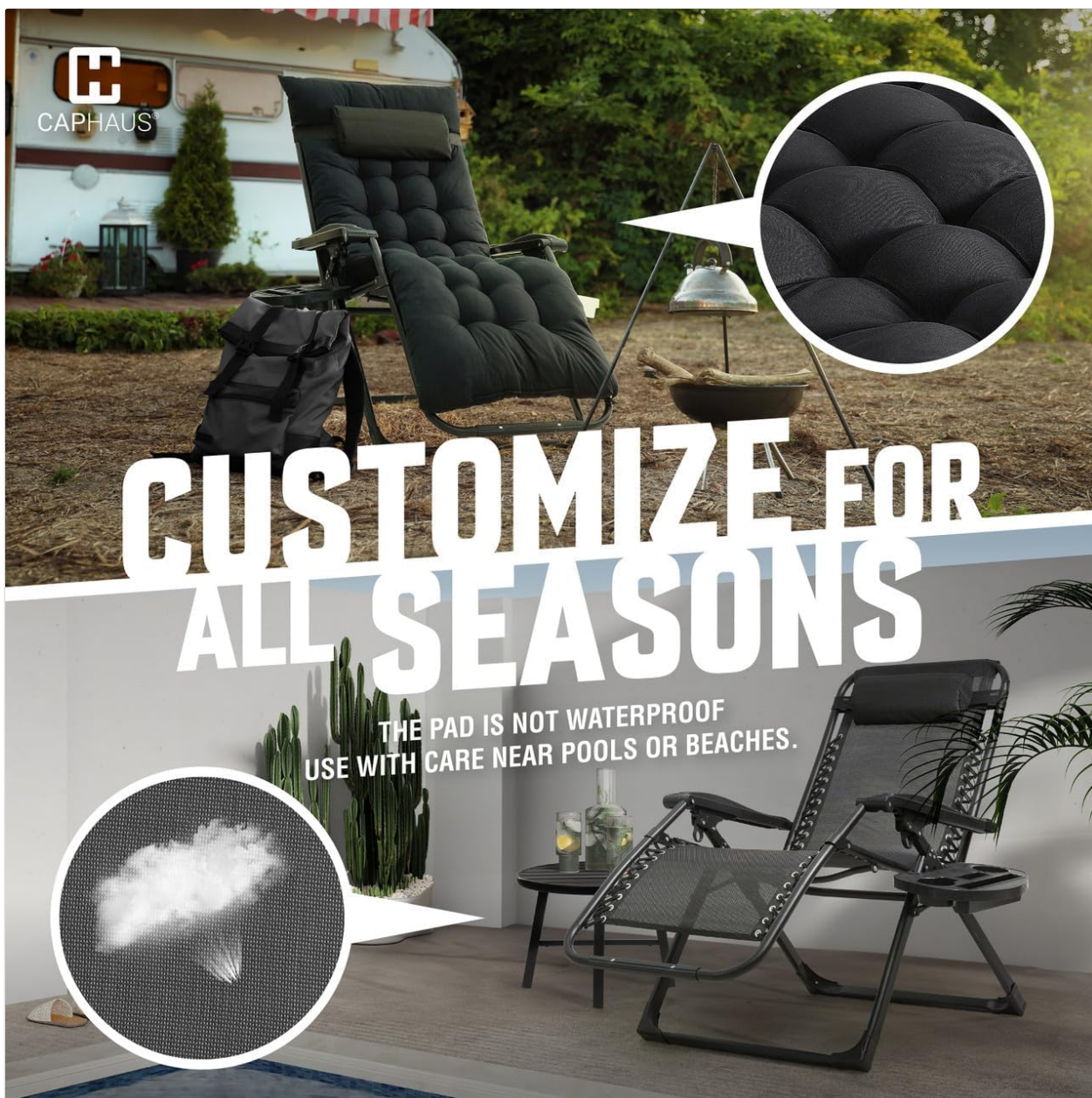
Image: Seasonal use and waterproof warning for the cushion.