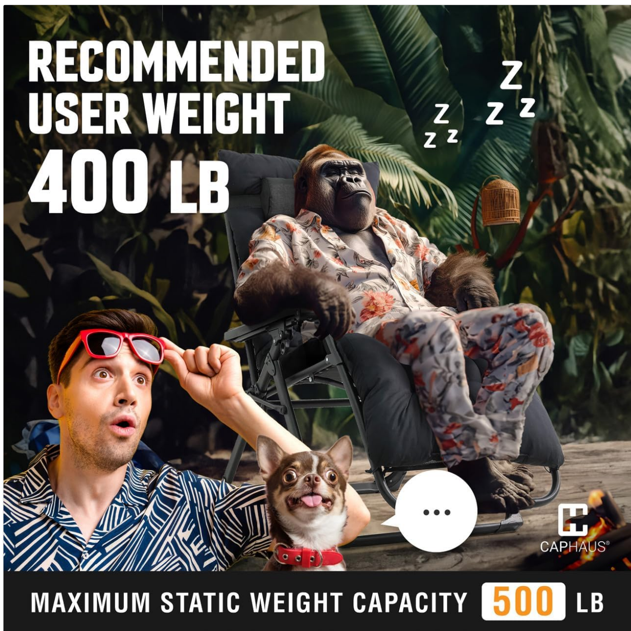
Image: Recommended user weight and maximum static weight capacity for the chair.