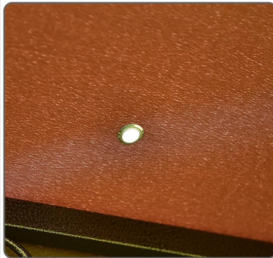
8 holes in the roof for better drainage