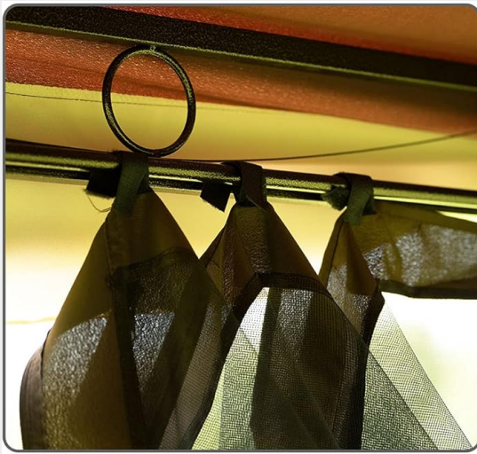
Velcro straps fastening the net