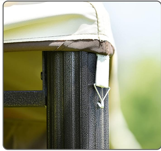
Hooks in each pole for fixing roof's fabric