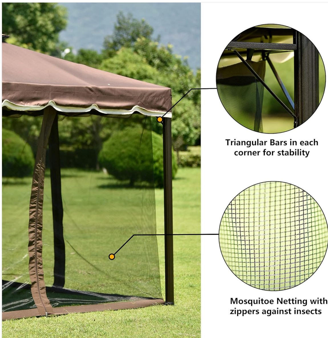
Image: A fully assembled Merax Gazebo with the brown canopy and black netting installed, showing the overall structure.