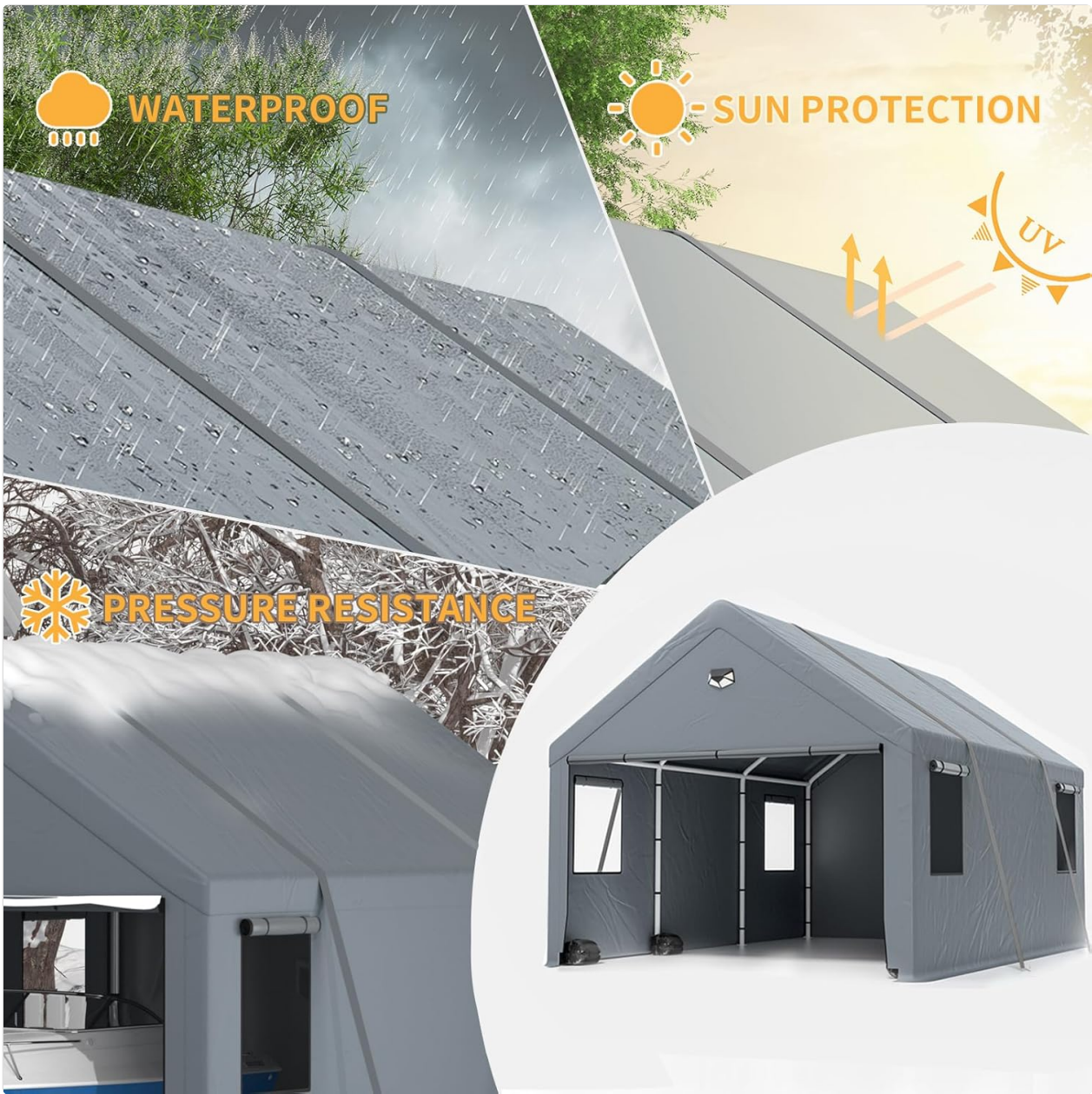
Figure 2: Weather Protection Features