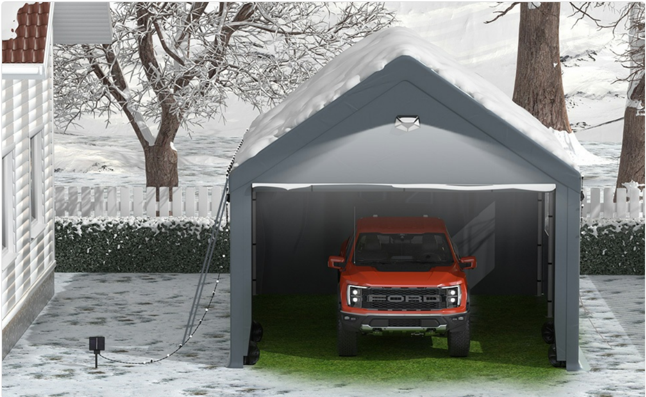
Figure 4: Carport Frame Structure