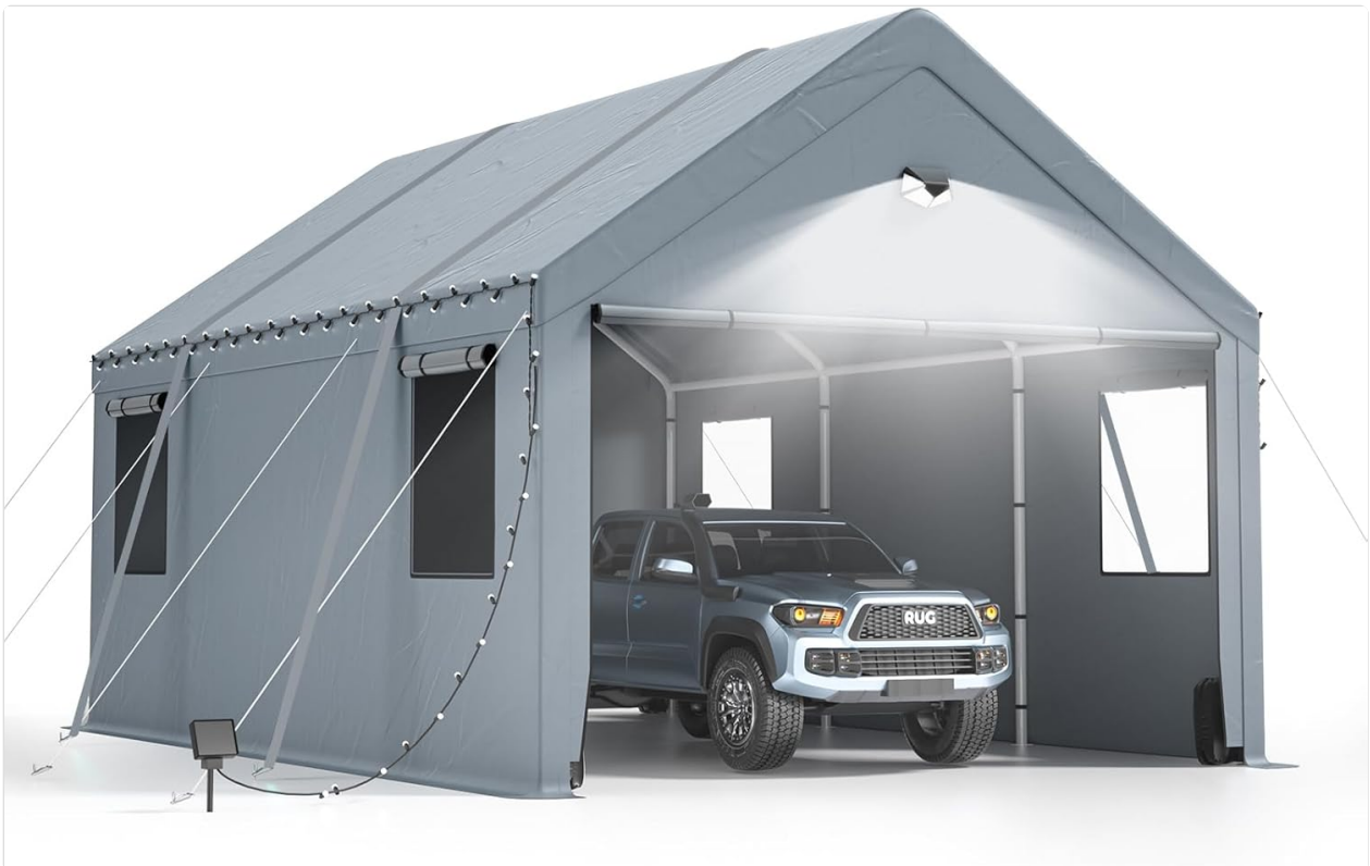
Figure 1: Sannwsg 10x20 Heavy Duty Carport Canopy

This manual provides detailed instructions for the assembly, operation, maintenance, and troubleshooting of your Sannwsg 10x20 Heavy Duty Carport Canopy. Please read this manual thoroughly before beginning assembly or use to ensure proper setup and safe operation. Retain this manual for future reference.