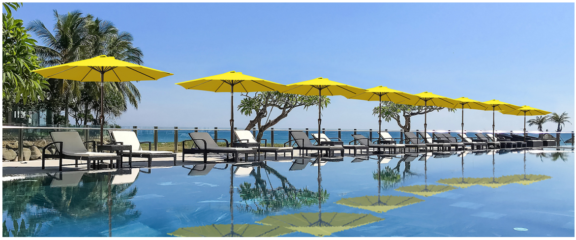
Image: Double-Layer Vent for Airflow

This diagram illustrates the double-layer vent at the top of the canopy, designed to allow wind and heat to escape, improving stability and comfort.