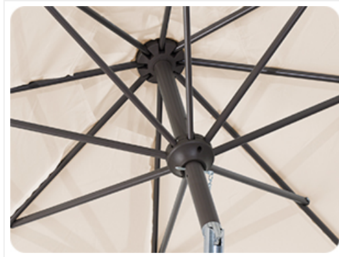
Image: Sturdy Rib Construction

This image shows the crank handle, which allows for smooth and comfortable opening and closing of the umbrella canopy.