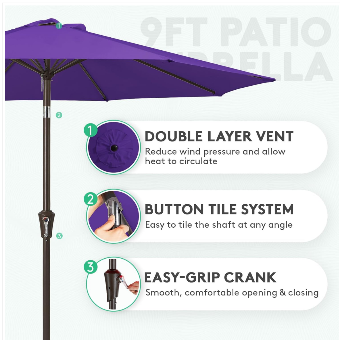
Image: Key Features Overview

This diagram highlights the double-layer vent for air circulation, the push-button tilt system for angle adjustment, and the easy-grip crank for opening and closing the umbrella.