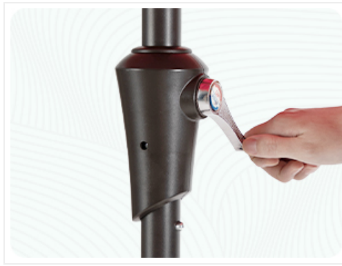
Image: Easy-Grip Crank Handle

This image shows the crank handle, which allows for smooth and comfortable opening and closing of the umbrella canopy.