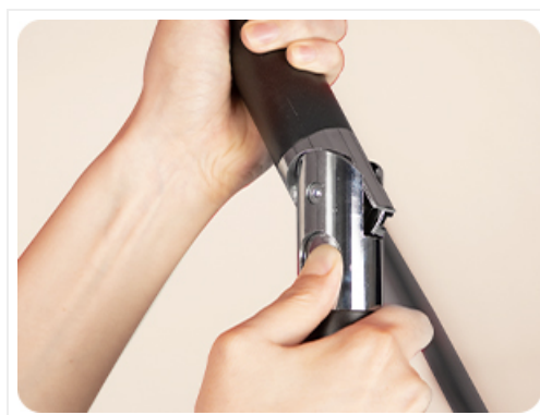
Image: Push-Button Tilt Mechanism

This diagram highlights the double-layer vent for air circulation, the push-button tilt system for angle adjustment, and the easy-grip crank for opening and closing the umbrella.