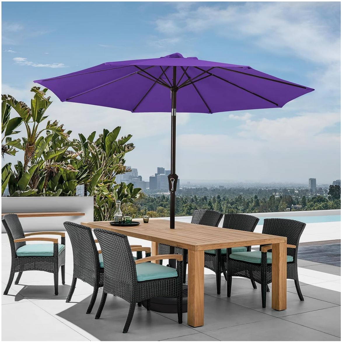
Image: Umbrella Tilt Function

This image demonstrates the umbrella's ability to tilt, allowing for flexible shade coverage as the sun moves.