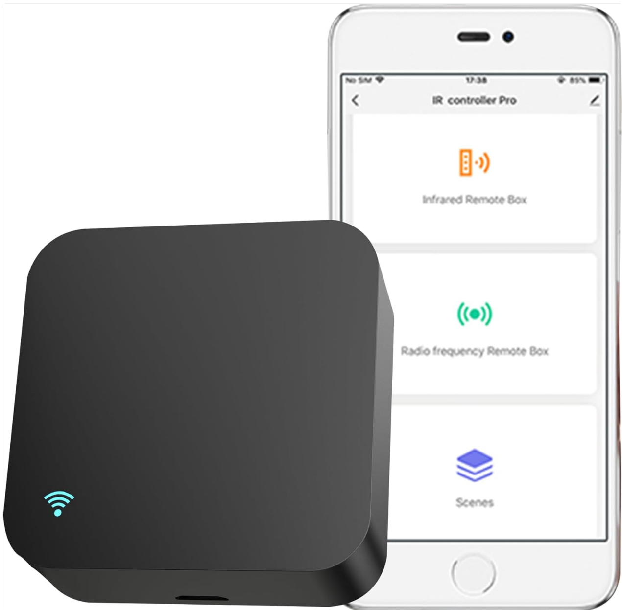
Image: The QXMH WiFi Universal IR Remote Control device and its accompanying mobile application interface.