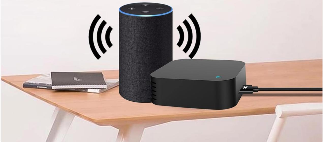
Image: Voice control capabilities with popular smart assistants.