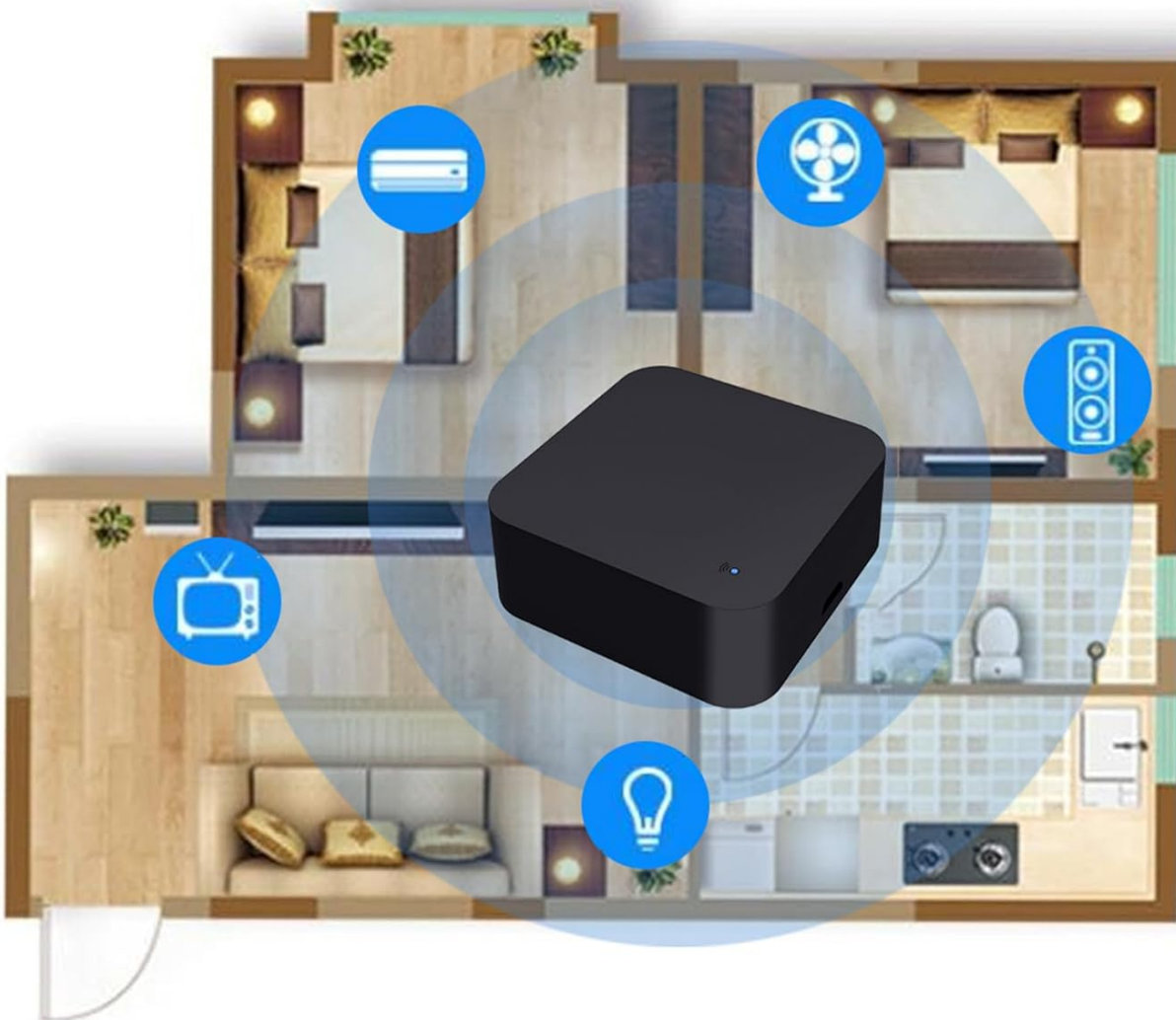
Image: The device provides 360° full coverage for infrared control.

Infrared control range of about 8 meters, stable signal