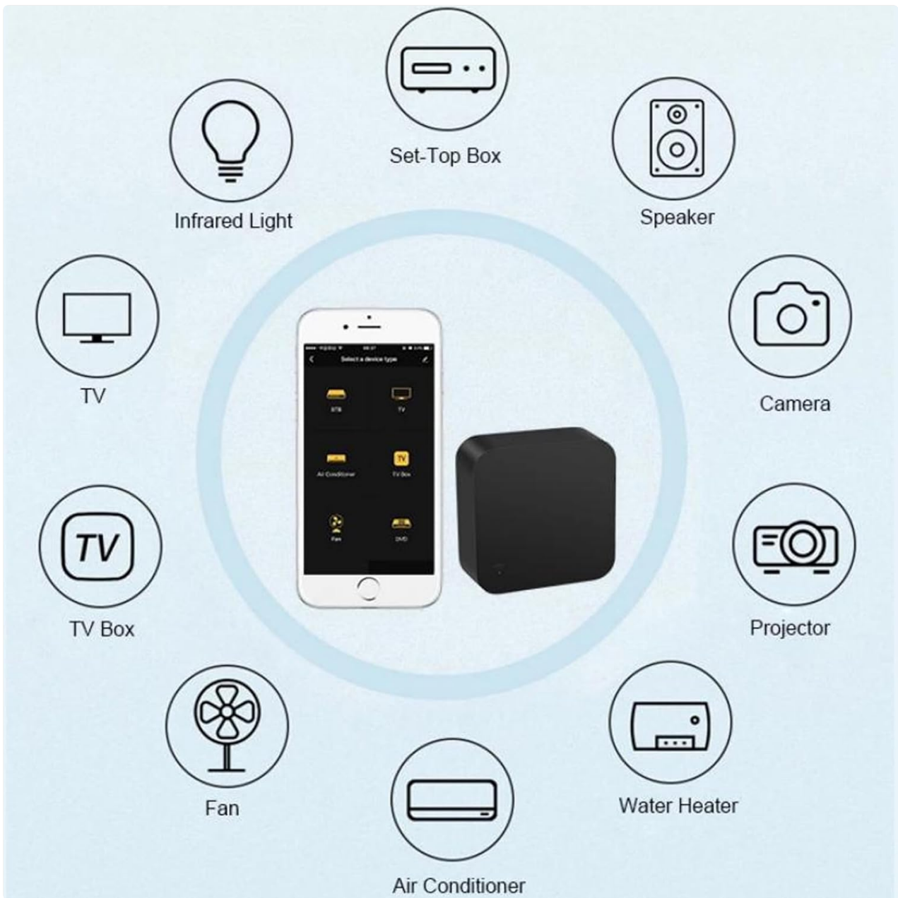
Image: Examples of appliances compatible with the universal remote control.