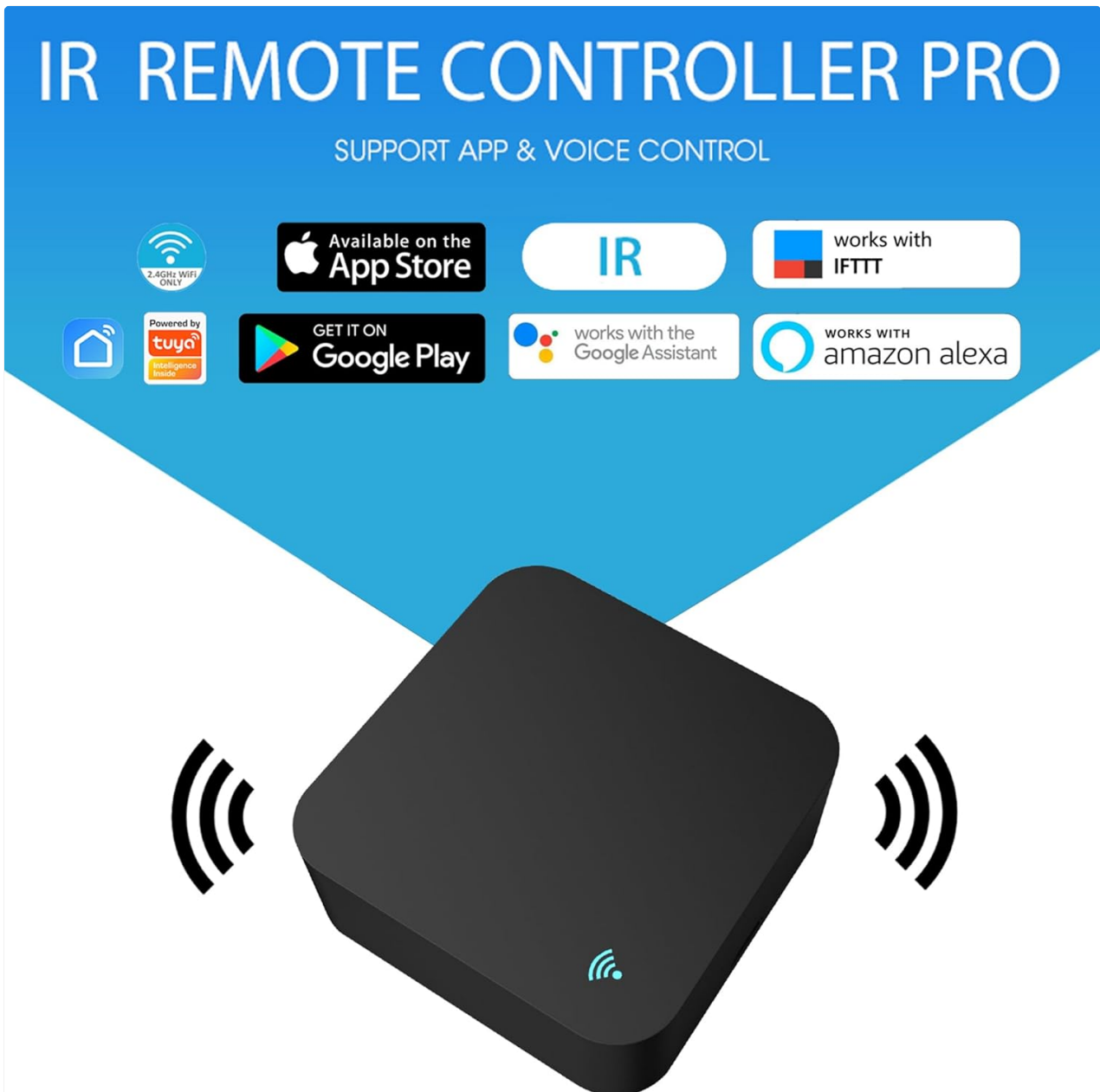
Image: Compatibility and app download options for the IR Remote Controller Pro.