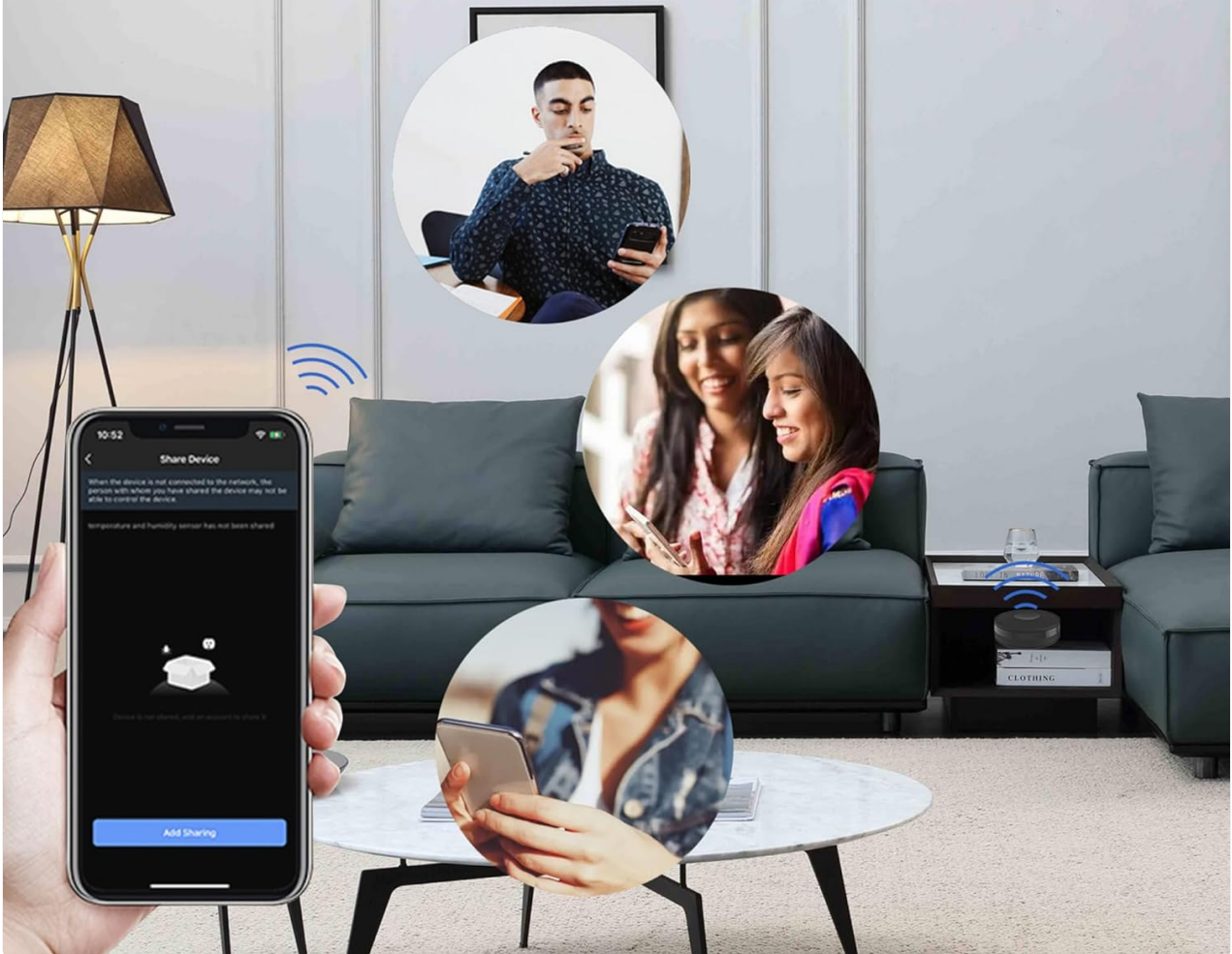
Image: Share devices with family members to create a smart home life together.

Create a smart home life with your family