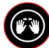
comfortable Fit for hands

Image: A close-up of the 61-key mechanical keyboard, with icons illustrating its key features: Cyan axis mixed light, a variety of cool lights, mechanical switch, Type-C detachable power cord, and comfortable fit for hands.