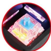
Cyan axis mixed light