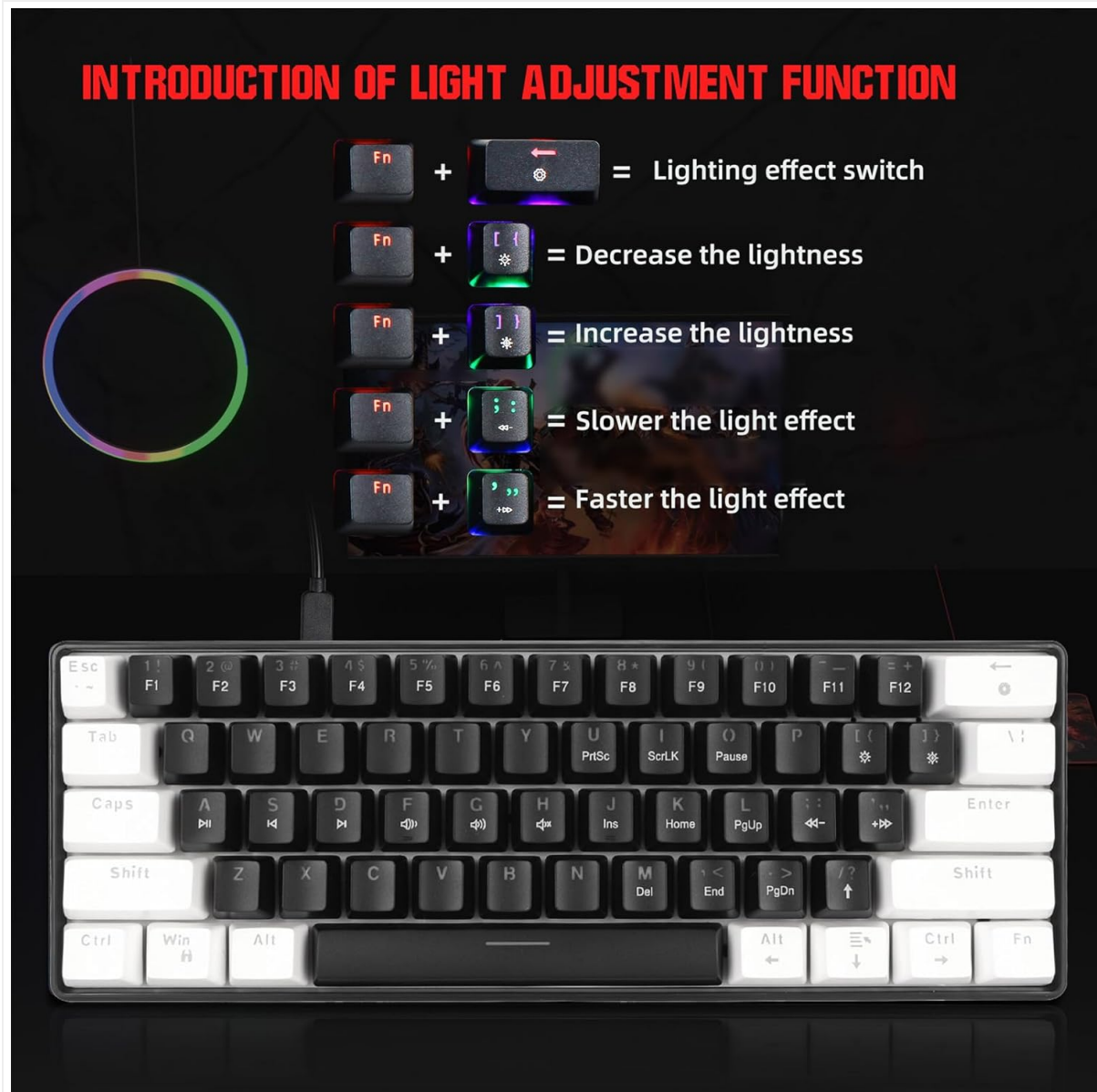
Image: A visual guide demonstrating the key combinations for adjusting the keyboard's lighting effects, including switching modes, changing brightness, and adjusting animation speed, using the Fn key.