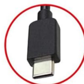
Type-C Detachable power cord