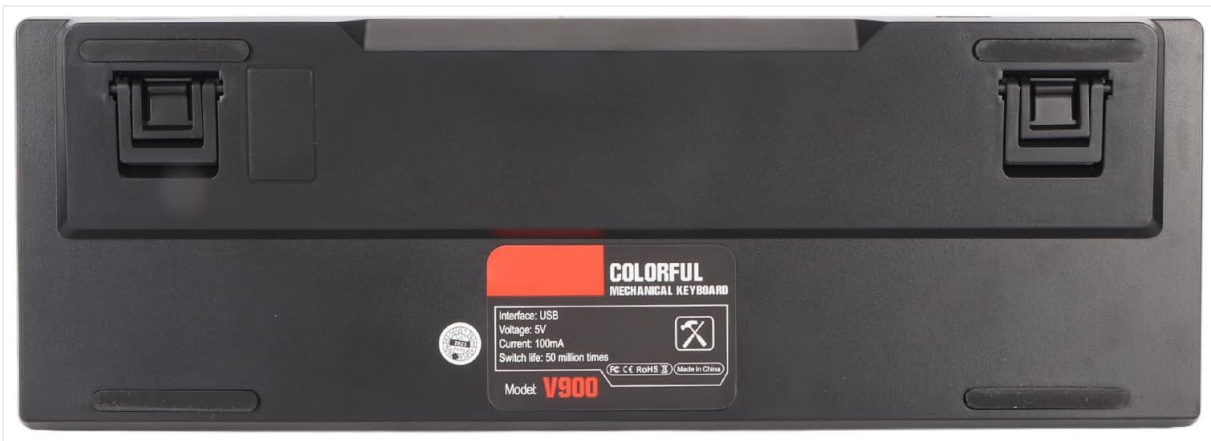
Image: The underside of the Sxhlseller 61 Key Mechanical Keyboard, displaying a label with technical details such as interface, voltage, current, switch life, and model number V900.