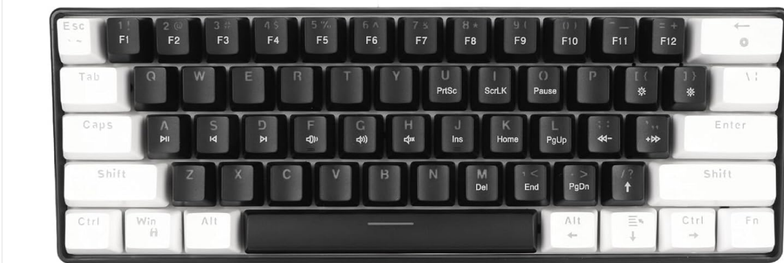
Image: The 61-key mechanical keyboard displayed with icons representing its compatibility with a notebook, desktop PC, and an all-in-one computer, demonstrating its versatility across different setups.