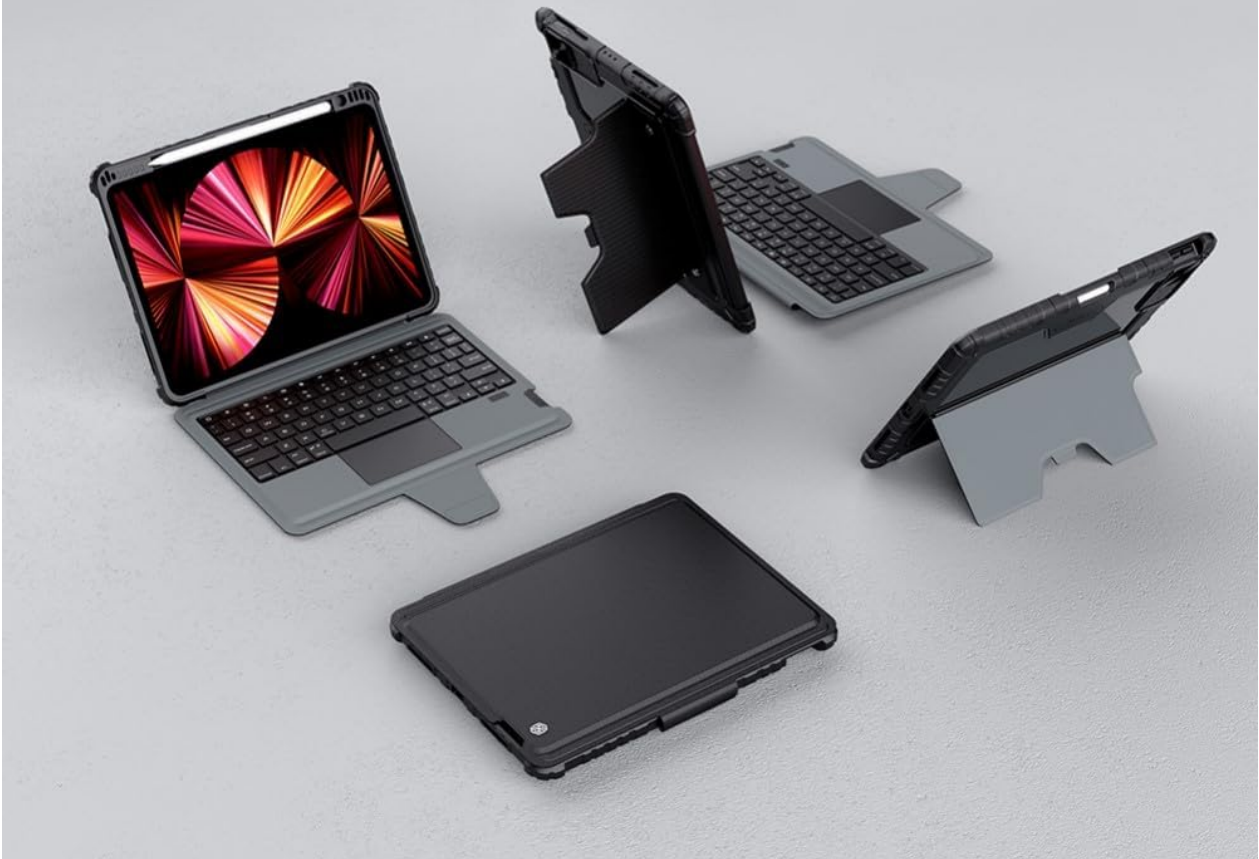
Image: Various usage modes of the keyboard case, illustrating how it can be configured for different tasks like typing, viewing, and drawing.

Expand multiple functions for iPad to improve learning and work efficiency