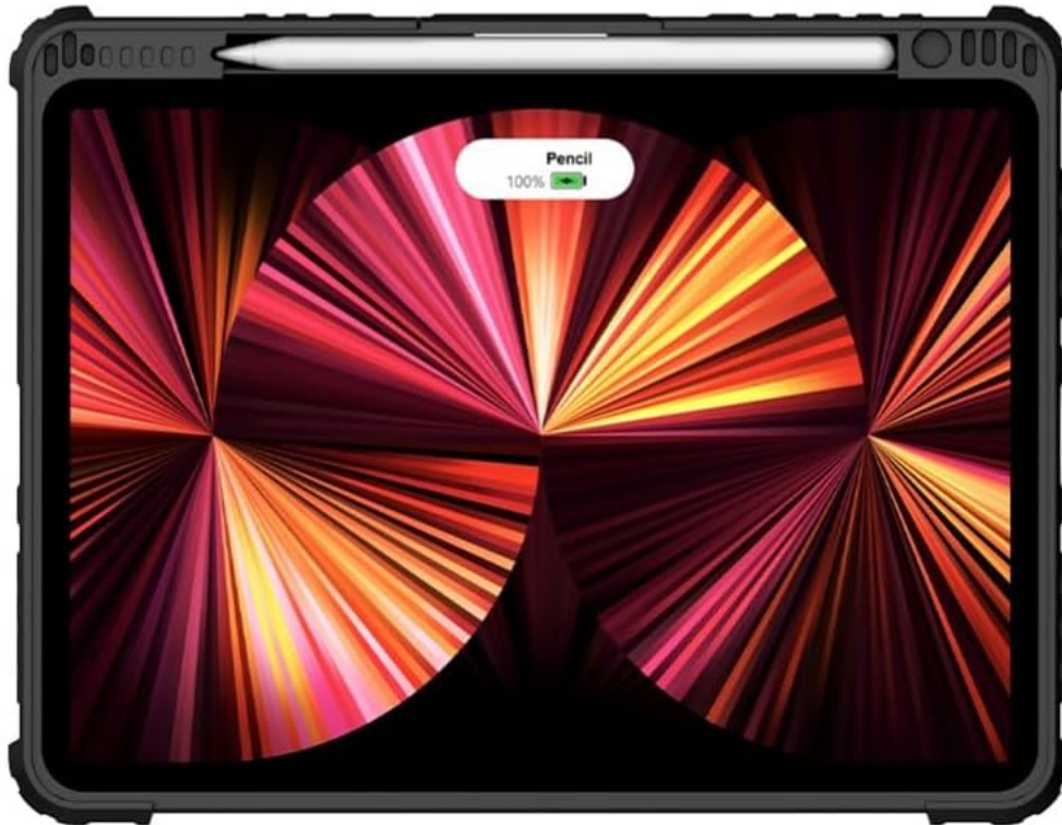
Image: The Apple Pencil holder, showing the pencil securely stored and charging within the case.