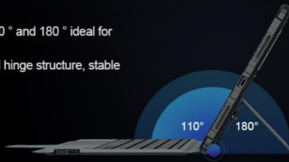
Image: The adjustable stand in action, demonstrating the range of viewing angles from 0° to 180° for optimal comfort.

Freely adjust between 0 ° and 180 ° ideal for whatever you're doing. Strengthen mechanical hinge structure, stable and no shaking.