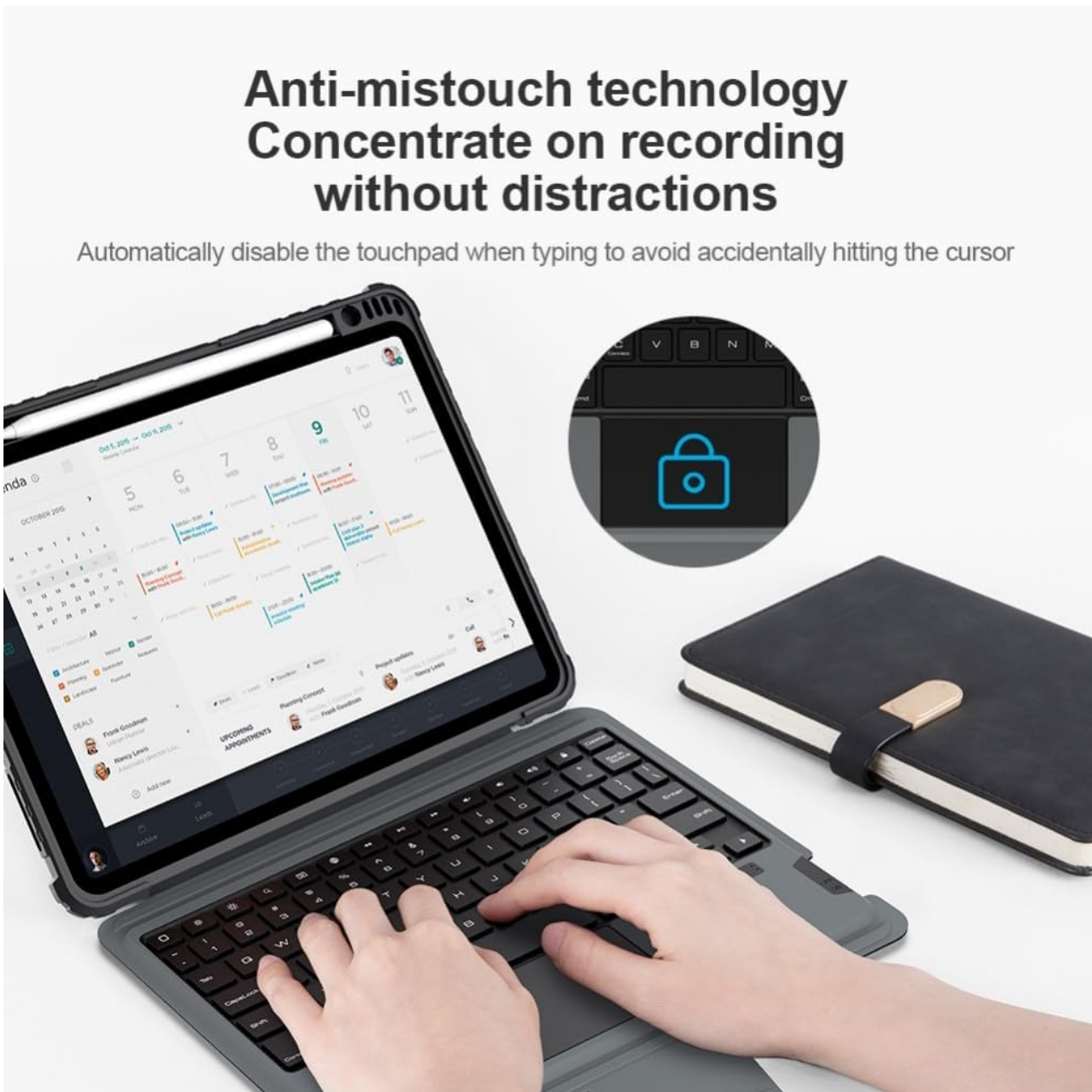
Image: An iPad in the keyboard case, illustrating the anti-mistouch technology that disables the trackpad during typing.

The keyboard also features anti-mistouch technology, which automatically disables the touchpad when typing to prevent accidental cursor movements, allowing you to concentrate on your work.