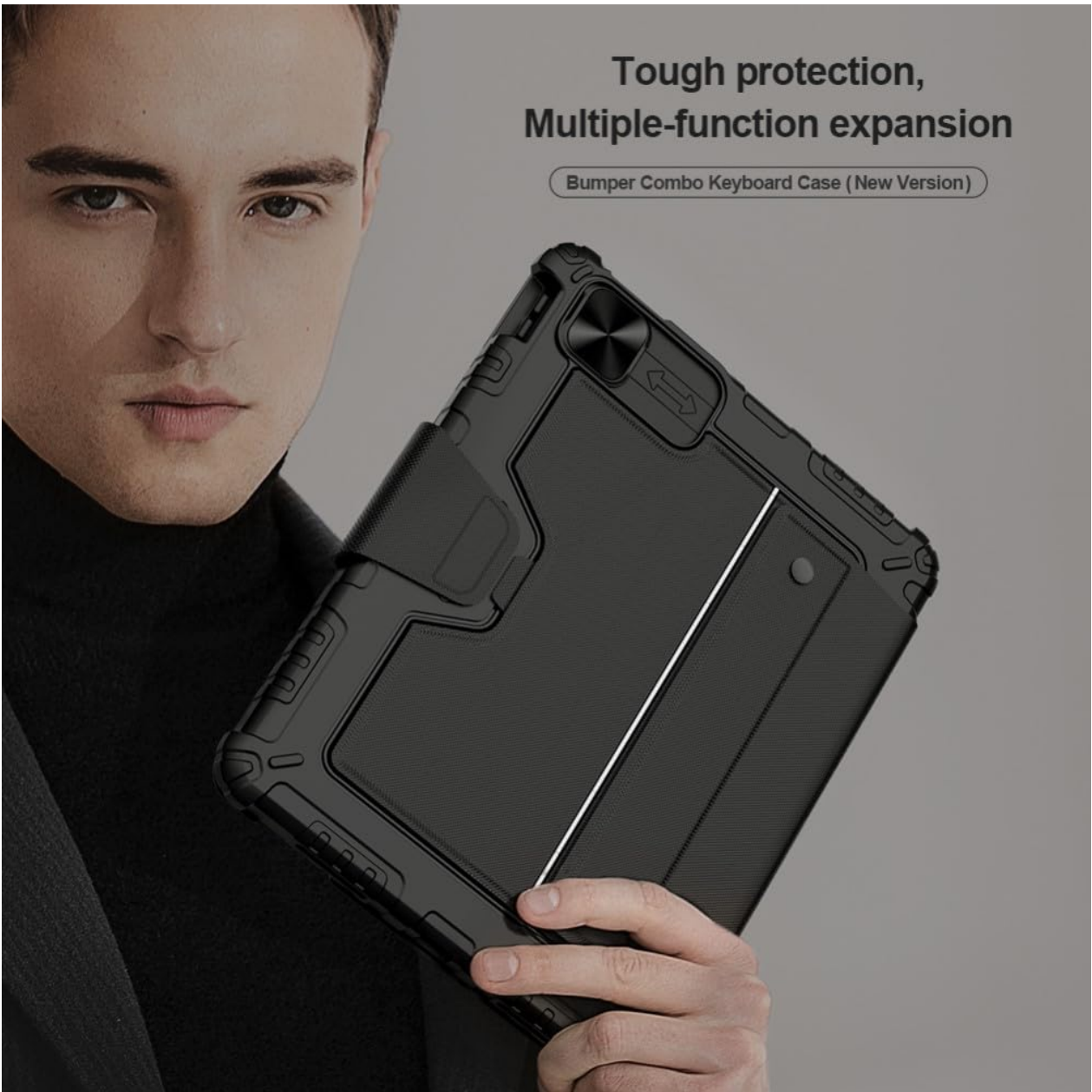
Image: The Nillkin Bumper Combo Keyboard Case, highlighting its protective and multi-functional design.

Bumper Combo Keyboard Case (New Version)