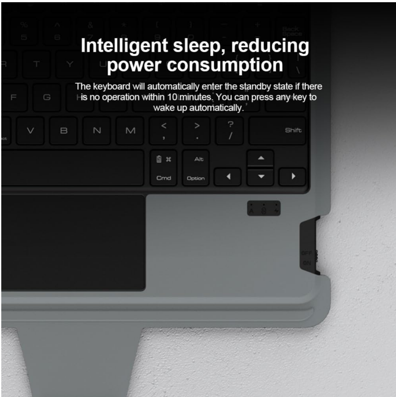
Image: The keyboard's intelligent sleep feature, which automatically puts the device into standby after 10 minutes of inactivity to save power.