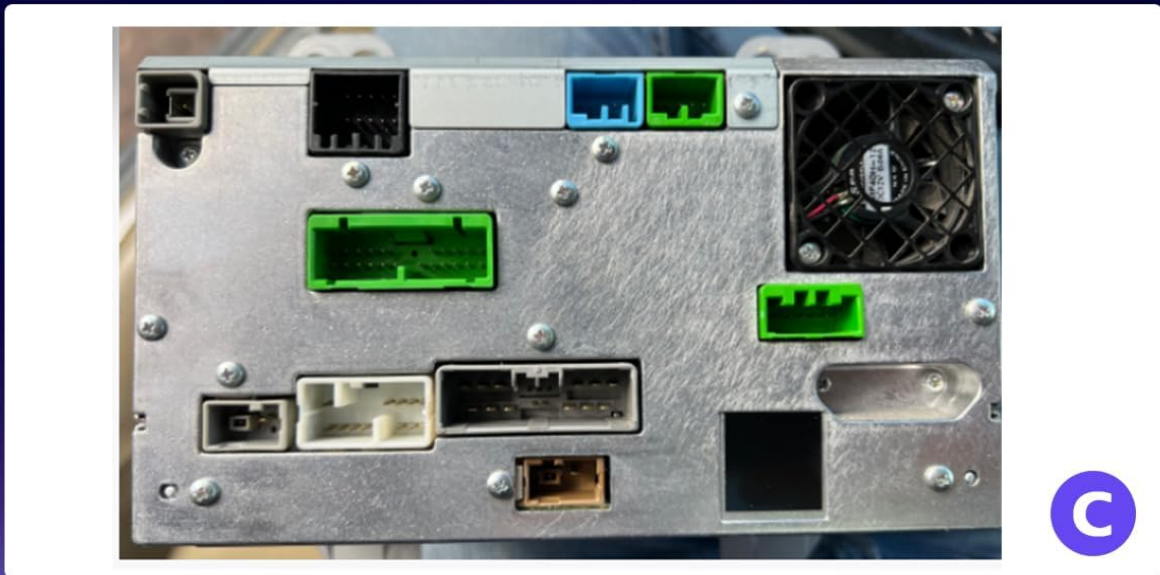
Image: Honda CRV center console, Type A, with a large screen.