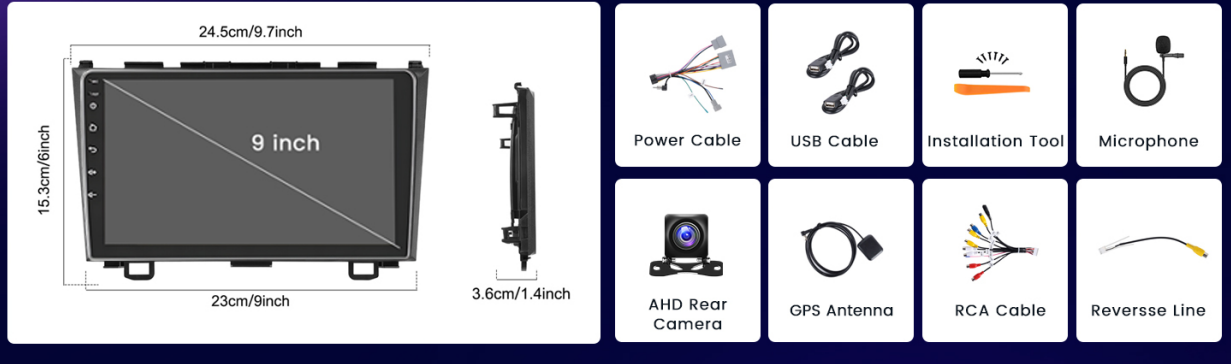
Image: A detailed wiring diagram illustrating the connections for the power cable, RCA cable, USB cables, camera input, radio antenna, and GPS antenna.

After purchase, you will receive the following products!