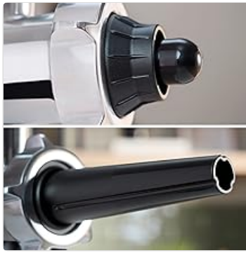
Image: A close-up of the sausage stuffer attachment, showing its conical shape for filling casings.