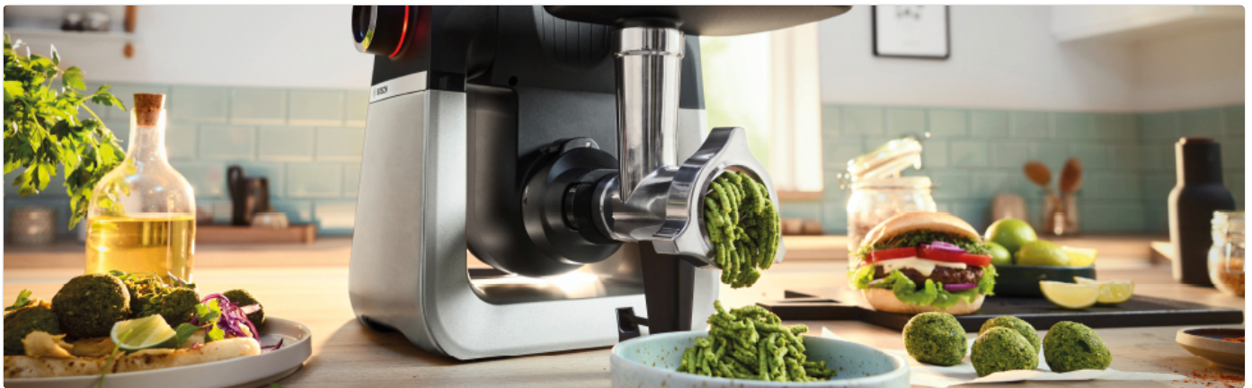
Image: A Bosch food processor with the meat grinder attachment in use, processing green ingredients. This illustrates the grinder attached to the main unit.