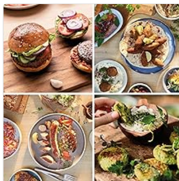
Image: A collage of various dishes, including burgers, falafel, and other prepared foods, showcasing the versatility of the Bosch accessory kit.