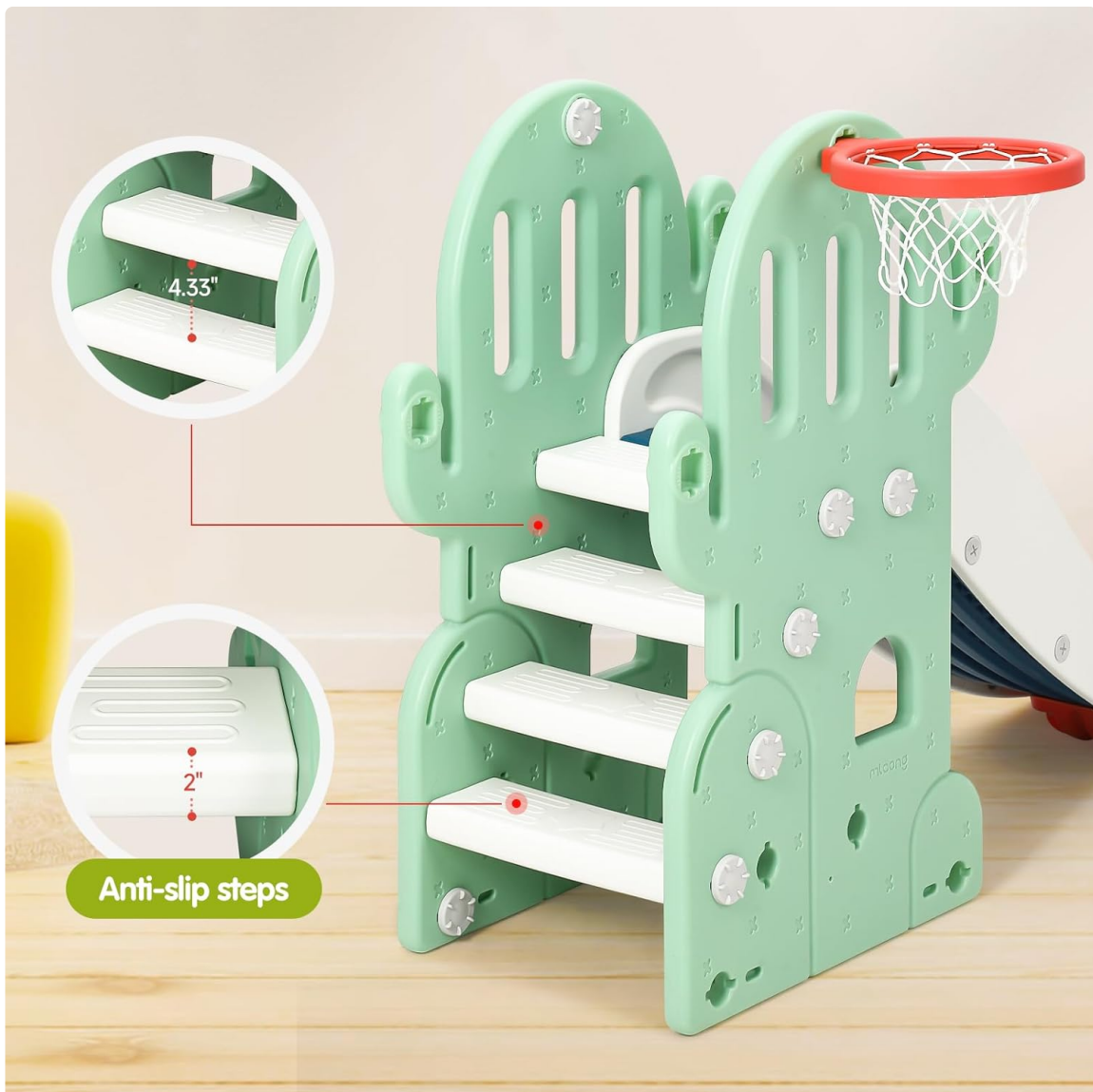
Figure 3.1: Anti-slip steps for safe climbing.