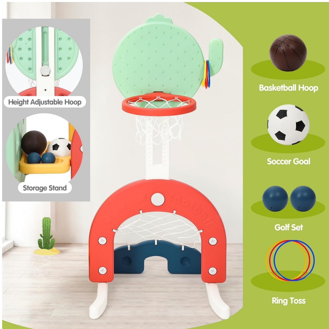
Figure 4.3: Multi-sport features including basketball, soccer, golf, and ring toss.