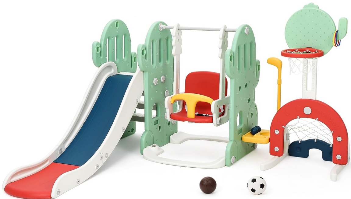
Figure 1.1: Overview of the 7-in-1 Toddler Slide and Swing Set.

This manual provides essential information for the safe assembly, operation, and maintenance of your GAOMON 7-in-1 Toddler Slide and Swing Set. This versatile playset is designed to provide a fun and engaging environment for toddlers, combining multiple activities in one compact unit.