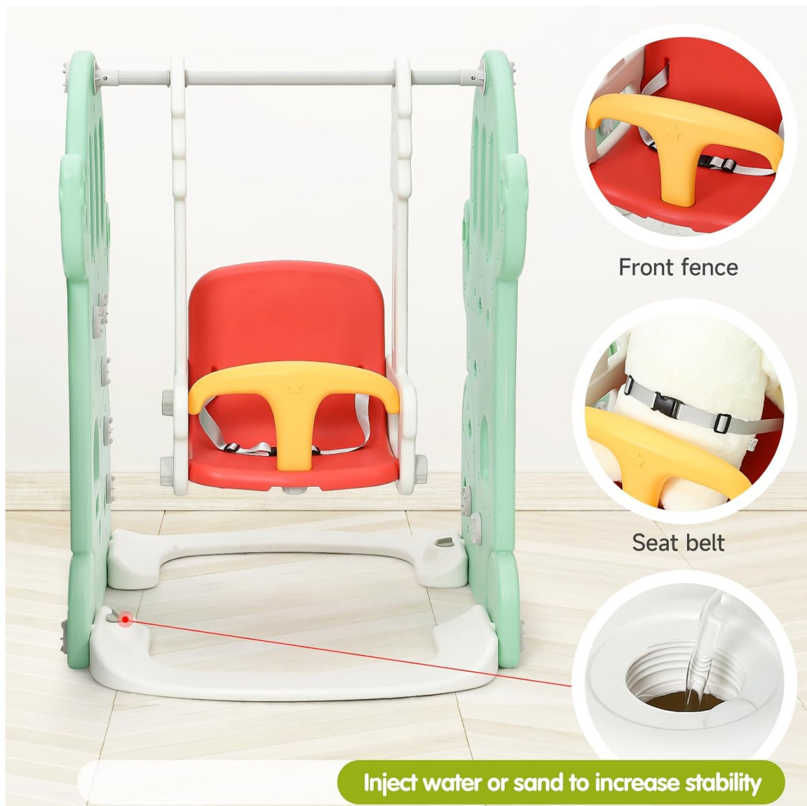
Figure 2.1: Stability and Safety Features (Water/Sand Injection, Front Fence, Seat Belt).