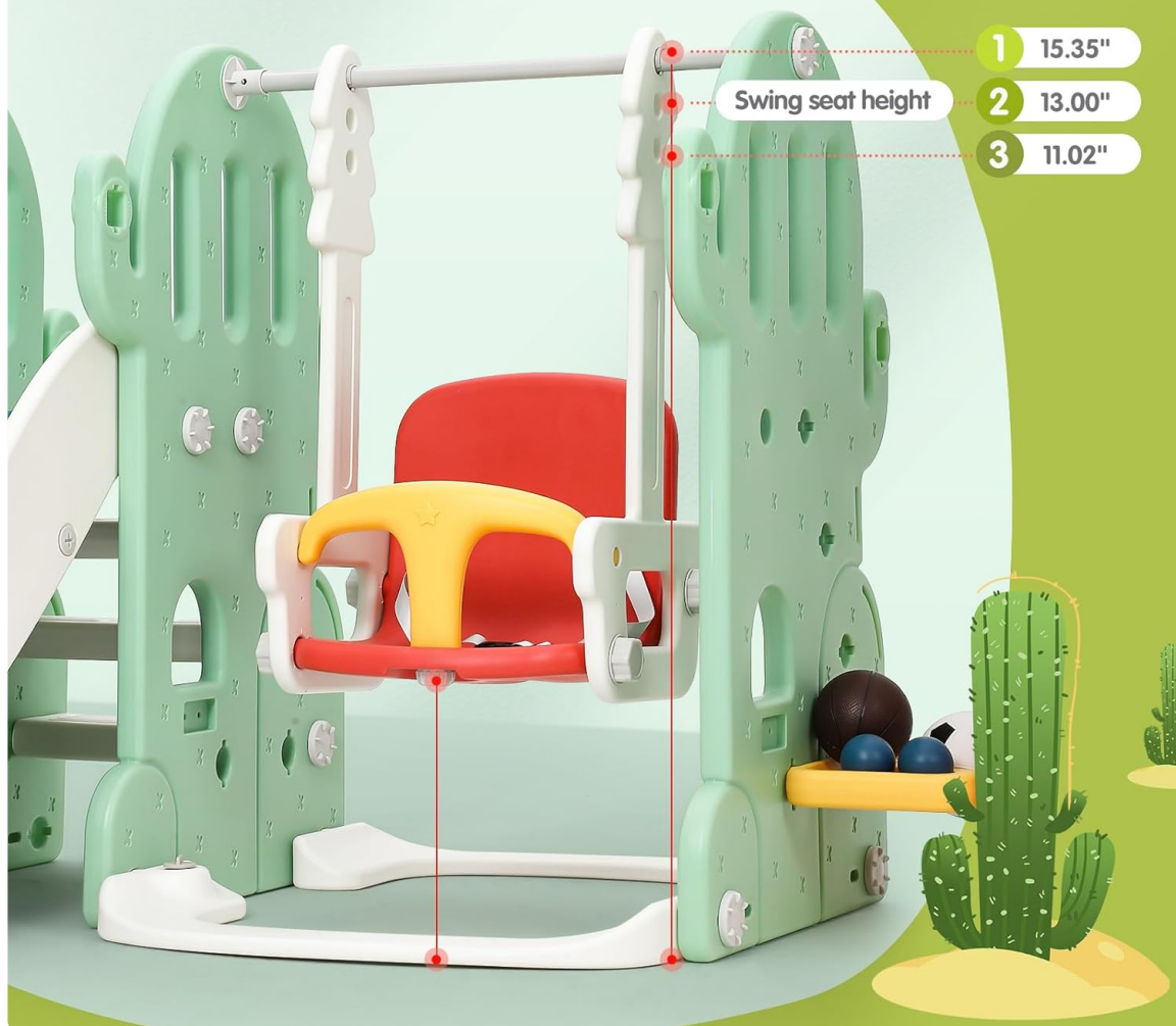
Figure 4.2: Adjustable swing seat height.