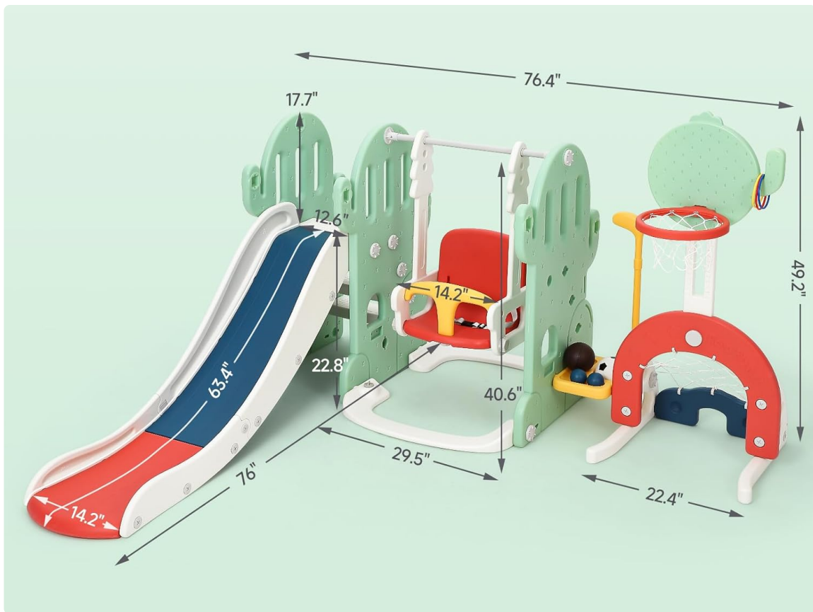
Figure 7.1: Product Dimensions.