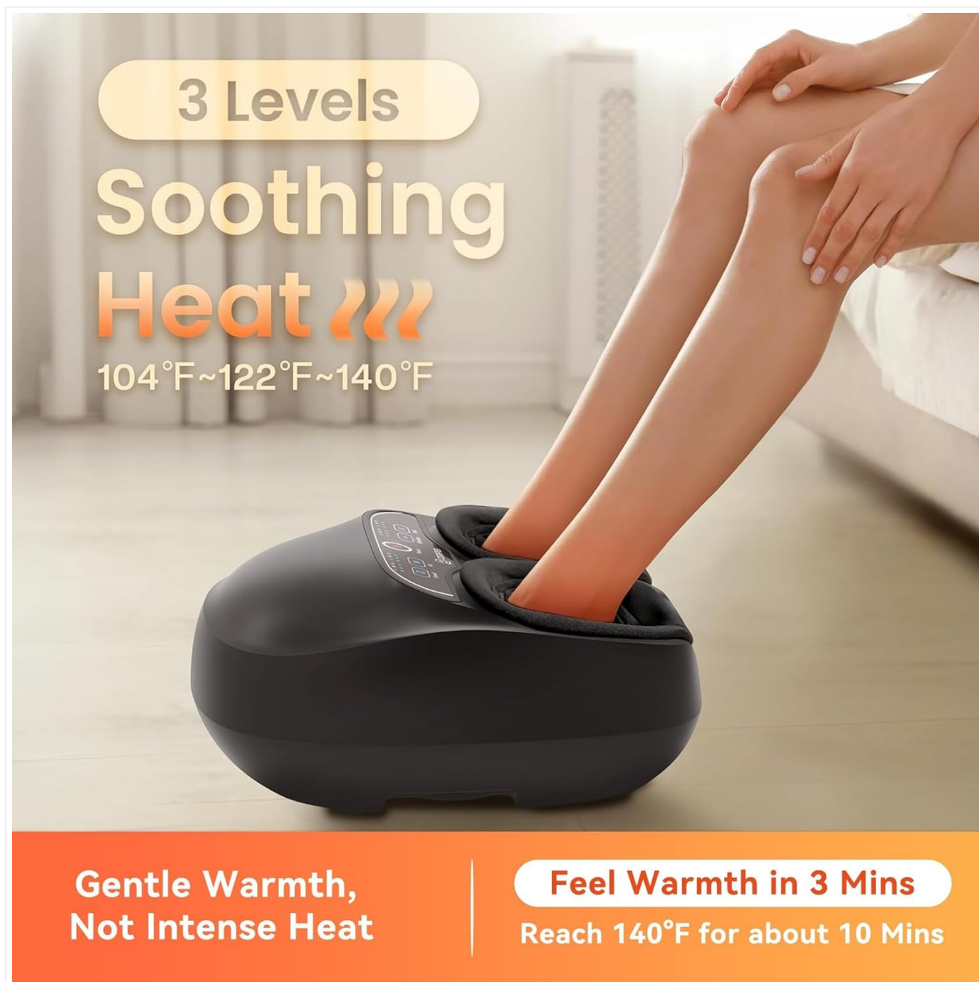
Image 5: Visual representation of the three soothing heat levels available on the foot massager, ranging from 104°F to 140°F, providing gentle warmth.