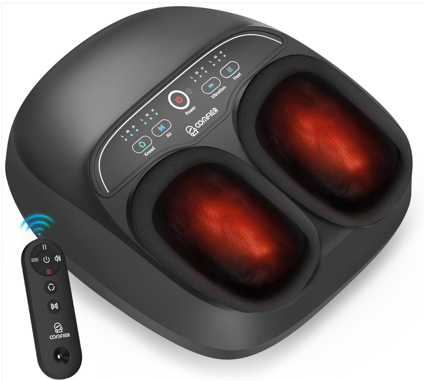
Image 1: The COMFIER Foot Massager Model CF-5310, showing the main unit with foot inserts and the accompanying remote control.