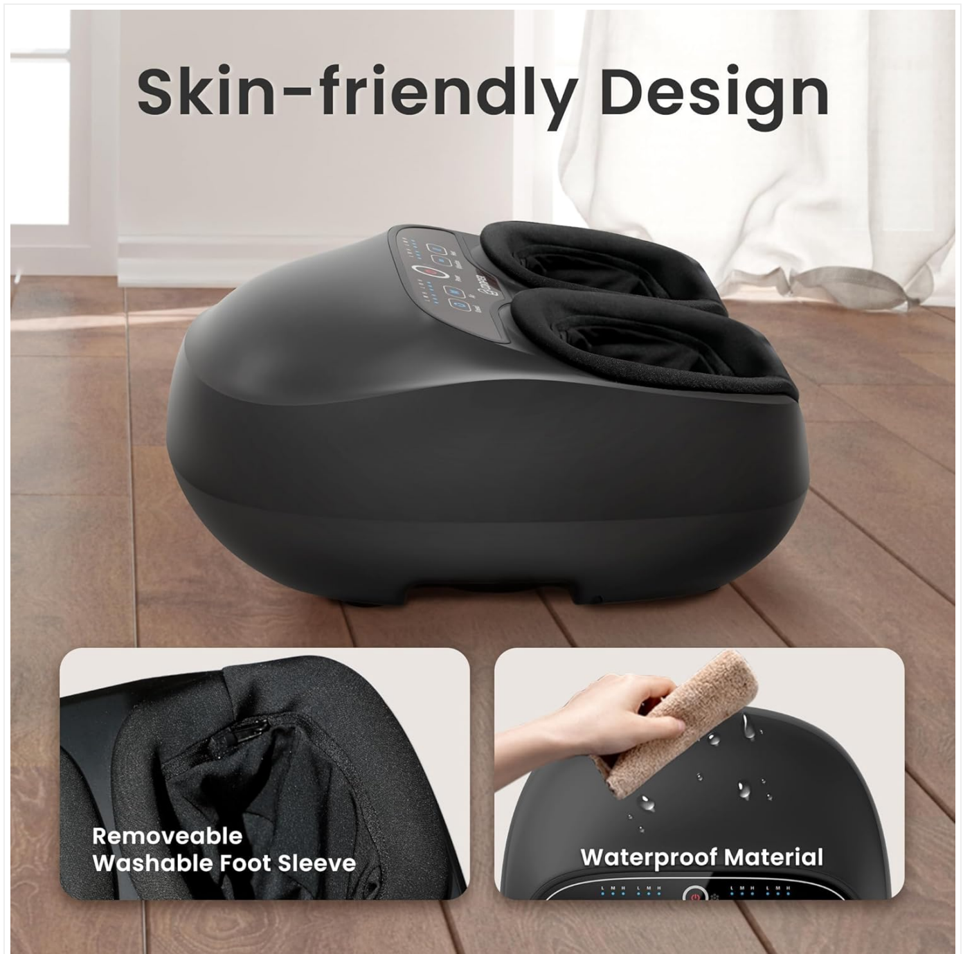
Image 6: Demonstrates the skin-friendly design, highlighting the removable and washable foot sleeve and the waterproof material of the massager's exterior for easy cleaning.