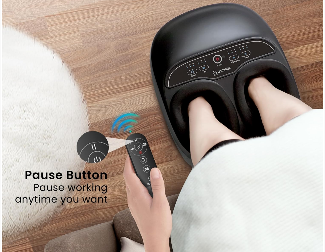
Image 3: Close-up of the foot massager's touch panel and the remote control, highlighting the various function buttons for power, massage modes, and heat.