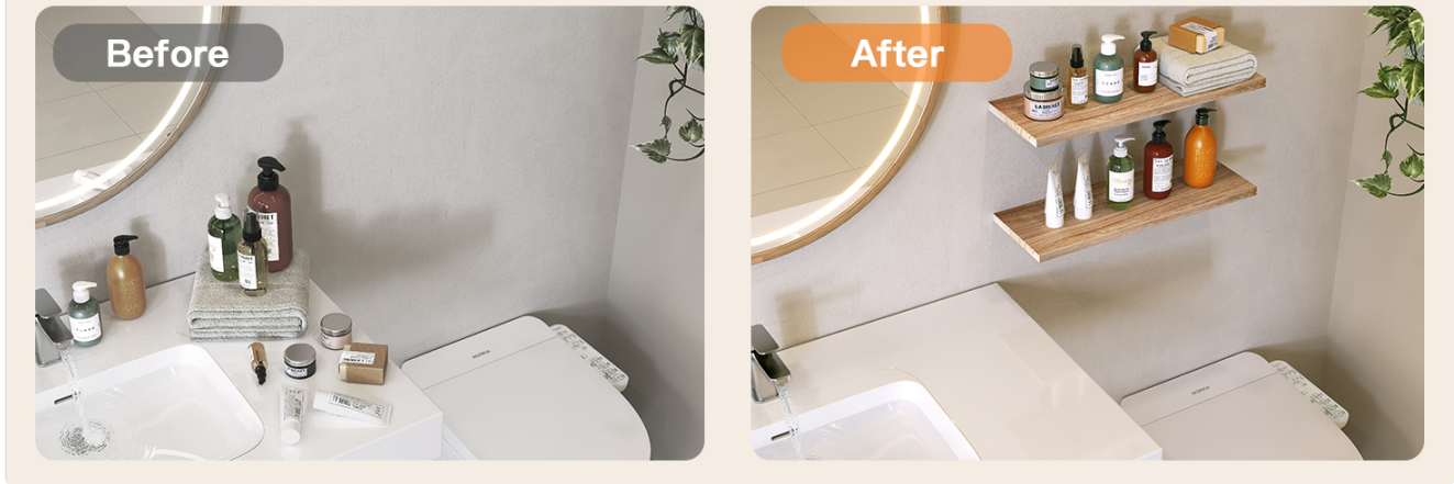
Image: Illustration of how the shelves help free up counter space.