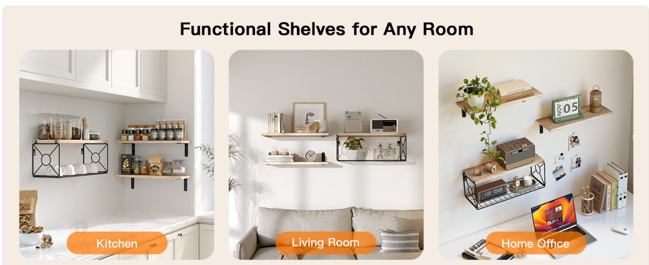
Image: Examples of functional shelf usage in various home environments.