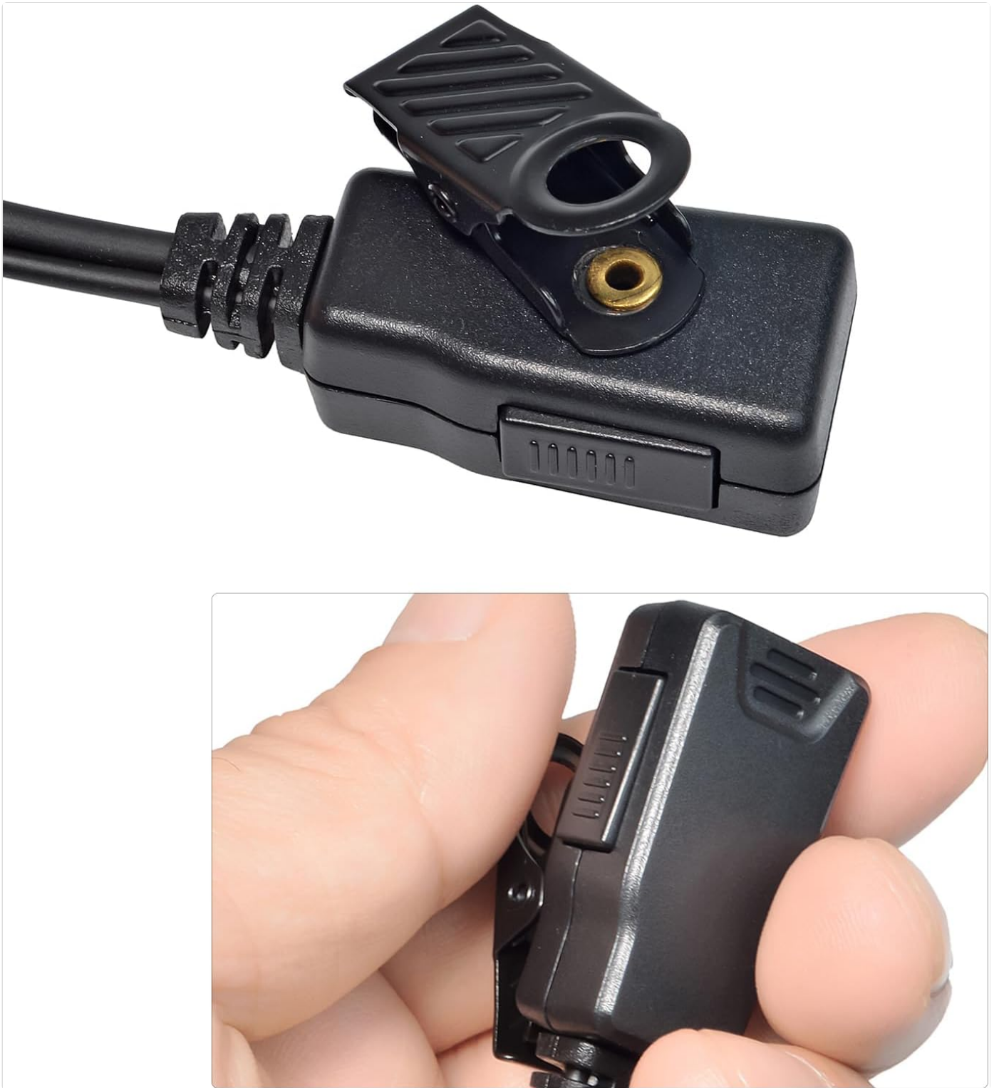
Image: Close-up of the PTT (Push-to-Talk) button and the durable metal clip, demonstrating its ergonomic design for easy activation.