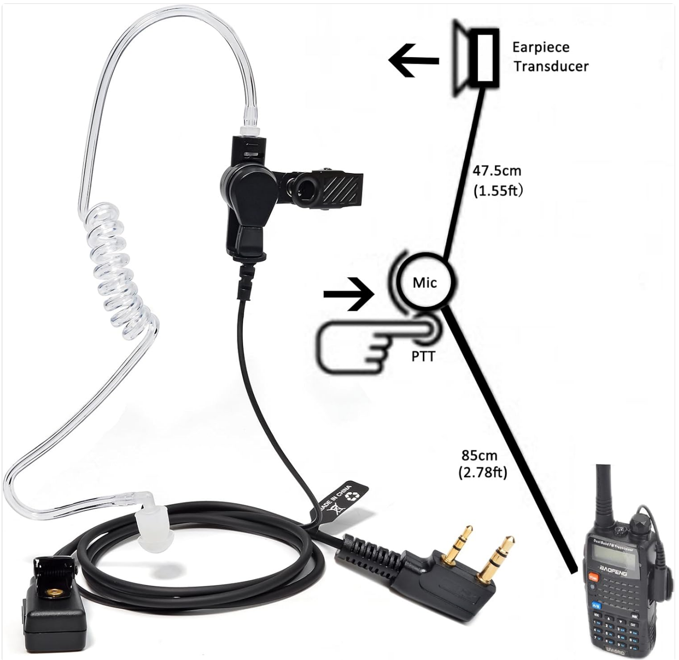
Image: A diagram illustrating the earpiece transducer, microphone, PTT button, and 2-pin connector, along with their approximate cable lengths and connection to a two-way radio.