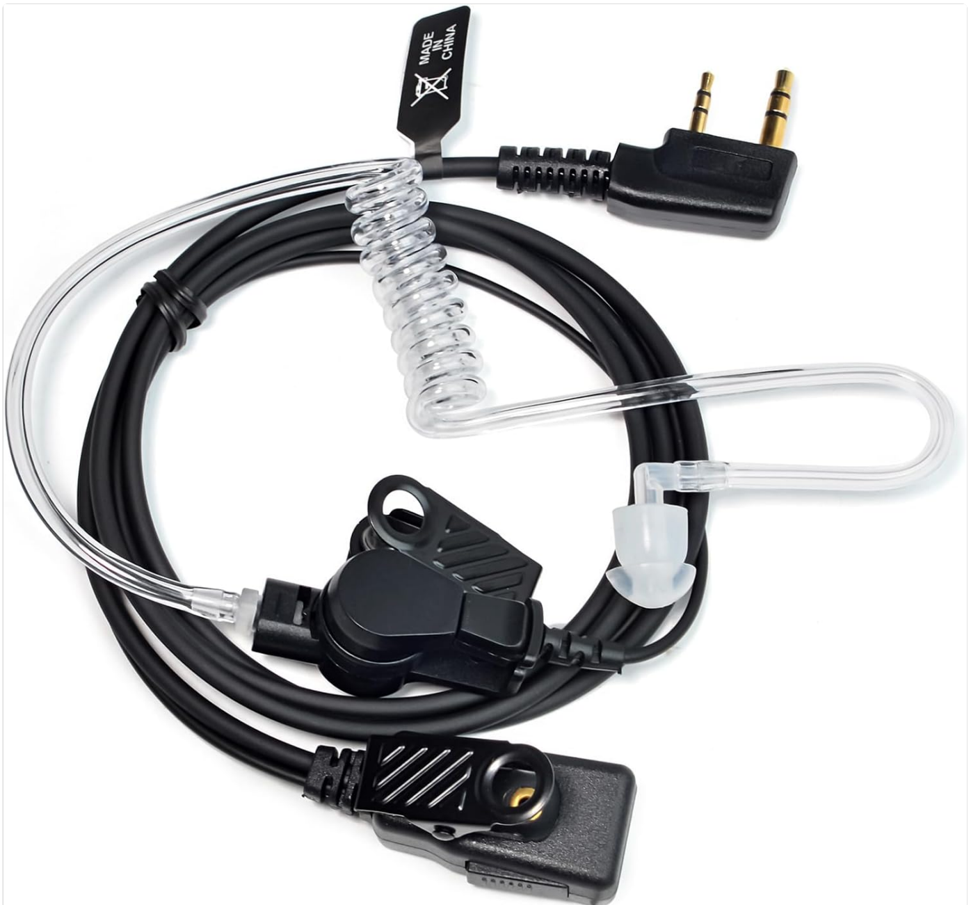
Image: Another view of the HYS K 2-Pin Acoustic Tube Earpiece, highlighting its various components and overall design.