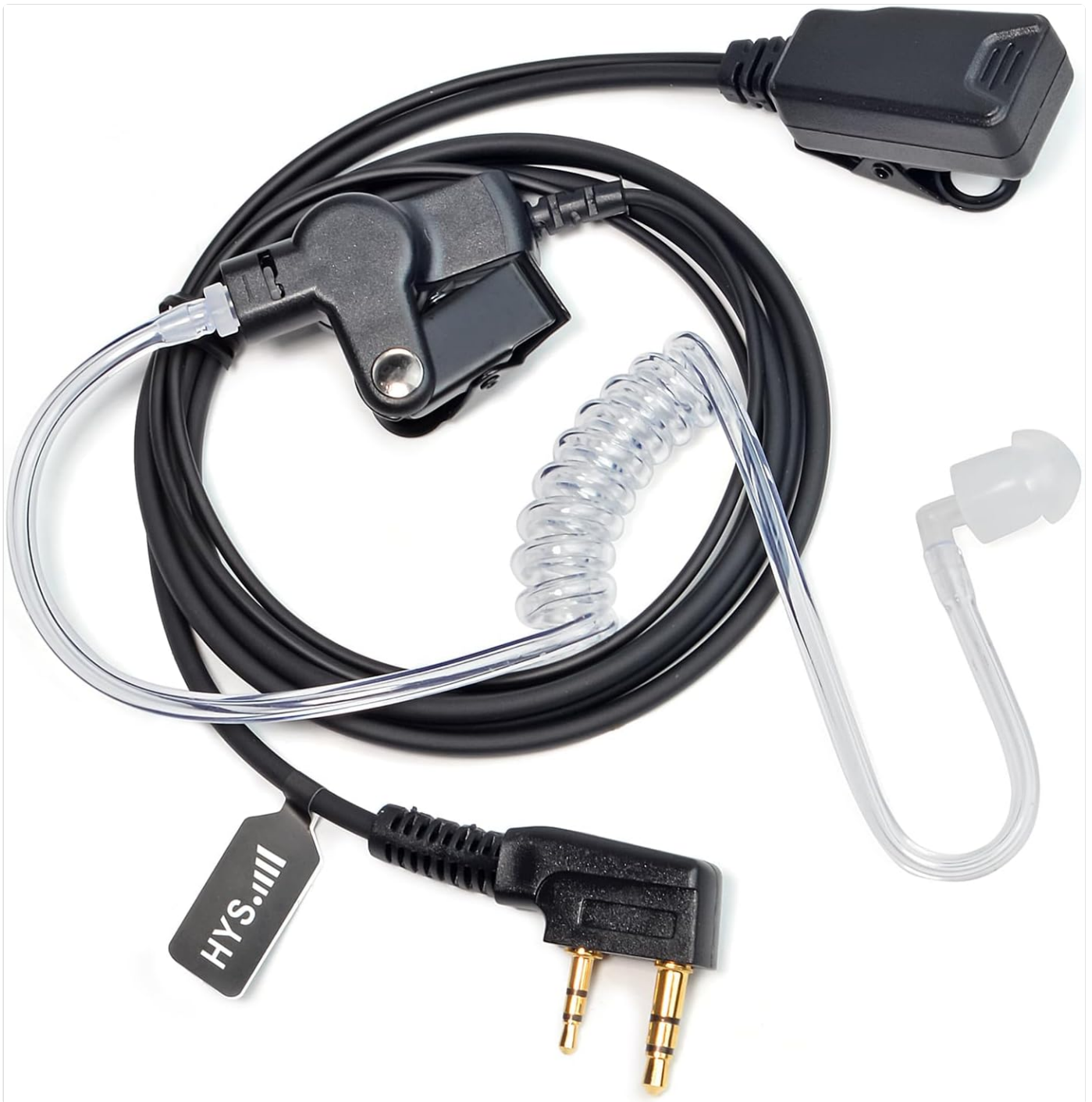
Image: Complete HYS K 2-Pin Acoustic Tube Earpiece with Microphone, showing the 2-pin connector, PTT button, and clear acoustic tube.