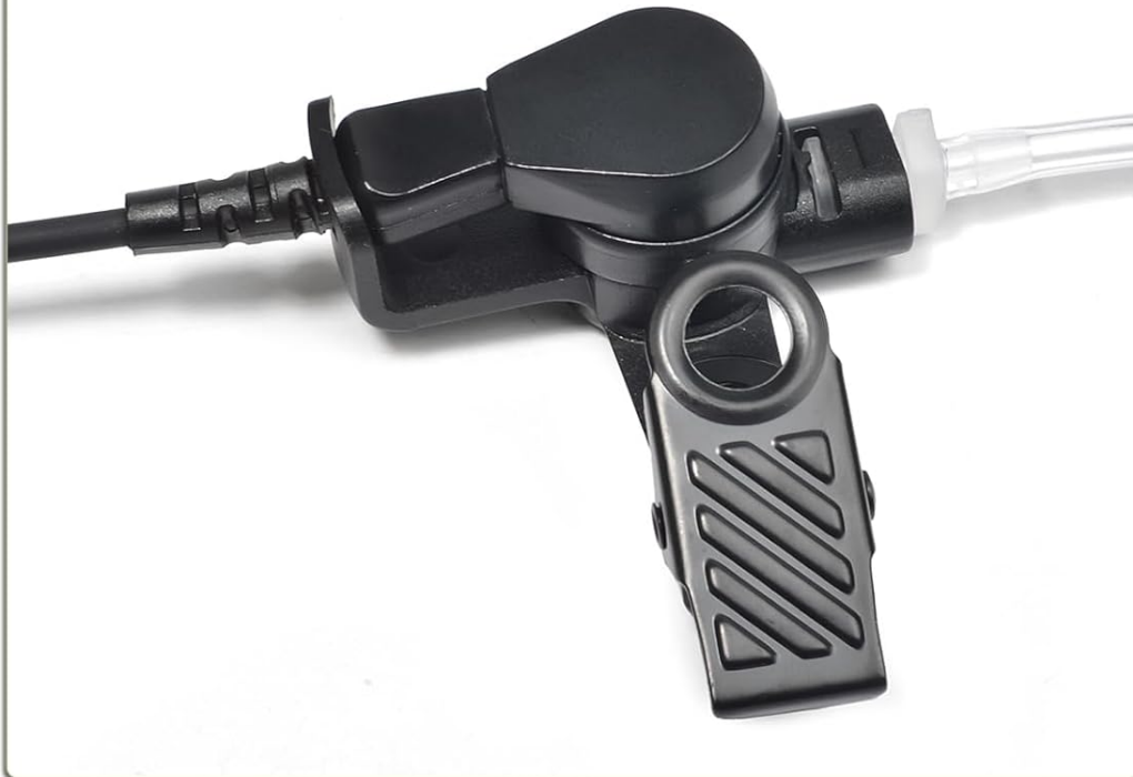
Image: Close-up of the quick disconnect adapter, allowing for easy separation of the acoustic tube from the main cable for hygiene or replacement.